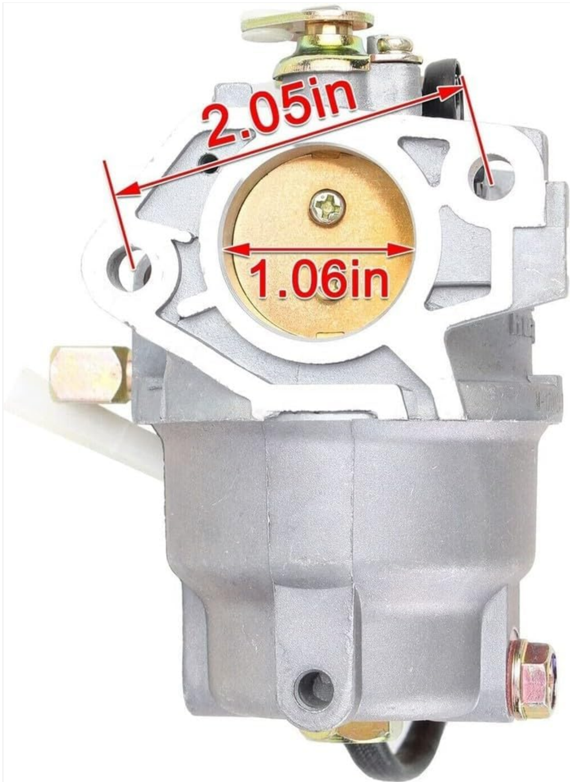
Figure 3: Front view of the carburetor with approximate dimensions indicated (e.g., 2.05in and 1.06in). These measurements are critical for ensuring compatibility.