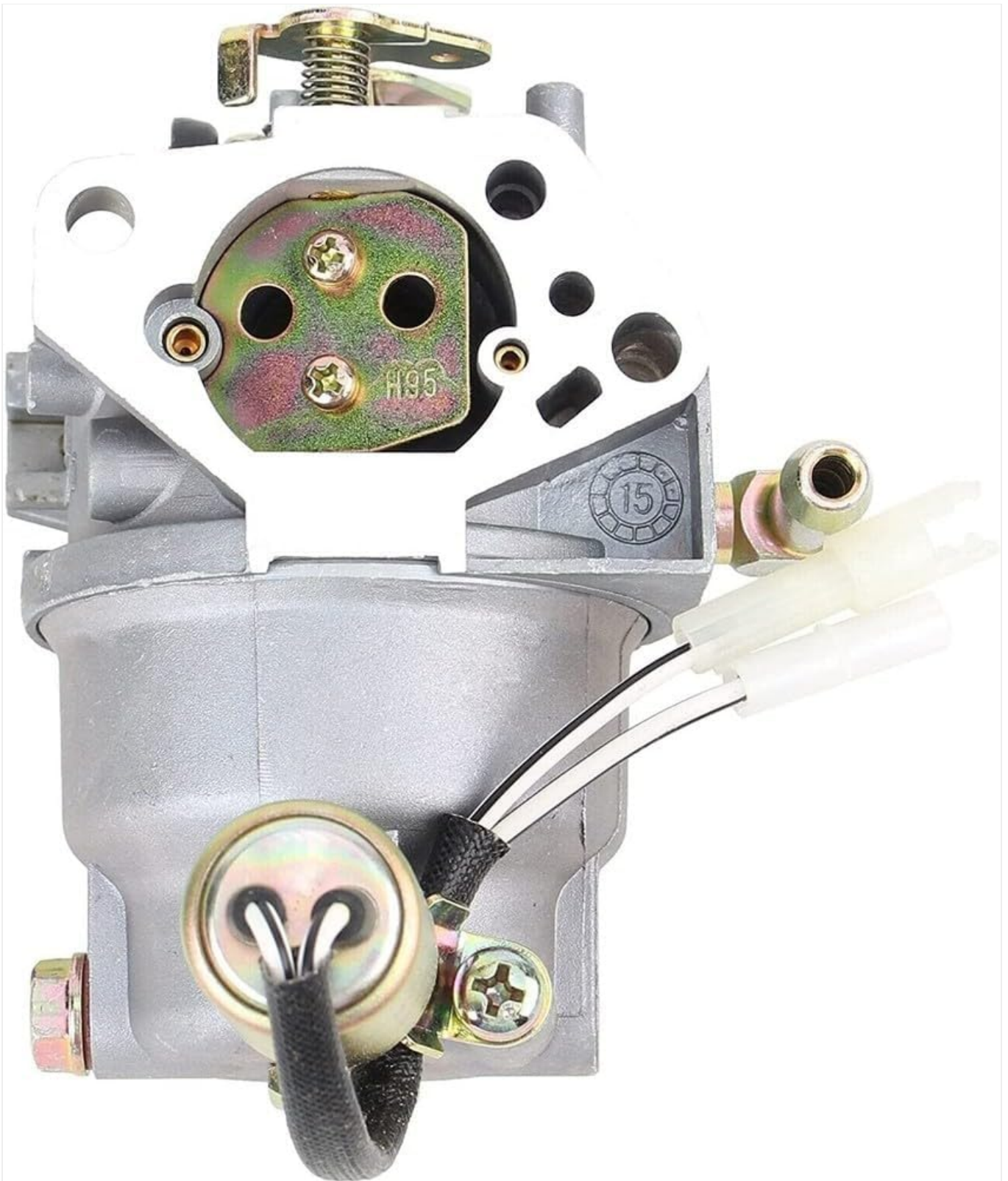
Figure 2: A side view of the carburetor, showing the solenoid and wiring connections. Proper connection of these wires is crucial for the carburetor's function.