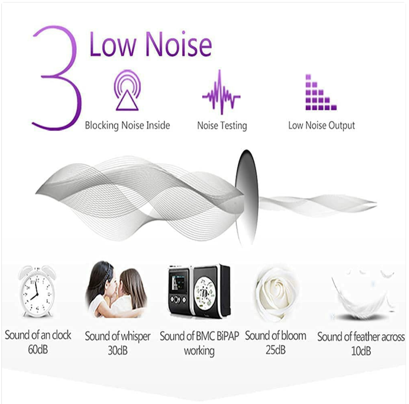
Figure 7: A graphic demonstrating the low noise output of the BiPAP device, comparing its sound level to common quiet sounds like a whisper or a blooming flower, emphasizing its noise reduction technology.

7. Power Off: To end therapy, press the power button. The device will power down.