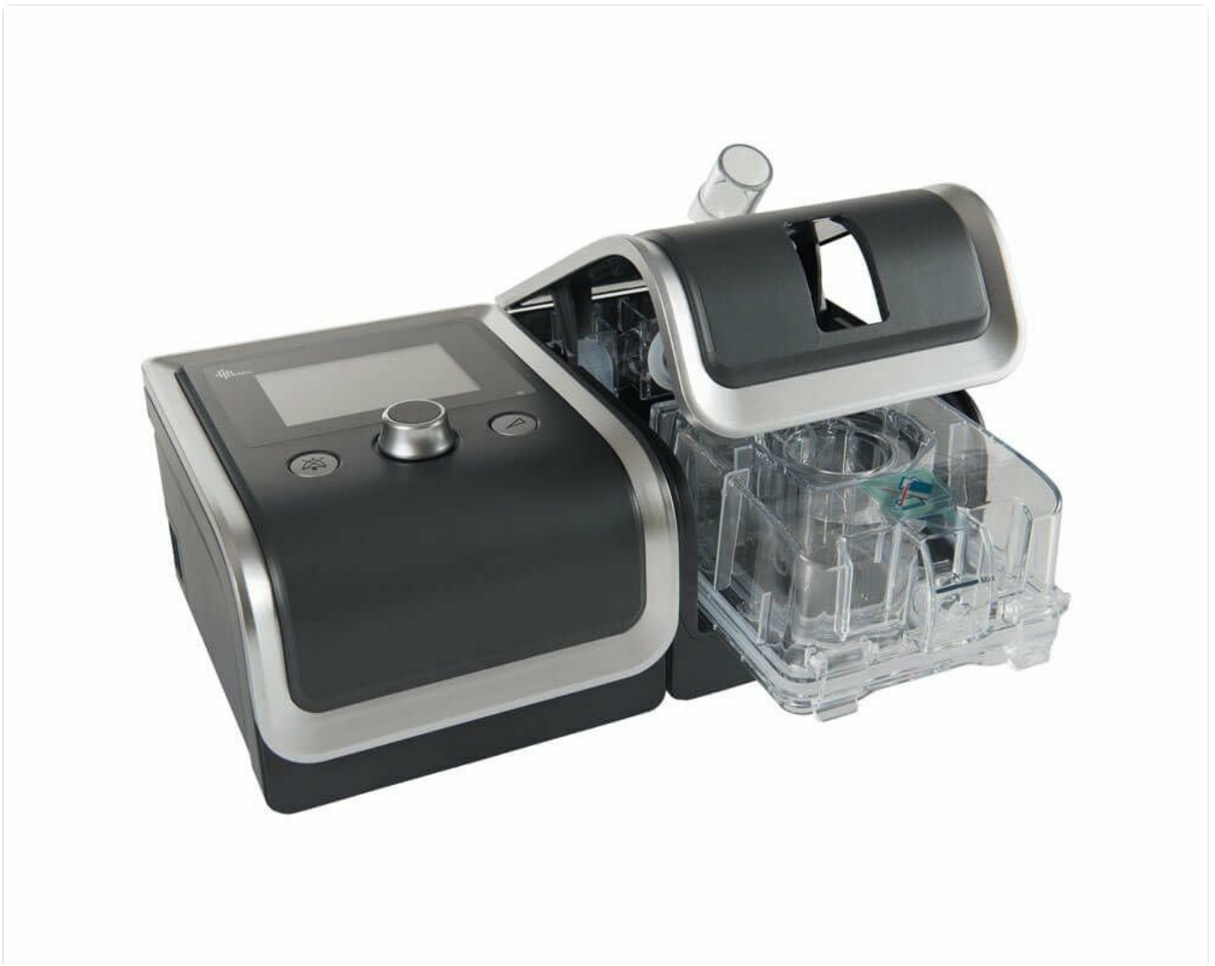
Figure 3: The BiPAP device with its humidifier chamber slid open, revealing the water tank ready for filling. This illustrates how the humidifier integrates with the main unit.