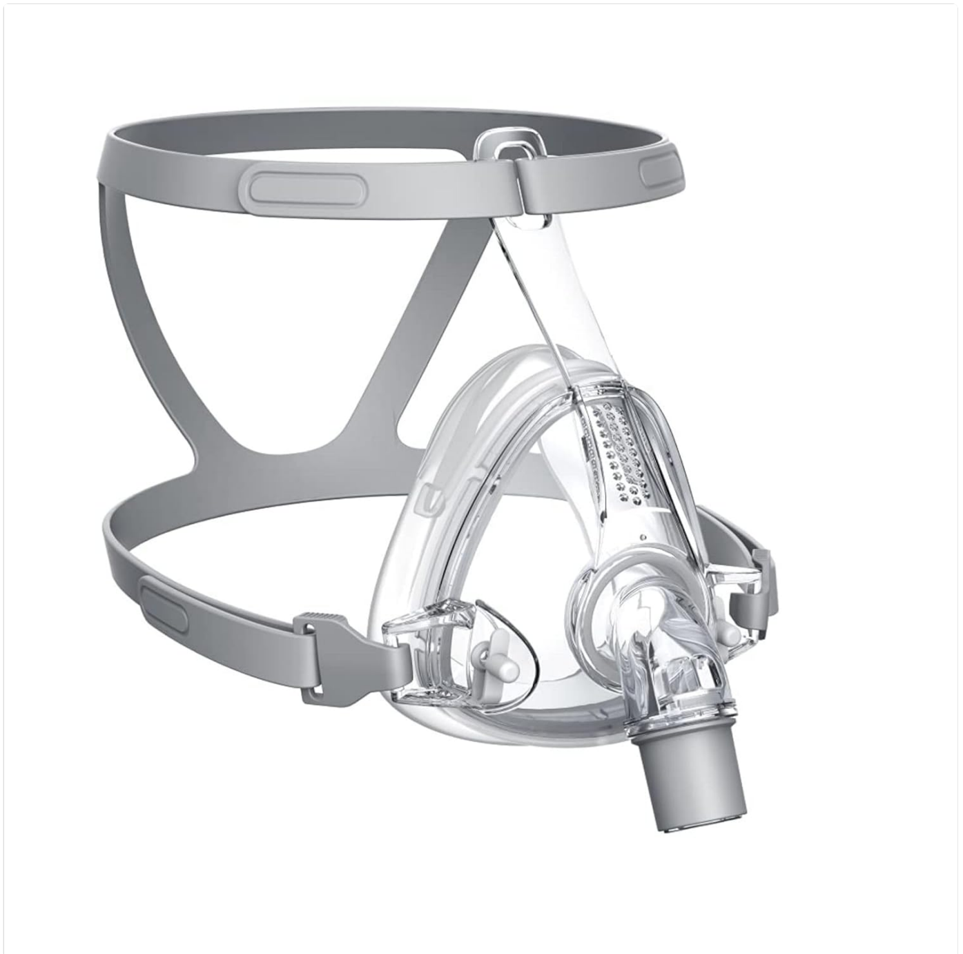
Figure 2: Detailed view of the full face mask, showing its clear plastic frame, soft silicone cushion, and adjustable headgear straps designed for comfortable and secure fit during therapy.