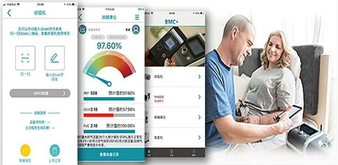
Figure 6: An illustration depicting the online data center functionality, including mobile app interface for viewing therapy data, cloud storage, and QR code scanning for easy access to sleep condition reports.