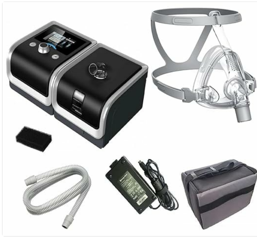
Figure 1: Overview of the BMC RESmart G2 Y25T BiPAP system and its included accessories. This image displays the main BiPAP unit, the detachable humidifier, a full face mask, flexible air tubing, the power adapter, and a black carry bag, along with a spare air filter.