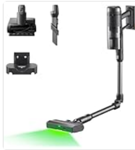
Figure 4: The roborock H60 Ultra conveniently stored on its wall mount, ready for charging.

The included wall mount allows for convenient storage and charging. Choose a suitable location near a power outlet and secure the wall mount using appropriate fasteners (not included, but typically screws and wall anchors).