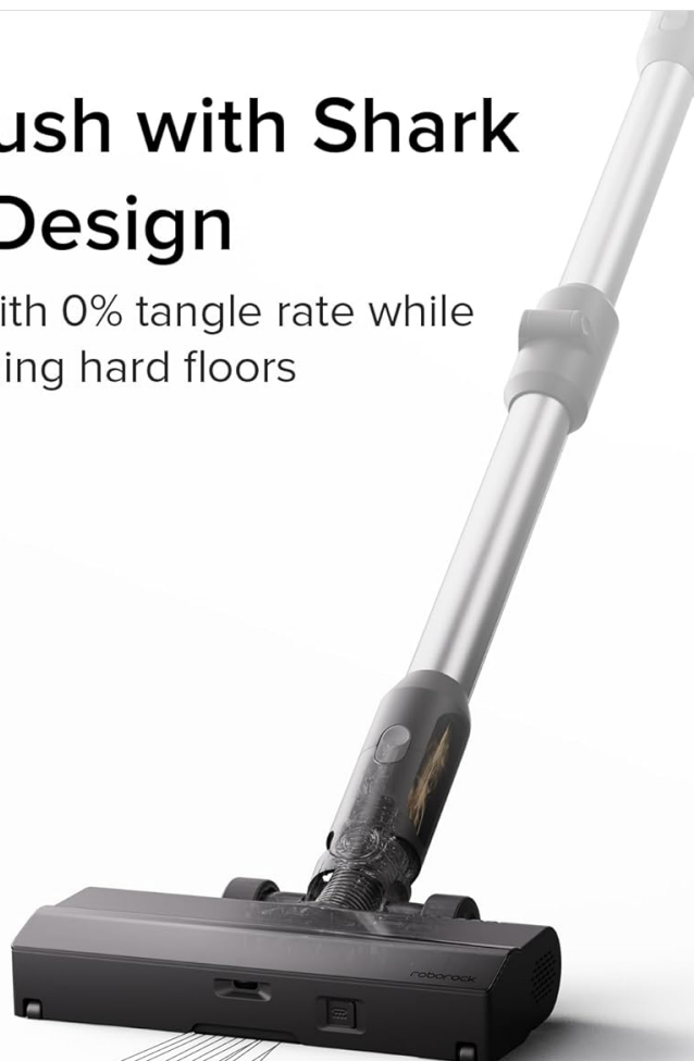
Figure 7: The Anti-Tangle Brush with its unique shark tooth design, minimizing hair entanglement.