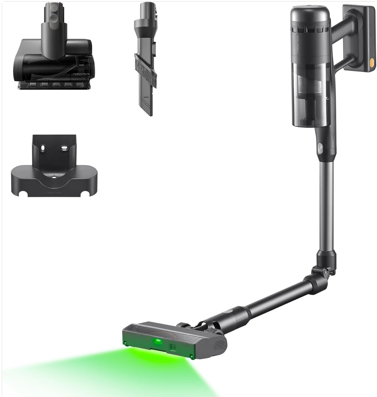
Figure 2: The roborock H60 Ultra vacuum cleaner in its full assembly with various attachments.

Video 1: Demonstrates the precision and maneuverability of the Roborock H60 Ultra during cleaning tasks.