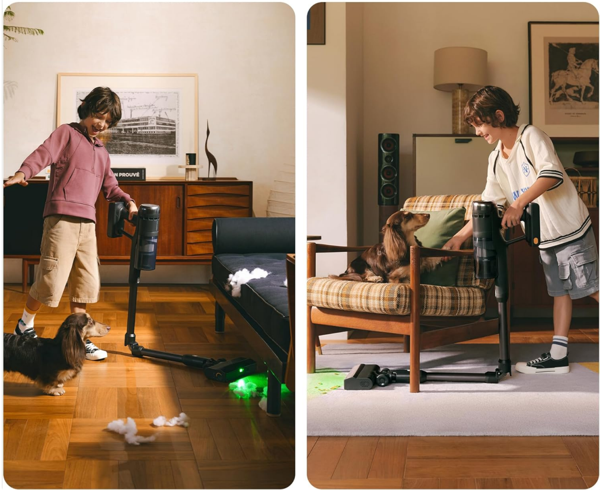
Figure 5: The flexible bendable tube allows the vacuum to reach under furniture for comprehensive cleaning.

Video 2: An overview of the roborock H60 Ultra Stick Vacuum Cleaner's features and usage.