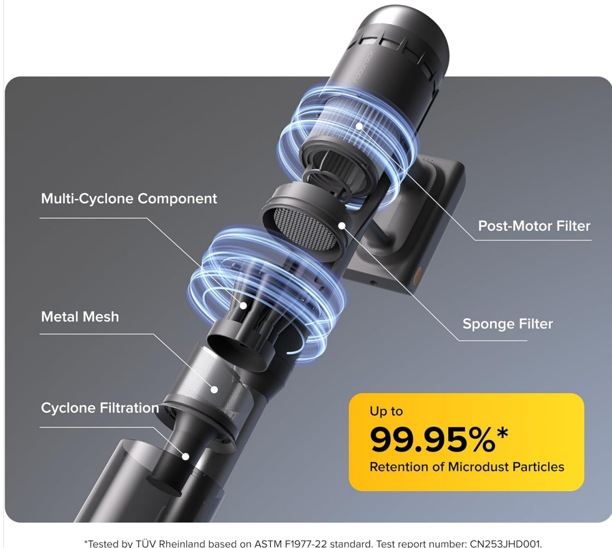
Figure 6: Exploded view of the 5-stage filtration system, highlighting the Multi-Cyclone Component, Metal Mesh, Cyclone Filtration, Sponge Filter, and Post-Motor Filter.