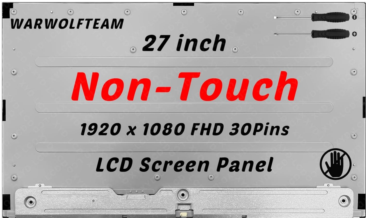
Figure 1: Overview of the WARWOLFTEAM 27-inch Non-Touch LCD Screen Panel, highlighting key specifications and included tools.