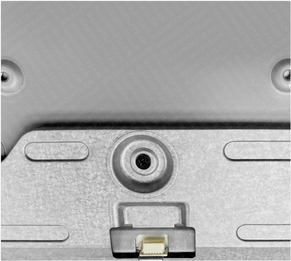
Figure 2: Detail of the 30-pin video connector on the replacement screen panel.