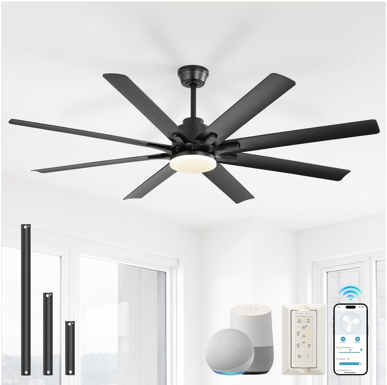
Image: The Sofucor 52 Inch Smart Indoor/Outdoor Ceiling Fan with its 8-blade design and integrated light, shown with various control accessories.