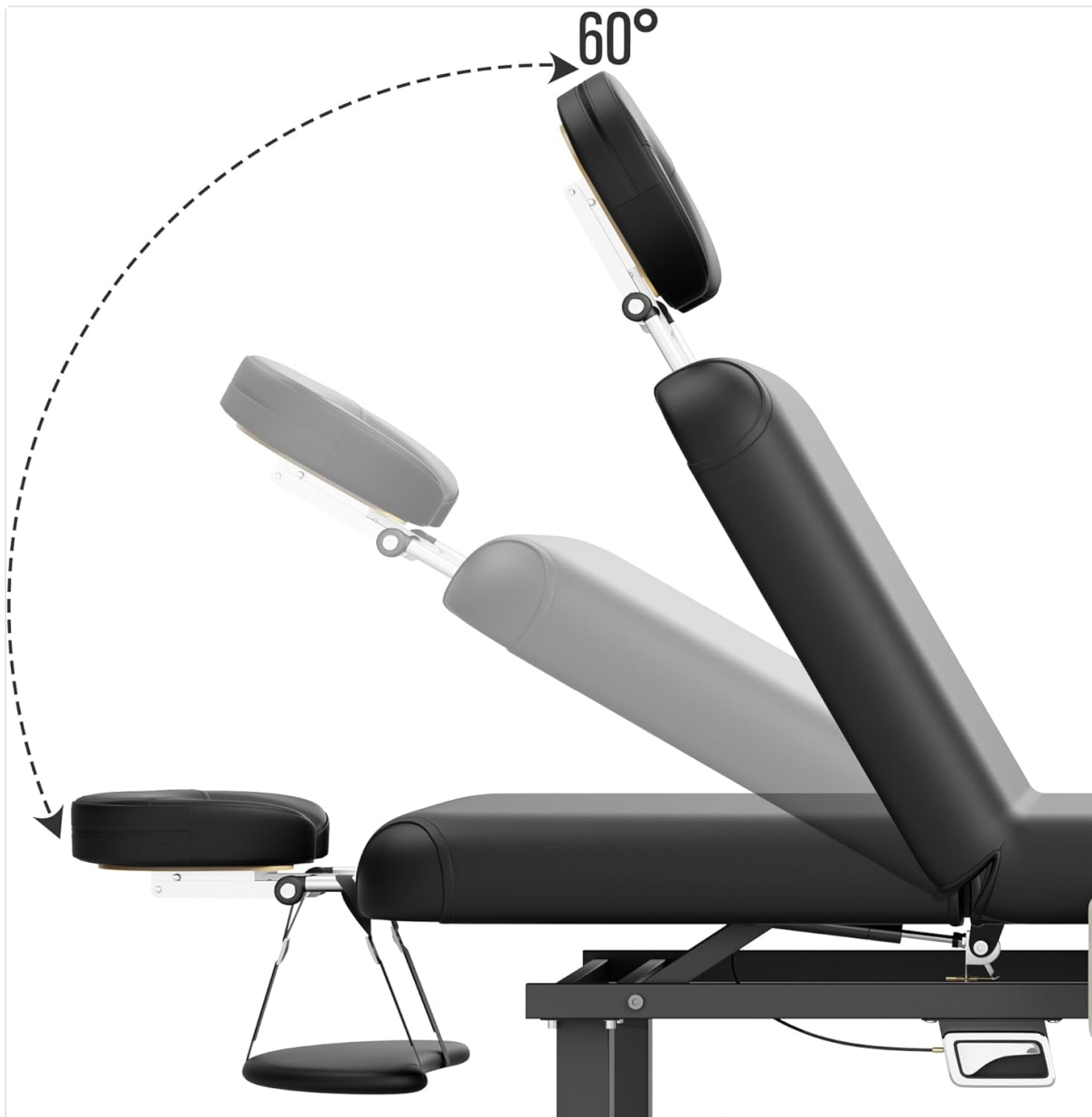
Figure 3: Diagram illustrating the backrest adjustment mechanism, showing an angle of up to 60 degrees.