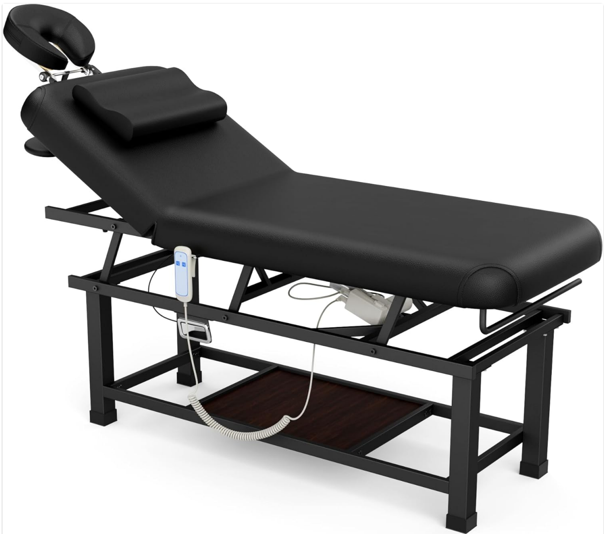
Figure 1: Fully assembled pouseyar Electric Stationary Massage Table, showing the main components including the face cradle, ergonomic pillow, and storage shelf.