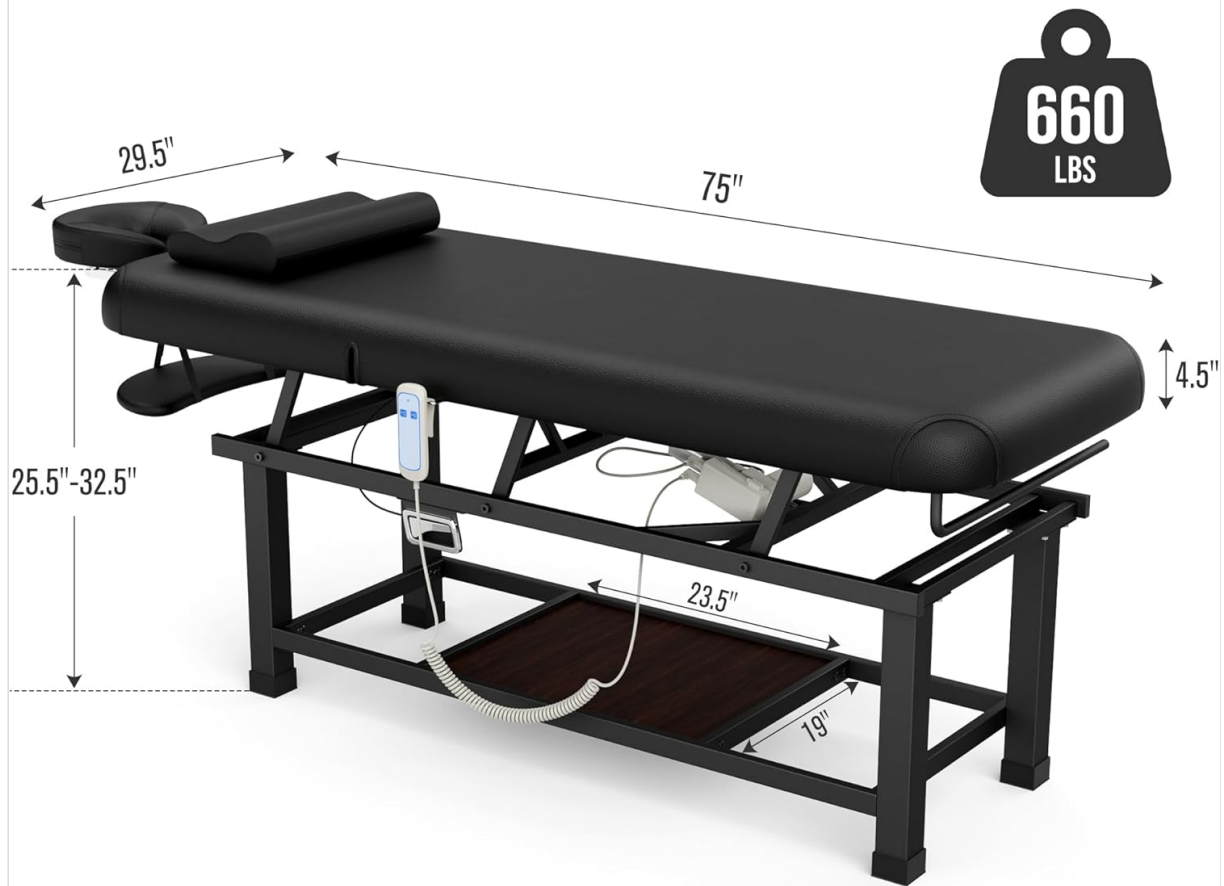
Figure 6: Detailed dimensions of the massage table, including length, width, height range, and load capacity of 660 lbs.