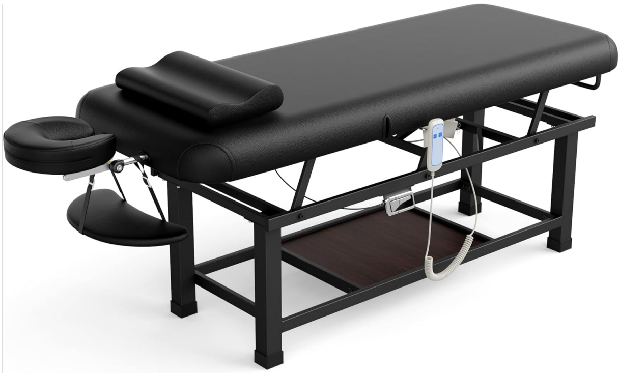
Figure 5: The integrated storage shelf, demonstrating its capacity for various professional supplies, keeping them organized and accessible.