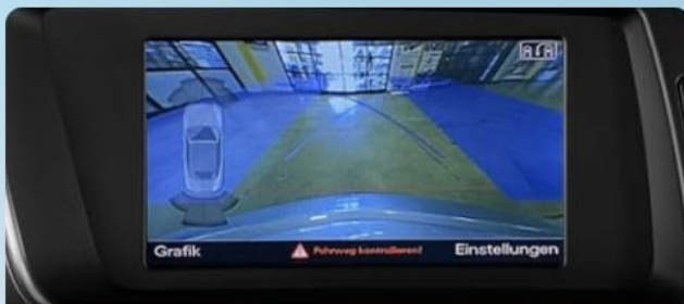
Backup Camera Display