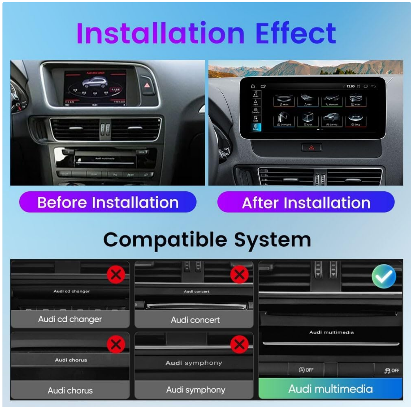
Figure 3.1: Comparison of the dashboard before and after installation, and a guide to identify compatible Audi multimedia systems. Ensure your vehicle has the 'Audi multimedia' system for compatibility.

Before installation, confirm your Audi Q5's original system is compatible. Refer to the image below to identify the correct system type.