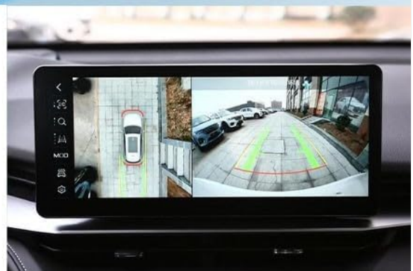
Figure 4.5: Diagram illustrating the concept of an optional 360-degree rear view camera system with views from left, right, front, and back cameras.