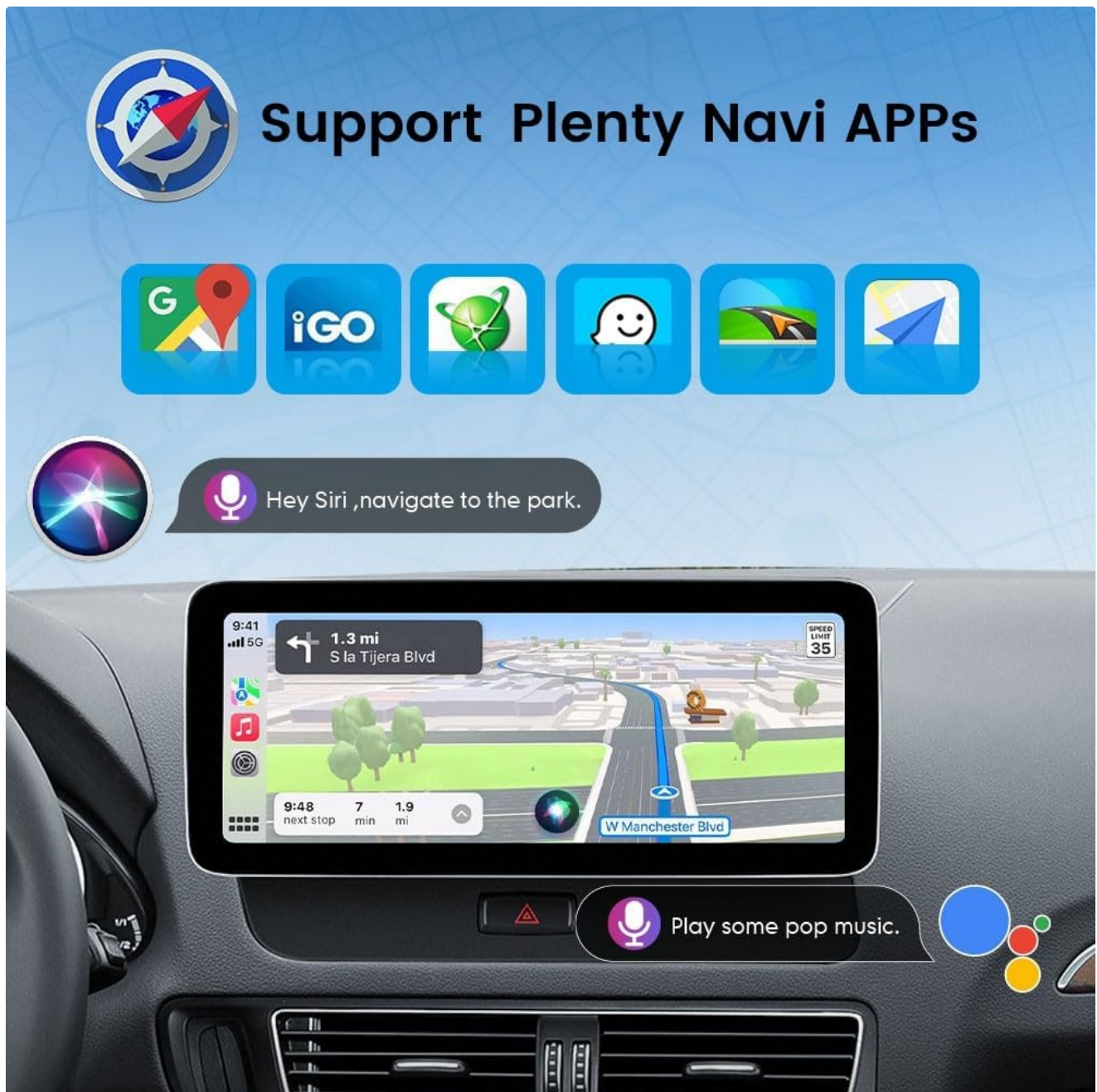
Figure 4.3: Display showing various navigation applications and examples of voice commands for navigation and music playback.