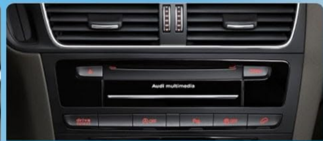
Original CD Player