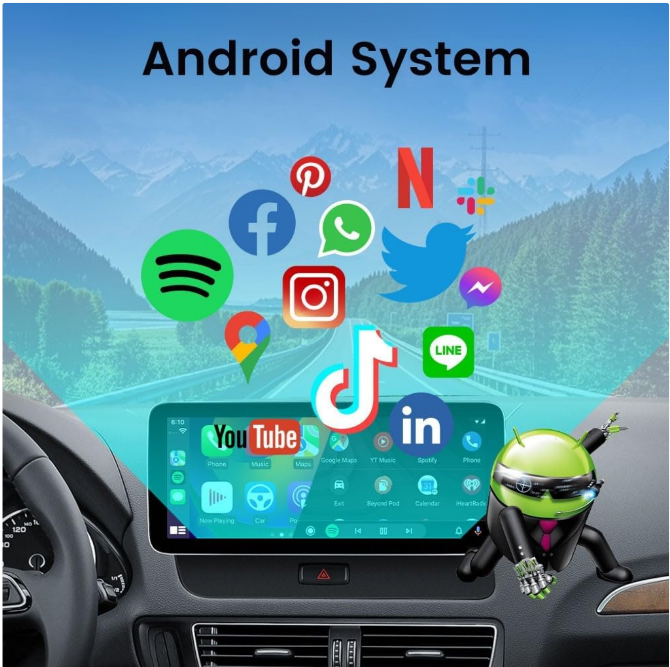
Figure 4.1: The Android system interface displaying various applications such as YouTube, Spotify, and navigation tools.

The KUNFINE Android Car Stereo operates on an Android system, providing access to various applications and features.