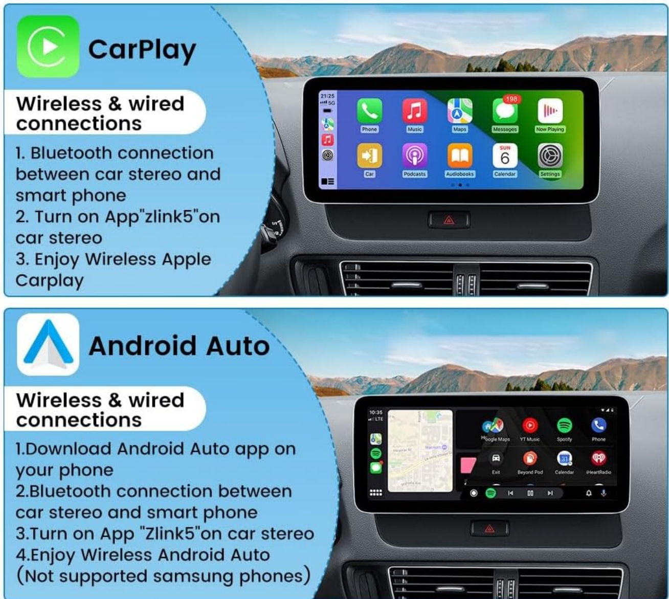
Figure 4.2: Step-by-step guide for connecting wireless Apple CarPlay and Android Auto, including Bluetooth pairing and using the 'zlink5' application.