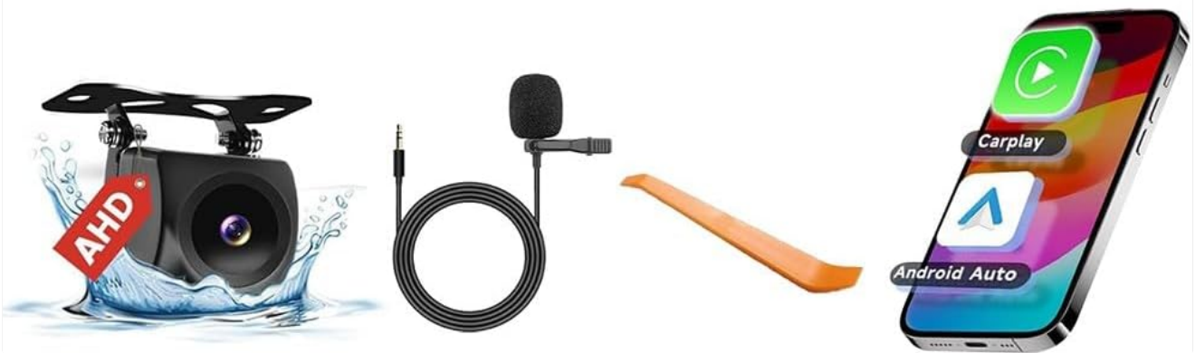
Figure 1.1: KUNFINE 12.3-inch Android Car Stereo with included components such as the display unit, AHD camera, microphone, installation tool, and a smartphone illustrating CarPlay/Android Auto functionality.