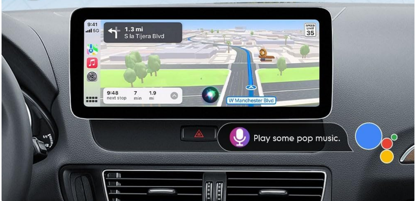
Image: The car stereo screen showing a navigation map with icons for various navigation apps and voice assistant prompts like "Hey Siri, navigate to the park."