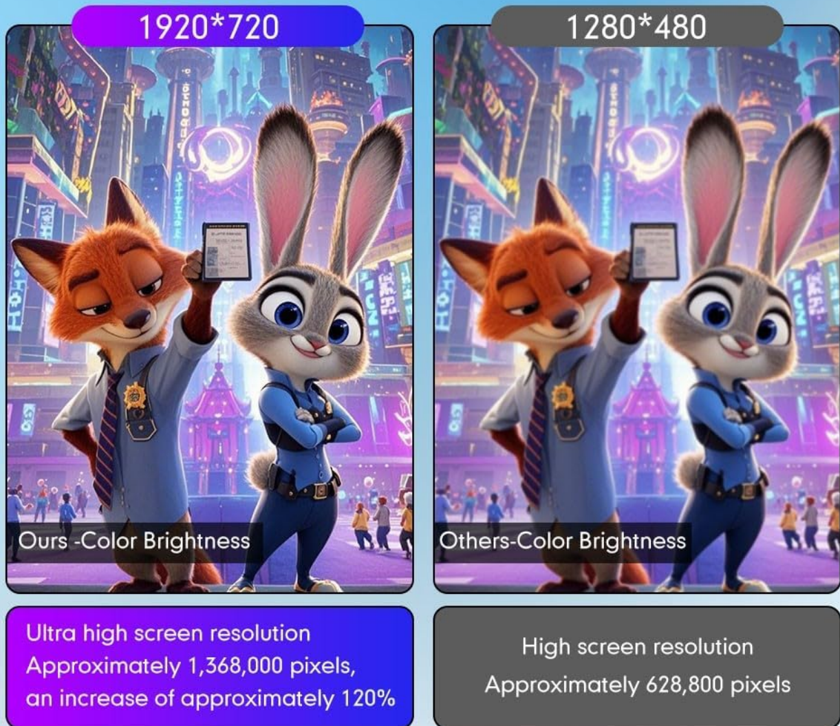
Image: Resolution comparison illustrating the superior clarity of the 1920x720 display (approximately 1,368,000 pixels) compared to a 1280x480 display.