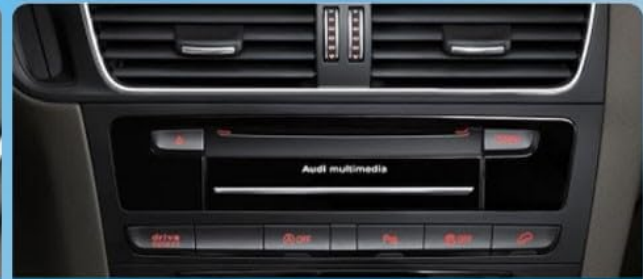
Original CD Player