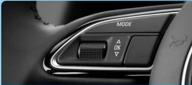
Steering Wheel Control Function