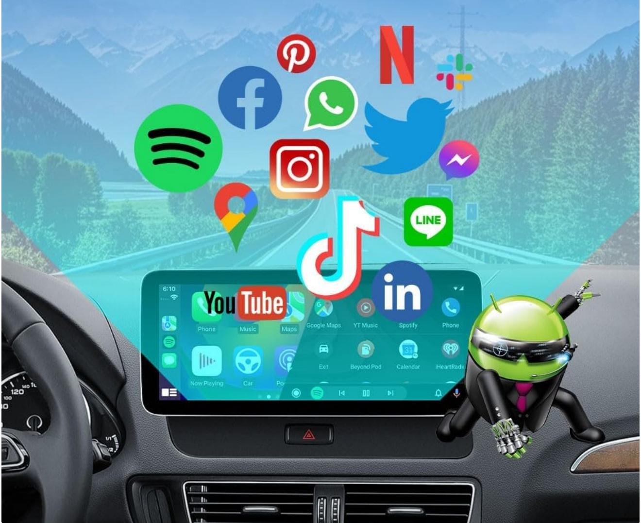
Image: The Android system interface on the car stereo, showing icons for popular apps like YouTube, Spotify, Google Maps, and social media.