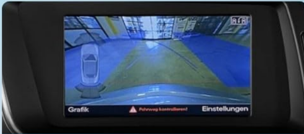
Backup Camera Display