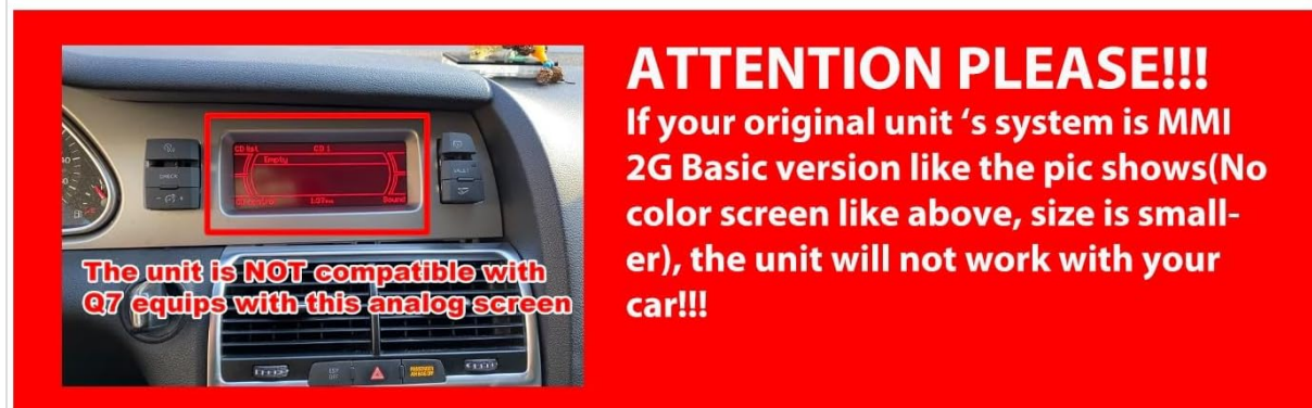
Image Description: This image illustrates the visual differences between the Audi Q7 MMI 2G (2005-2009) and MMI 3G (2010-2015) systems. The MMI 2G system typically features a smaller, non-color screen in the dashboard, while the MMI 3G has a larger, color display. Ensure your vehicle matches the MMI 2G configuration shown for proper compatibility.