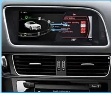
Steering Wheel Control