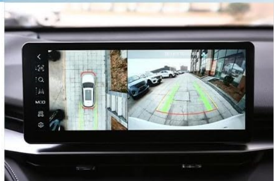
Image Description: This image illustrates an optional 360-degree rear view camera system, showing views from front, back, left, and right cameras, along with a combined top-down view on the head unit display. This feature enhances parking and maneuvering safety.