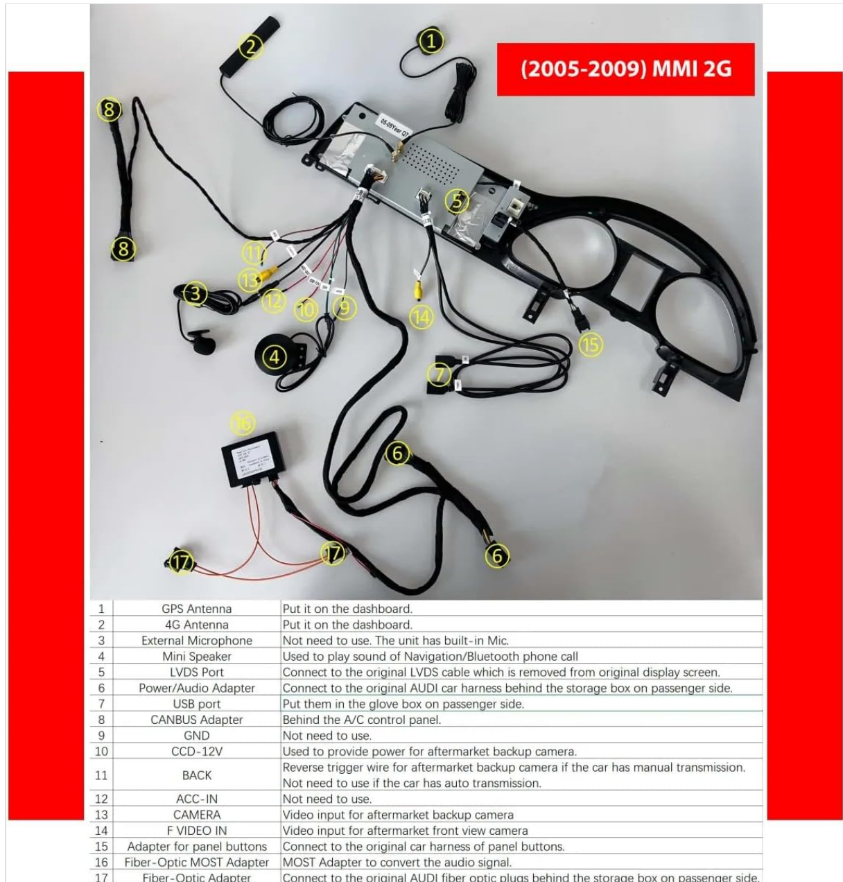
Image Description: This detailed wiring diagram shows the connections for the KUNFINE head unit in an Audi Q7 with MMI 2G (2005-2009). Key connections include GPS Antenna, 4G Antenna, External Microphone, Mini Speaker, LVDS Port, Power/Audio Adapter, USB Port, CANBUS Adapter, GND, CCD-12V, BACK, ACC-IN, CAMERA, VIDEO IN, Adapter for panel buttons, MOST Adapter, and Fiber-Optic Adapter. Each connection is numbered and described in the accompanying table for clarity.