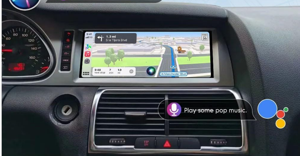
Image Description: This image shows the head unit displaying various navigation applications, including Google Maps and iGO. It also illustrates the use of voice commands (e.g., "Hey Siri, navigate to the park" or "Play some pop music") for hands-free control, enhancing safety while driving.