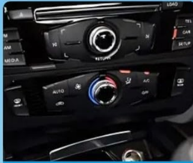
Original Car Knob Control