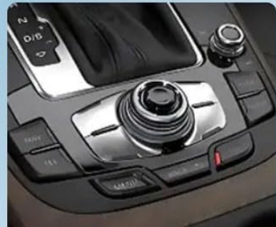
Keep Original Stereo

Image Description: This image highlights the integration of the KUNFINE head unit with existing Audi Q7 features. It shows support for steering wheel controls, original car knob control, original rear camera, maintaining the original MMI system, keeping the original CD player, and preserving the original stereo.