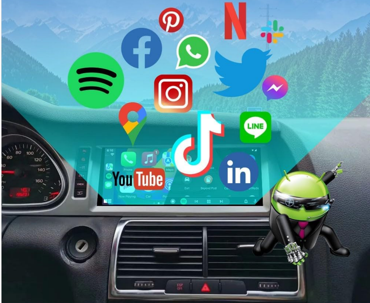
Image Description: This image displays the Android system interface of the head unit, showing various pre-installed and downloadable applications such as Spotify, Netflix, YouTube, Google Maps, and social media apps. This demonstrates the unit's capability to run a wide range of Android applications.