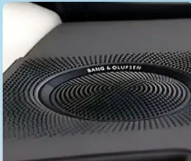
Maintain The Original System