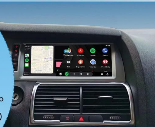
Image Description: This image demonstrates the user interfaces for both Apple CarPlay and Android Auto as displayed on the head unit. It highlights the wireless and wired connection methods for each, showing how smartphone applications are mirrored and controlled through the car's display.