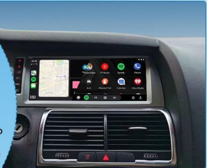
Image 5.2: Step-by-step guide for connecting Wireless CarPlay and Android Auto. For CarPlay, connect via Bluetooth, then open the "Zlink5" app on the car stereo. For Android Auto, download the app on your phone, connect via Bluetooth, and then open "Zlink5" on the car stereo. Note: Some Samsung phones may not be supported for wireless Android Auto.