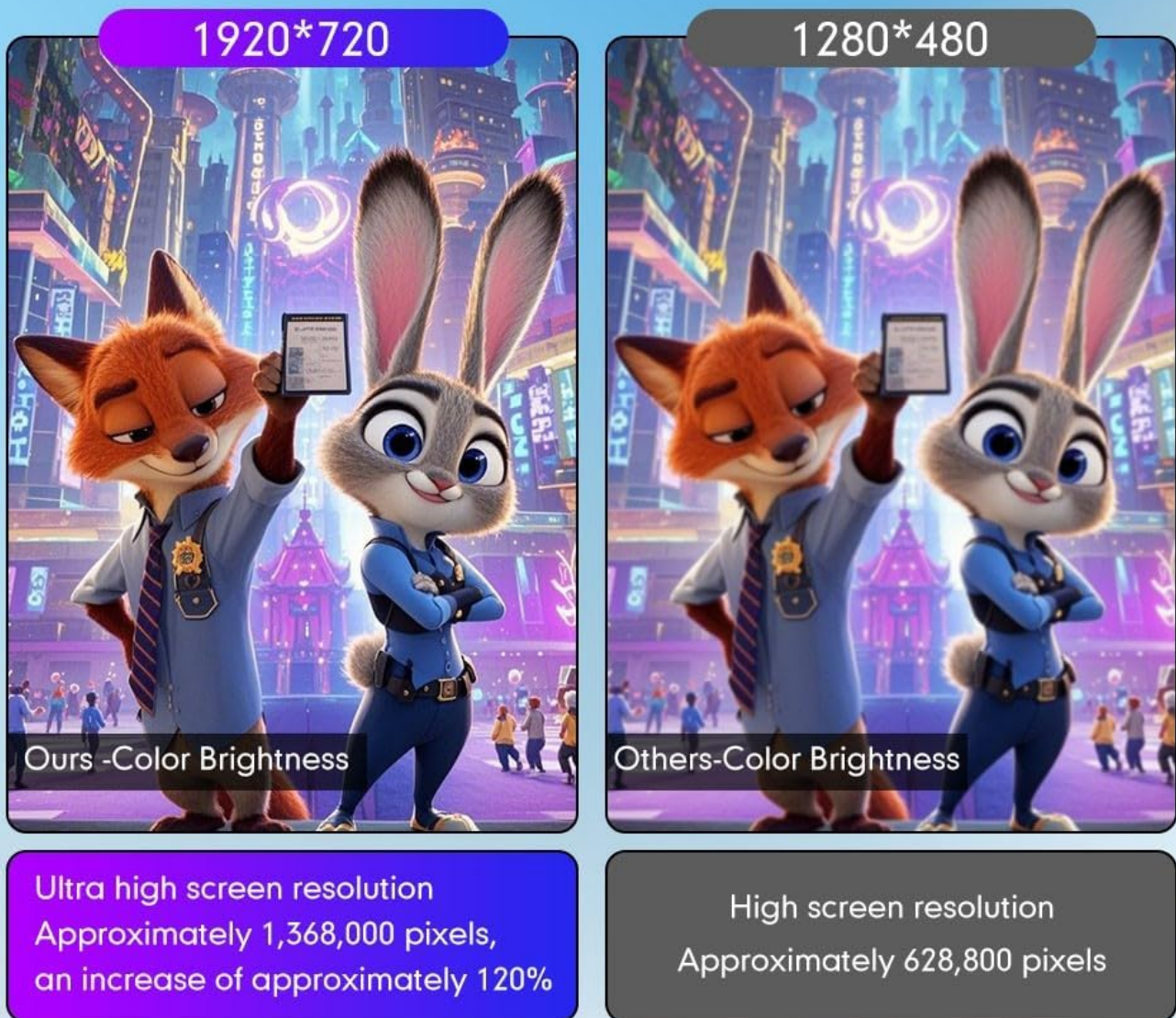
Image 6.1: A visual comparison highlighting the superior resolution of the KUNFINE head unit (1920x720 pixels) compared to standard displays (1280x480 pixels). The higher resolution provides approximately 120% more pixels for a clearer and more vibrant display.