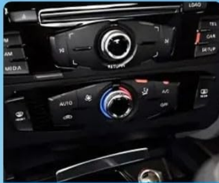
Original Car Knob Control