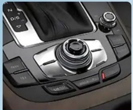
Keep Original Stereo