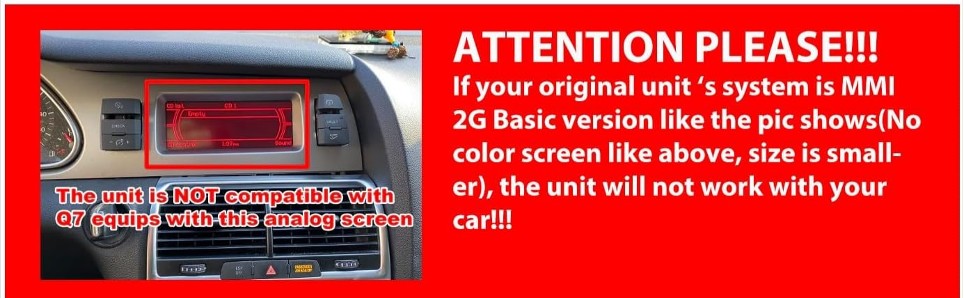
Image 2.1: Visual guide for distinguishing between Audi Q7 MMI 2G (2005-2009) and MMI 3G (2010-2015) systems. The MMI 3G system typically features a larger, color display, while MMI 2G Basic versions may have a smaller, monochrome screen. This unit is compatible only with MMI 3G.

Important: This unit is NOT compatible with Audi Q7 models equipped with MMI 2G Basic version (small, analog screen). Installation in an incompatible vehicle may result in malfunction or damage.