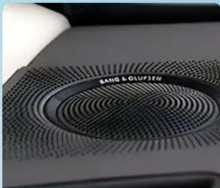
Maintain The Original System