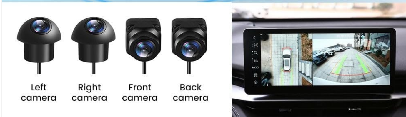
Image 5.5: Illustration of an optional 360-degree rear view camera system, showing front, back, left, and right camera views integrated with the KUNFINE head unit display. This system provides a comprehensive view around the vehicle for enhanced parking and maneuvering.