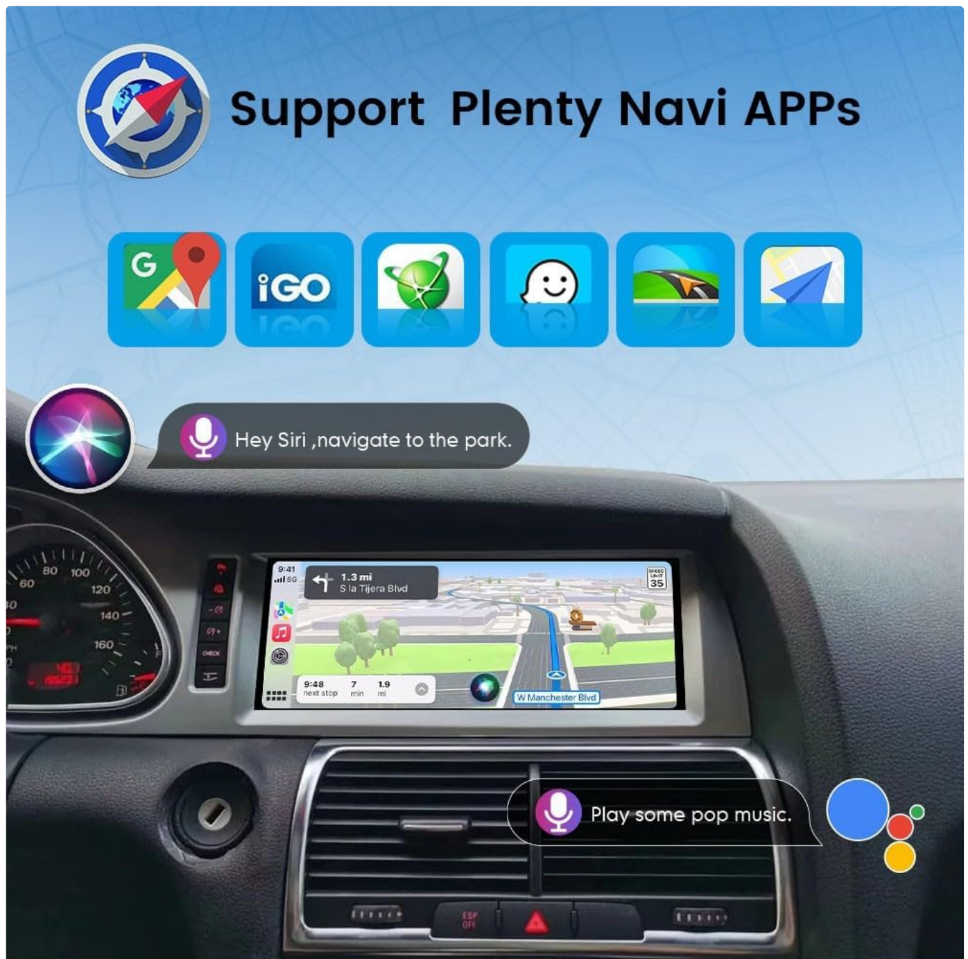
Image 5.3: The KUNFINE head unit displaying a navigation application with voice command prompts. The image highlights the ability to use various navigation apps and interact with them using voice commands like "Hey Siri, navigate to the park" or "Play some pop music."

The unit supports various navigation applications. You can download and use your preferred GPS apps from the Android Play Store.