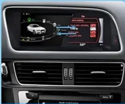
Steering Wheel Control