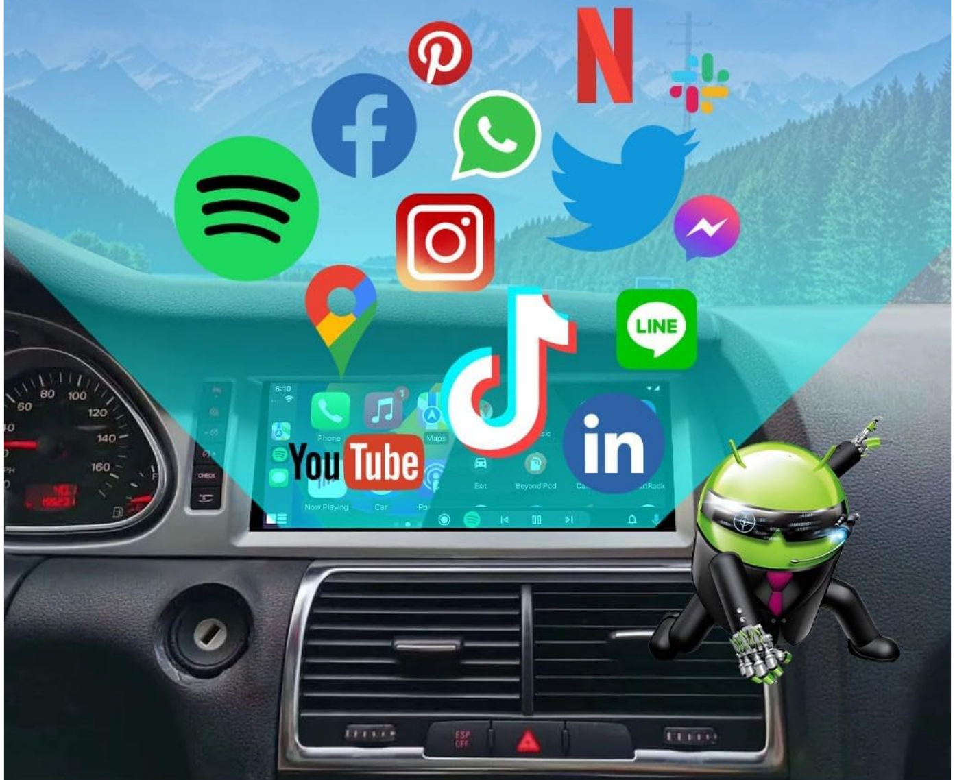
Image 5.1: The Android system interface displayed on the KUNFINE head unit, illustrating access to various applications such as Spotify, Netflix, YouTube, and navigation apps. This demonstrates the unit's capability to run a wide range of Android applications.