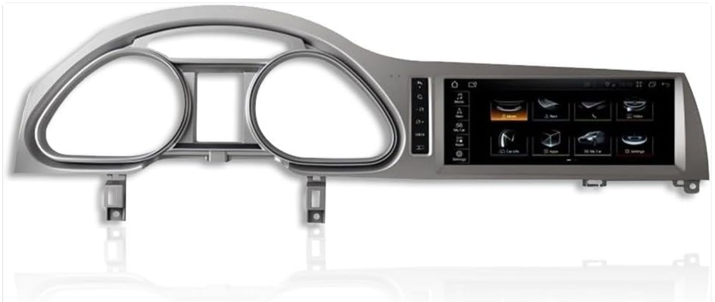
Image 1.1: KUNFINE 10.25-inch Android Head Unit, showcasing its integration into an Audi Q7 dashboard. The unit replaces the original display, offering a larger screen and modern interface.

Please read this manual thoroughly before installation and use to ensure proper function and to maximize your experience with the product.