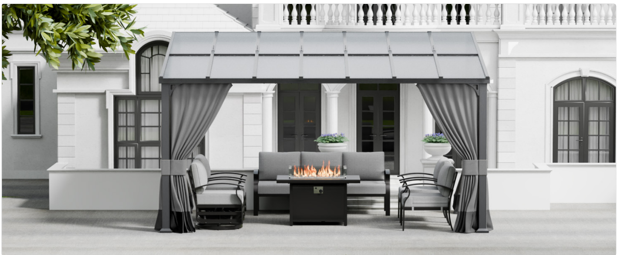
Image: Removable curtain and netting system for flexible use.