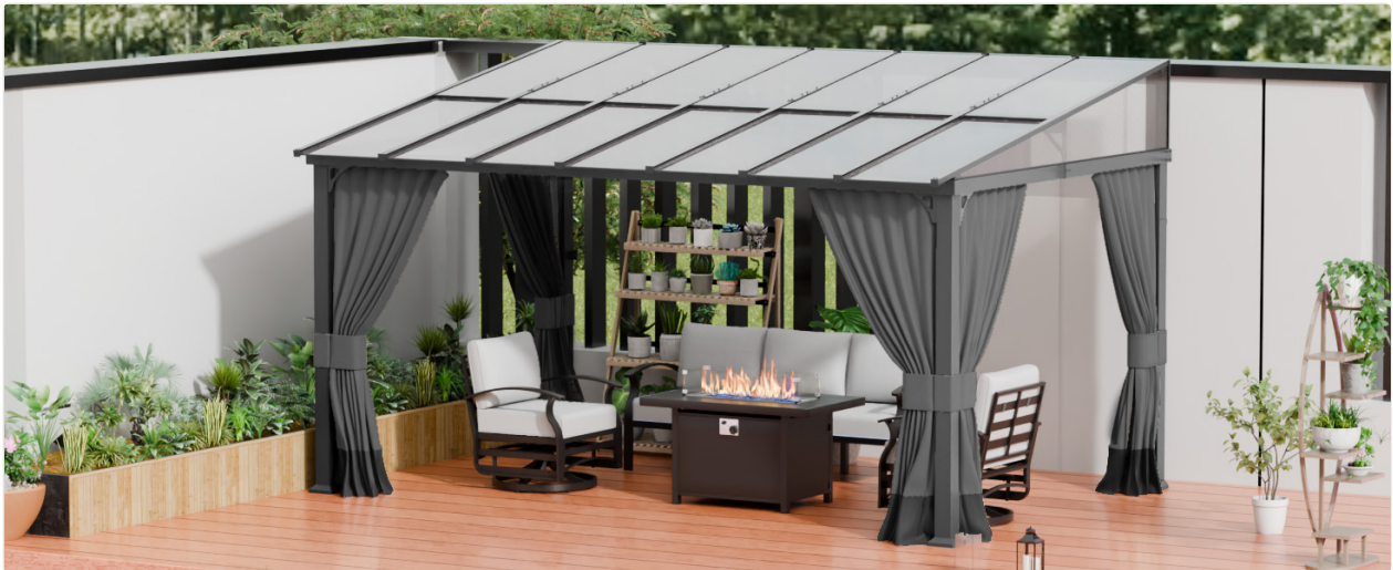
Image: Polycarbonate roof panels providing UV protection and water resistance.

Install the light green translucent polycarbonate sheets onto the roof frame. These panels are designed to filter harsh sunlight, diffuse soft light, and facilitate rapid drainage.