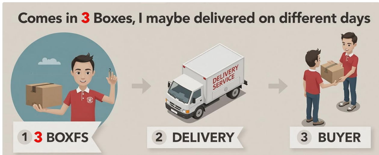
Image: The pergola components are delivered in three separate boxes.

Upon receipt, carefully unpack all components and compare them against the parts list provided in your detailed assembly guide. If any parts are missing or damaged, please contact customer service immediately.