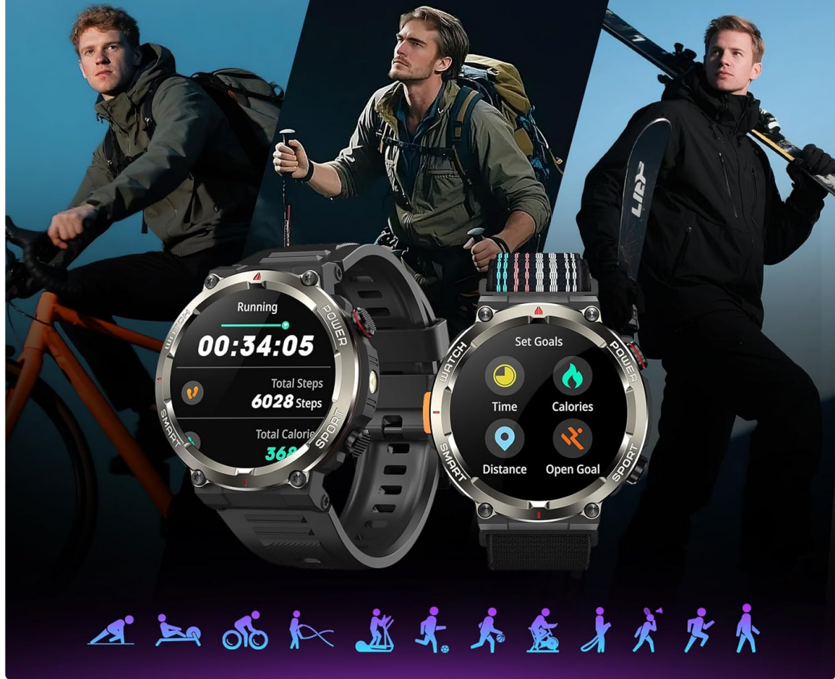
Image: The Blackview W50Pro Smart Watch showcasing its 100+ sports modes, with examples of activity tracking for running and goal setting.

2 Straps, Silicone strap + Braided strap