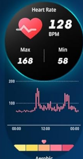
Heart Rate Monitor