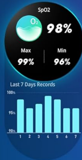
Blood Oxygen Monitor