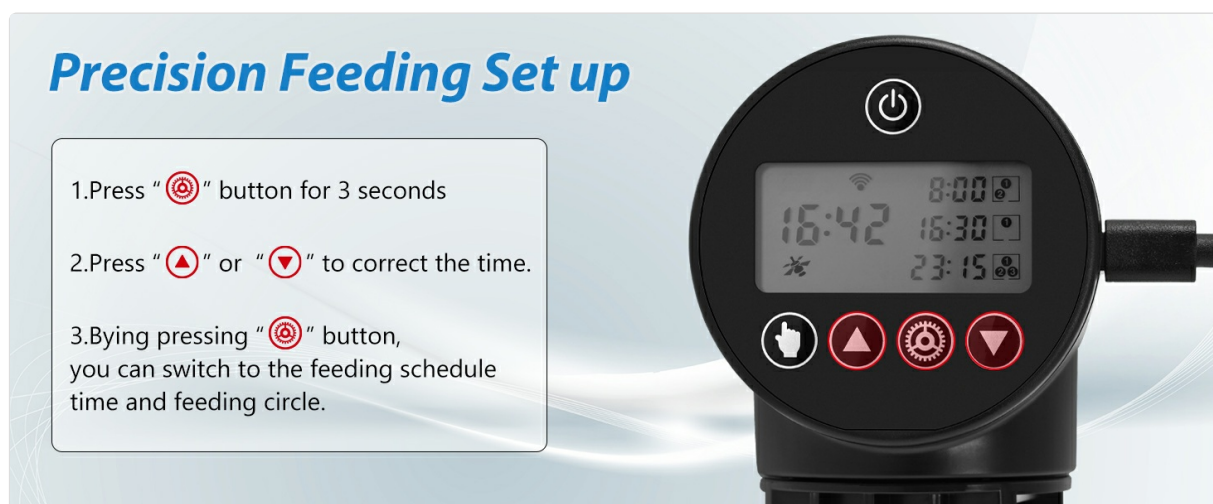
Figure 6: Precision Feeding Setup. Instructions detail pressing the settings button for 3 seconds, using arrow keys to correct time, and pressing settings again to switch to feeding schedule and cycle.