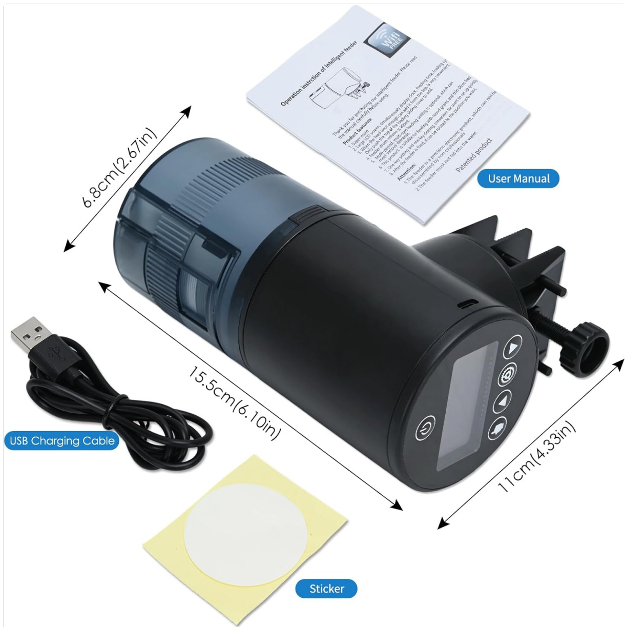
Figure 1: Product Components and Dimensions. The image shows the main feeder unit, a USB charging cable, an adhesive sticker for mounting, and a small user manual. Key dimensions are indicated: 6.8cm (2.67in) height, 15.5cm (6.10in) length, and 11cm (4.33in) width.