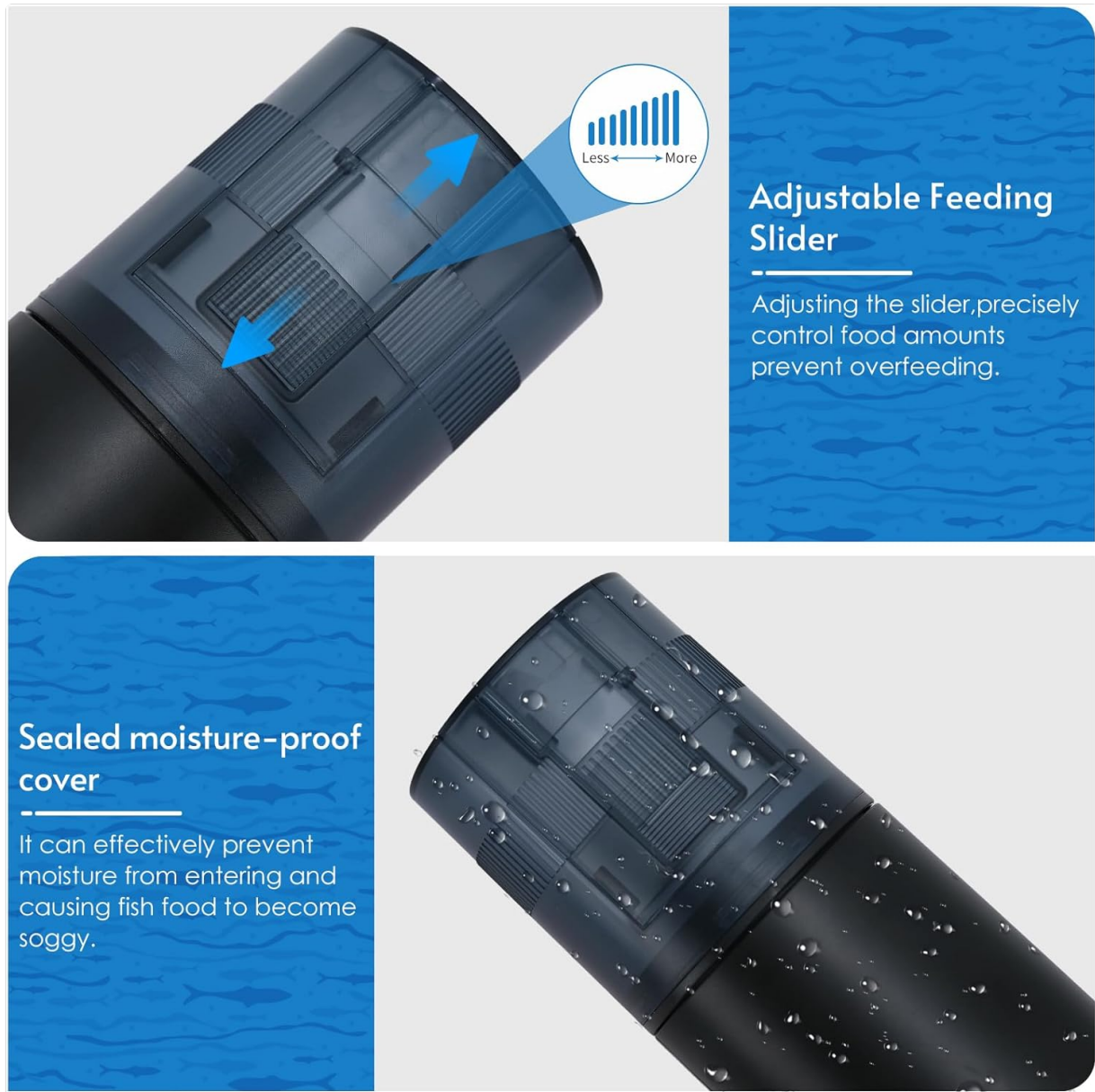
Figure 8: Adjustable Feeding Slider. The top part of the image shows the slider mechanism for adjusting food output, with arrows indicating "Less" and "More". The bottom part shows the sealed moisture-proof cover, designed to prevent food from becoming soggy.

The feeder features an adjustable slider to control the amount of food dispensed per serving. Slide the adjustment cap to increase or decrease the opening size, allowing for precise portion control to prevent overfeeding.