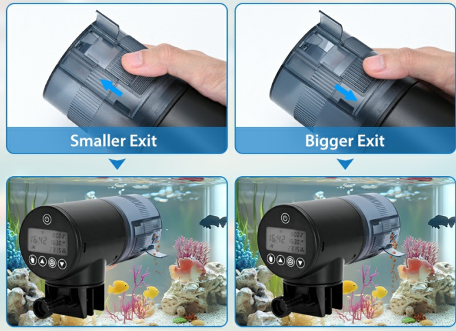
Figure 9: Feeding Control Slider. This image visually explains how to adjust the slider for a smaller or bigger food exit, allowing control over the amount of feed dispensed.

You can control the amount of feed by adjusting the slider.