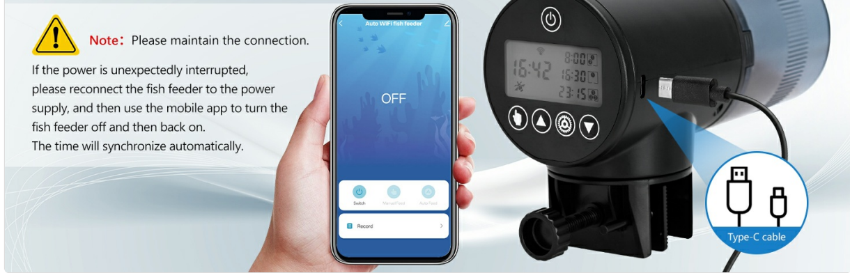
Figure 2: Type-C Charging and Power Connection. The feeder connects via a USB-C cable. If power is interrupted, reconnect the feeder to power and use the mobile app to cycle the feeder off and then on; the time will synchronize automatically.

If the power is unexpectedly interrupted, please reconnect the fish feeder to the power supply, and then use the mobile app to turn the fish feeder off and then back on. The time will synchronize automatically.