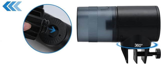
Figure 3: Two Mounting Options. The top section shows the feeder attached to a tank lid using an adhesive sticker. The bottom section shows the feeder clamped to the edge of a tank, demonstrating 360-degree rotation capability.

When fitted with the base, it can be fixed to <24mm glass.