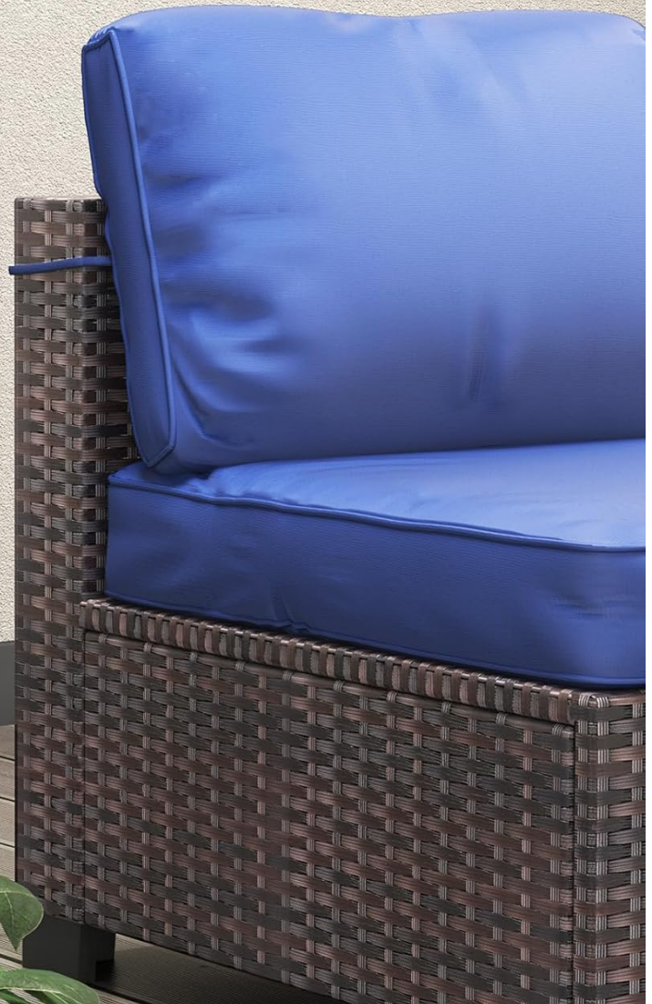
Image: Detail of the cushion material, highlighting its softness and splash-proof properties.

THICKENED CUSHION AND BACKREST provides better support and enhances comfort.