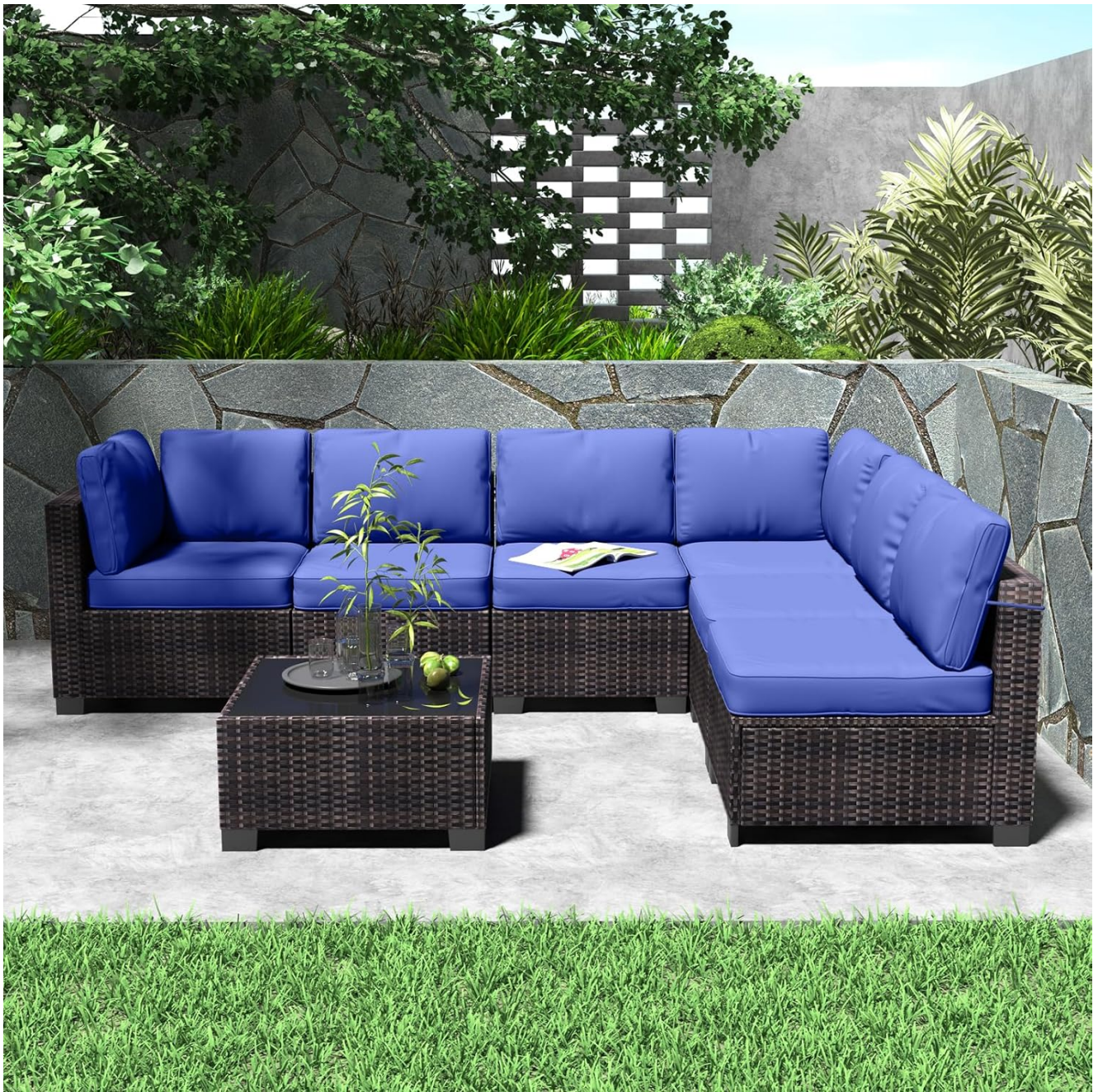
Image: The complete 7-piece patio furniture set, showcasing its modular design and included coffee table.