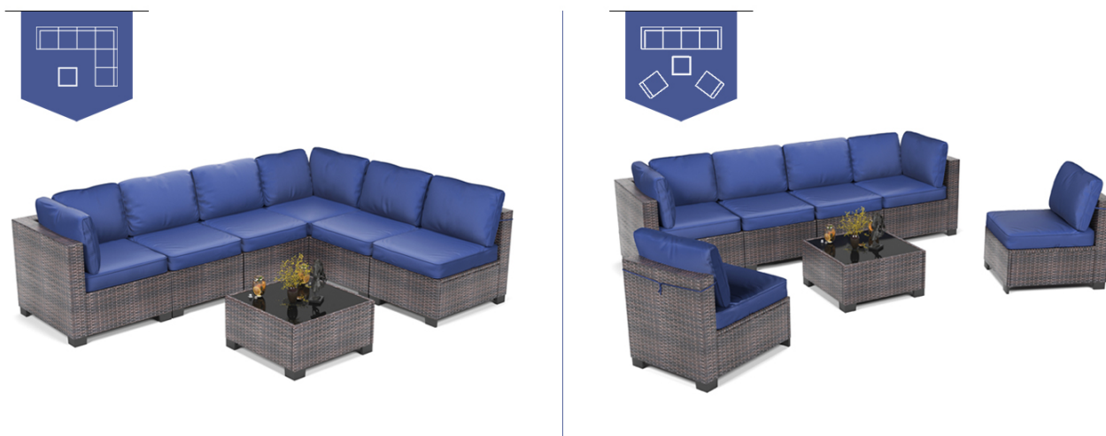
Image: Visual examples of how the modular patio set can be configured in different layouts.

The modular design of this patio set allows for flexible arrangement to suit various outdoor spaces and occasions. You can create a cozy corner, an extended sofa, or separate seating areas.