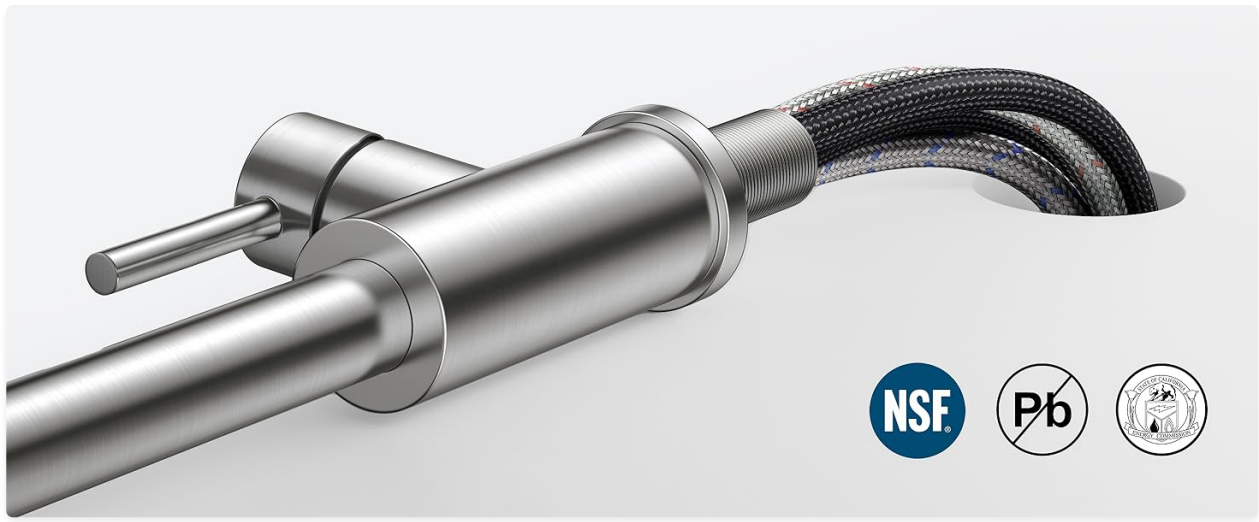
Image 2.2: The pull-down sprayer provides extended reach for comprehensive cleaning.