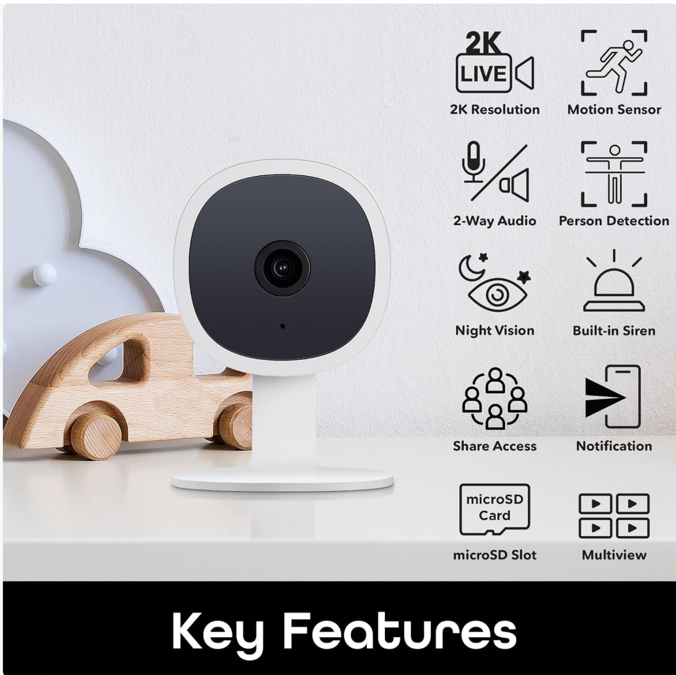
Image: Overview of the Geeni Vision 2K Camera's key features, including 2K resolution, motion sensor, 2-way audio, person detection, night vision, built-in siren, share access, notification, microSD slot, and multiview.