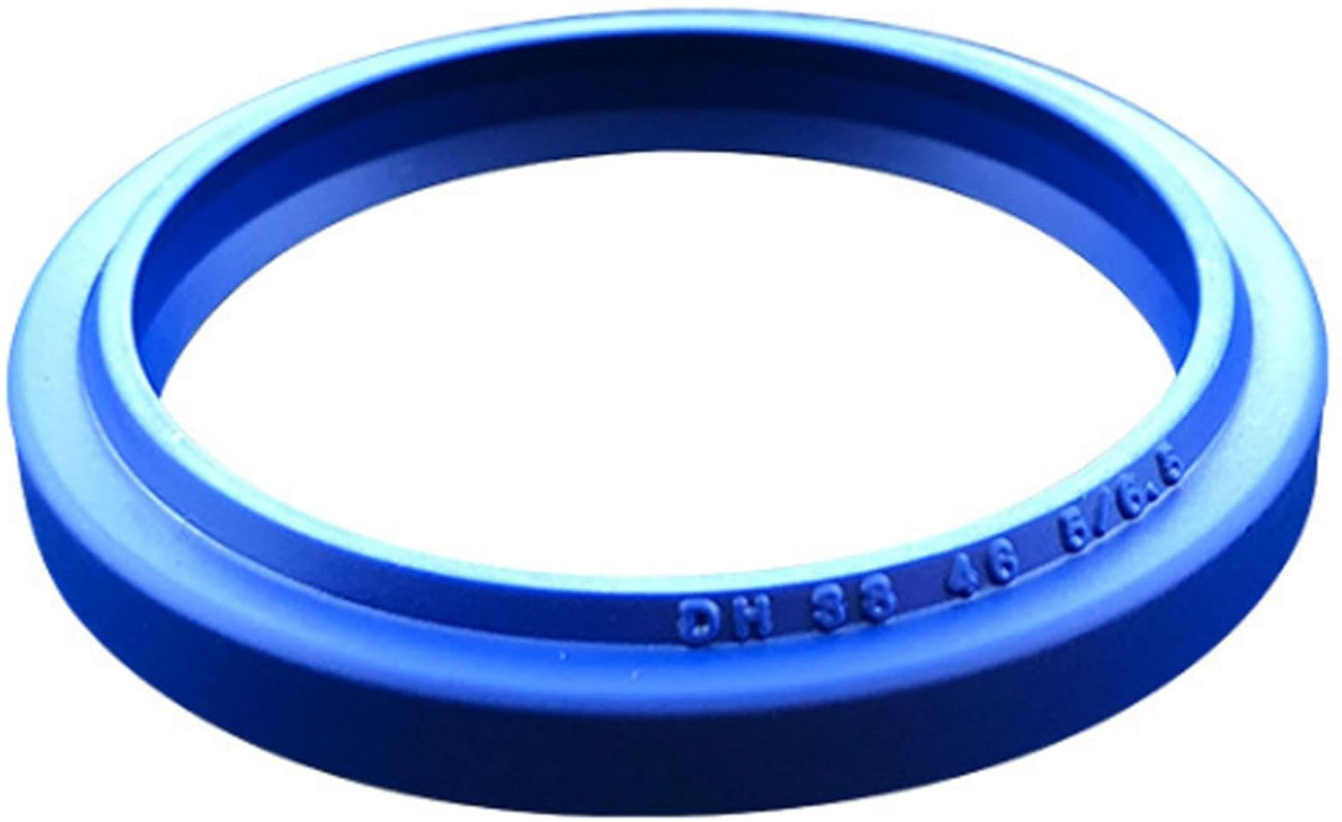
This image displays a single blue polyurethane dust seal, designed to prevent contaminants from entering hydraulic cylinders.