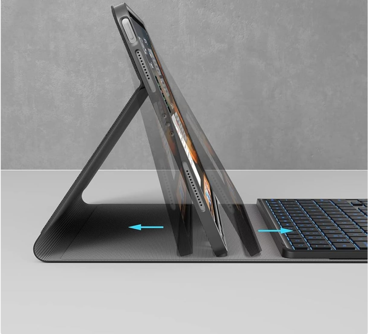
Image: Overview of the Magnetic Detachable Keyboard and Mouse Combo Case, showing the tablet in the case, the detachable keyboard, and the mouse.