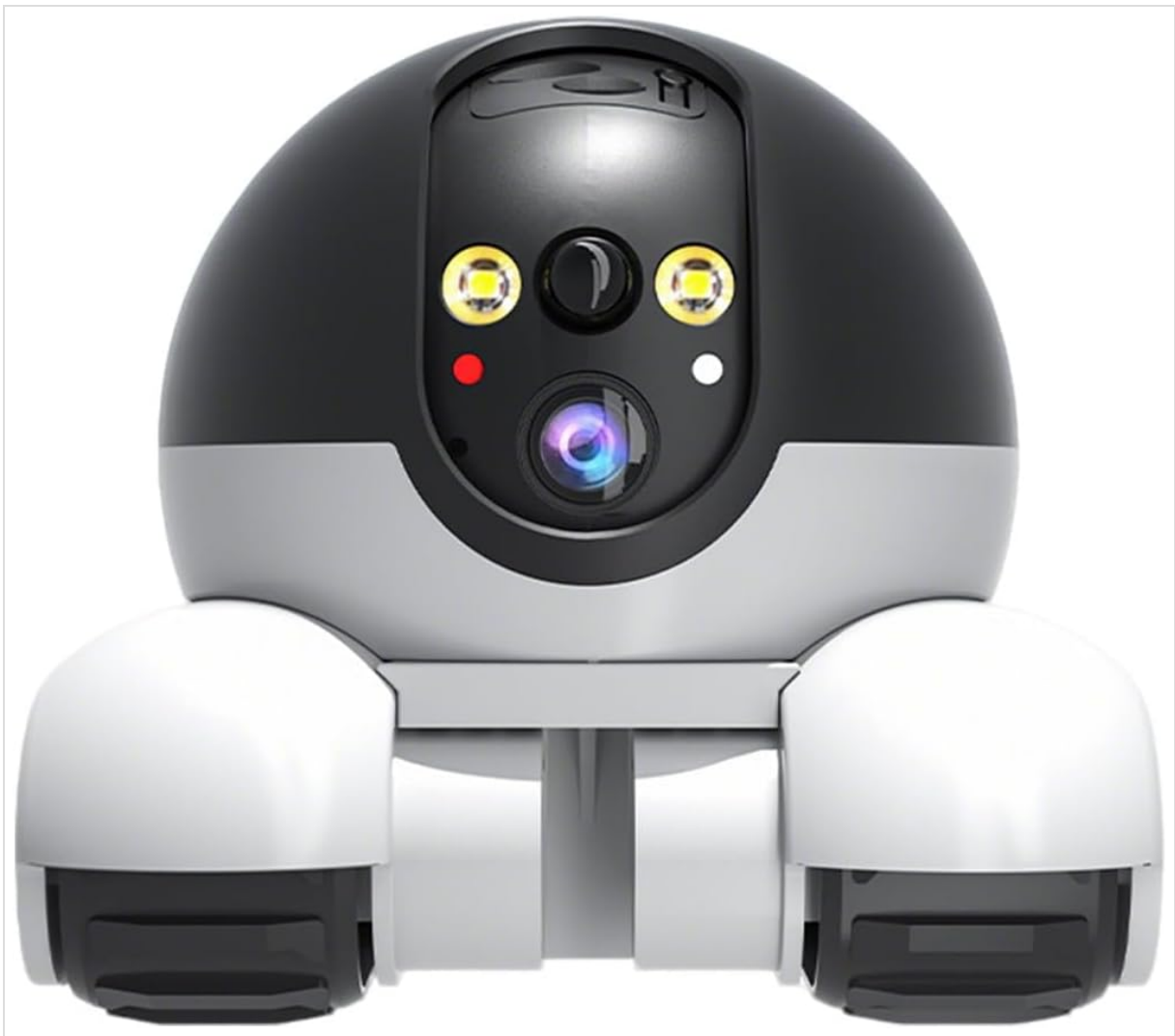
Front view of the Generic Robot Pet Camera, showcasing its dual lenses and compact design.