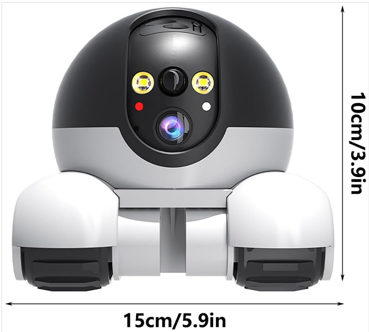
Dimensions of the Generic Robot Pet Camera.