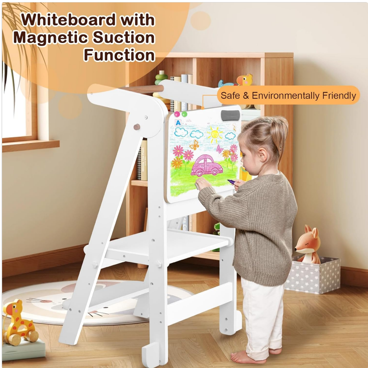
Image 5: A child engaging in creative drawing on the magnetic whiteboard feature of the tower.