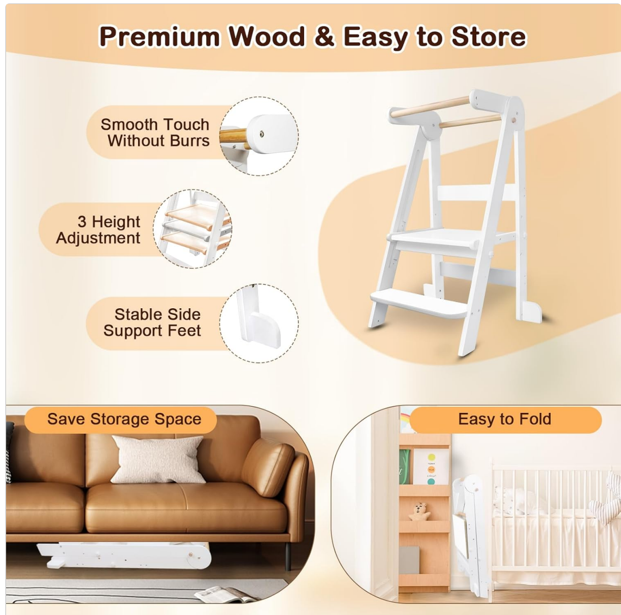
Image 2: Key features of the kitchen tower, highlighting the smooth finish, three height adjustment levels, stable side supports, and the folding mechanism.