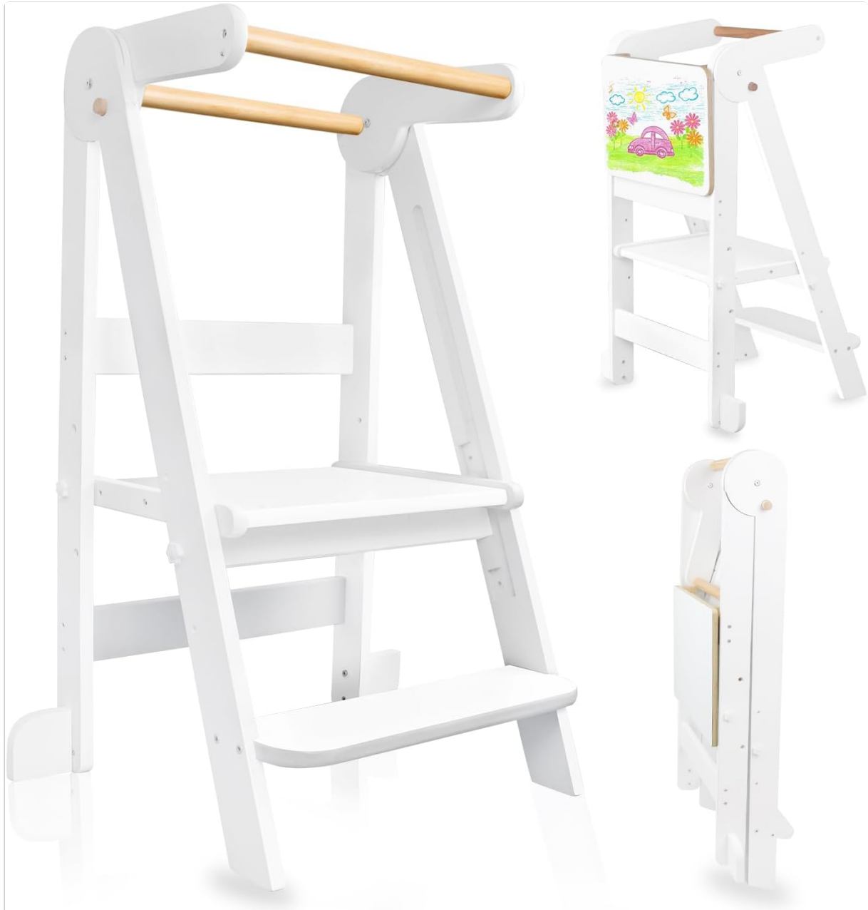
Image 1: Overview of the Uuoeebb Foldable Toddler Kitchen Tower, illustrating its assembled form, folded state, and the attached whiteboard.