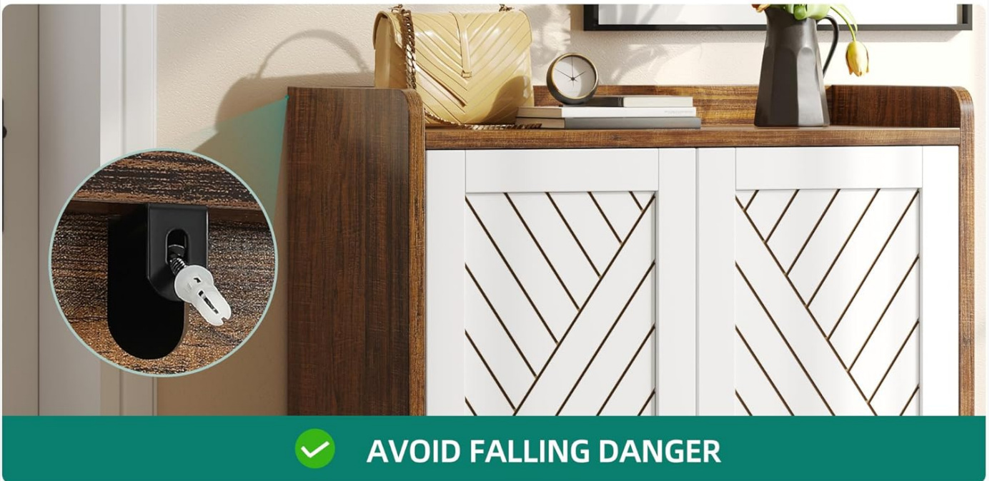
Figure 2.1: Anti-Tipping Precaution. This image illustrates the importance of securing the shoe cabinet to the wall to prevent potential tipping hazards, especially with children present. The top portion shows a child attempting to climb an unsecured cabinet, marked with "POTENTIAL INJURY". The bottom portion shows a close-up of the anti-tip hardware installed, marked with "AVOID FALLING DANGER".