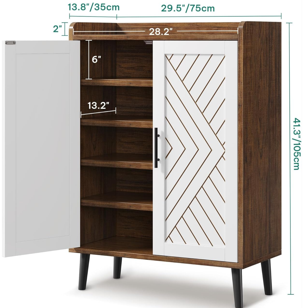
Figure 4.1: Product Dimensions. This diagram provides detailed measurements of the shoe cabinet, including its overall height, width, and depth, as well as internal shelf dimensions.