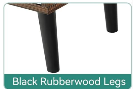
Black Rubberwood Legs