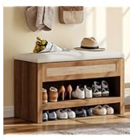
Figure 6.1: Spacious Countertop. This image demonstrates the utility of the cabinet's top surface, ideal for displaying decorative items or keeping small personal belongings organized and easily accessible.

The spacious countertop is suitable for displaying home decor items or storing small personal belongings such as keys, wallets, or small bags. Ensure items placed on top do not exceed the cabinet's stability limits.