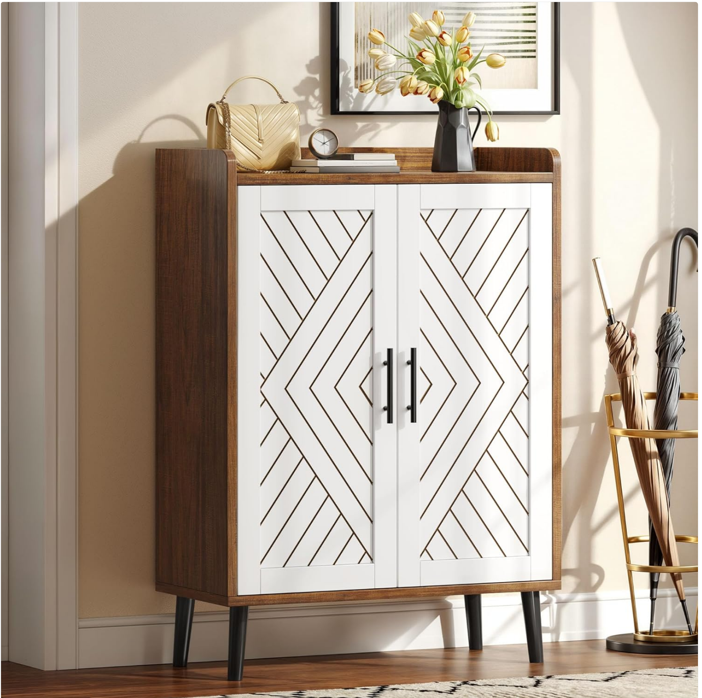
Figure 3.1: Elegant Design. This image showcases the YITAHOME shoe cabinet's compact and elegant design, featuring its brown and white finish, patterned doors, and black legs, positioned in an entryway setting.