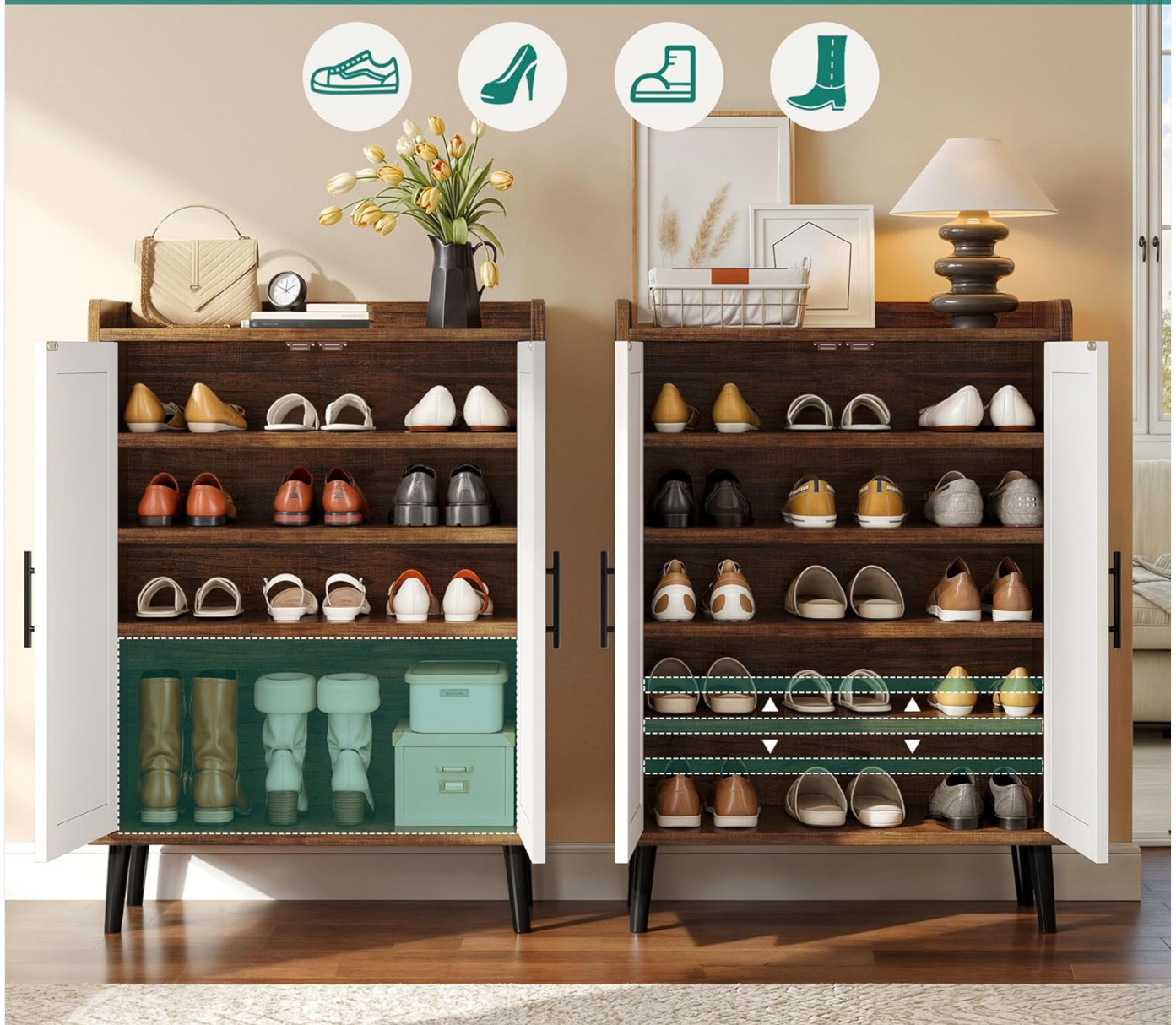
Figure 3.2: Customizable Storage. This image highlights the adjustable shelving feature of the shoe cabinet. It shows how the bottom shelf can be removed or adjusted to three different heights to accommodate various footwear, including tall boots.

The bottom shelf is removable and can be adjusted in three heights.