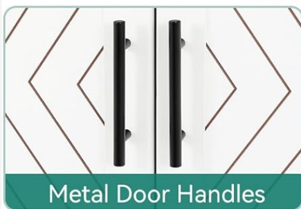
Metal Door Handles