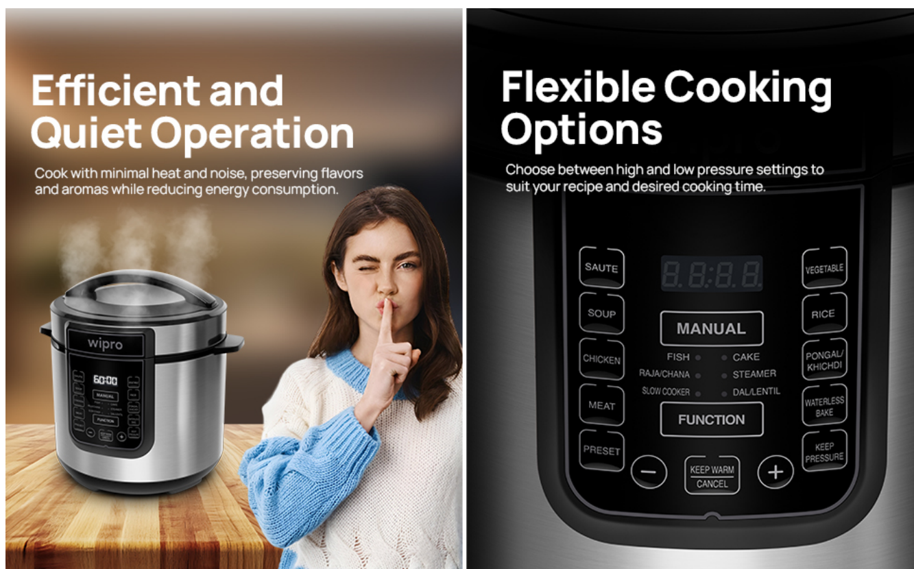
Image: Close-up of the control panel showing buttons for SAUTE, SOUP, CHICKEN, MEAT, PRESET, MANUAL, FISH, CAKE, STEAMER, DAL/LENTIL, SLOW COOKER, VEGETABLE, RICE, PONGAL/KHICHDI, WATERLESS BAKE, KEEP PRESSURE, FUNCTION, KEEP WARM/CANCEL, and +/- buttons.

The digital control panel provides access to various cooking functions and settings.