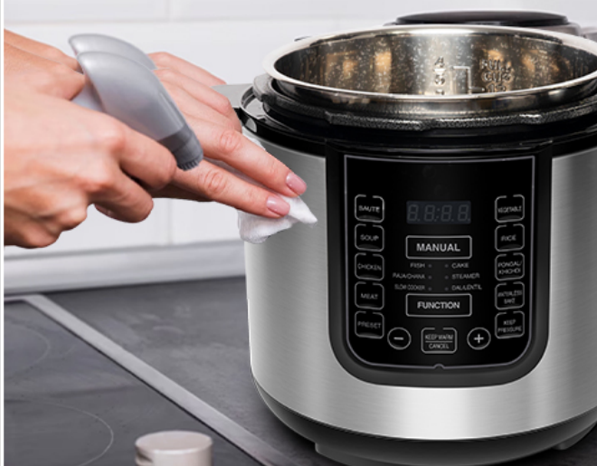
Image: A person cleaning the stainless steel inner pot of the Wipro Elato CPC201 Digital Electric Pressure Cooker, highlighting its easy maintenance and dishwasher-safe components.

The dishwasher-safe stainless steel inner pot and lid make cleanup a breeze.