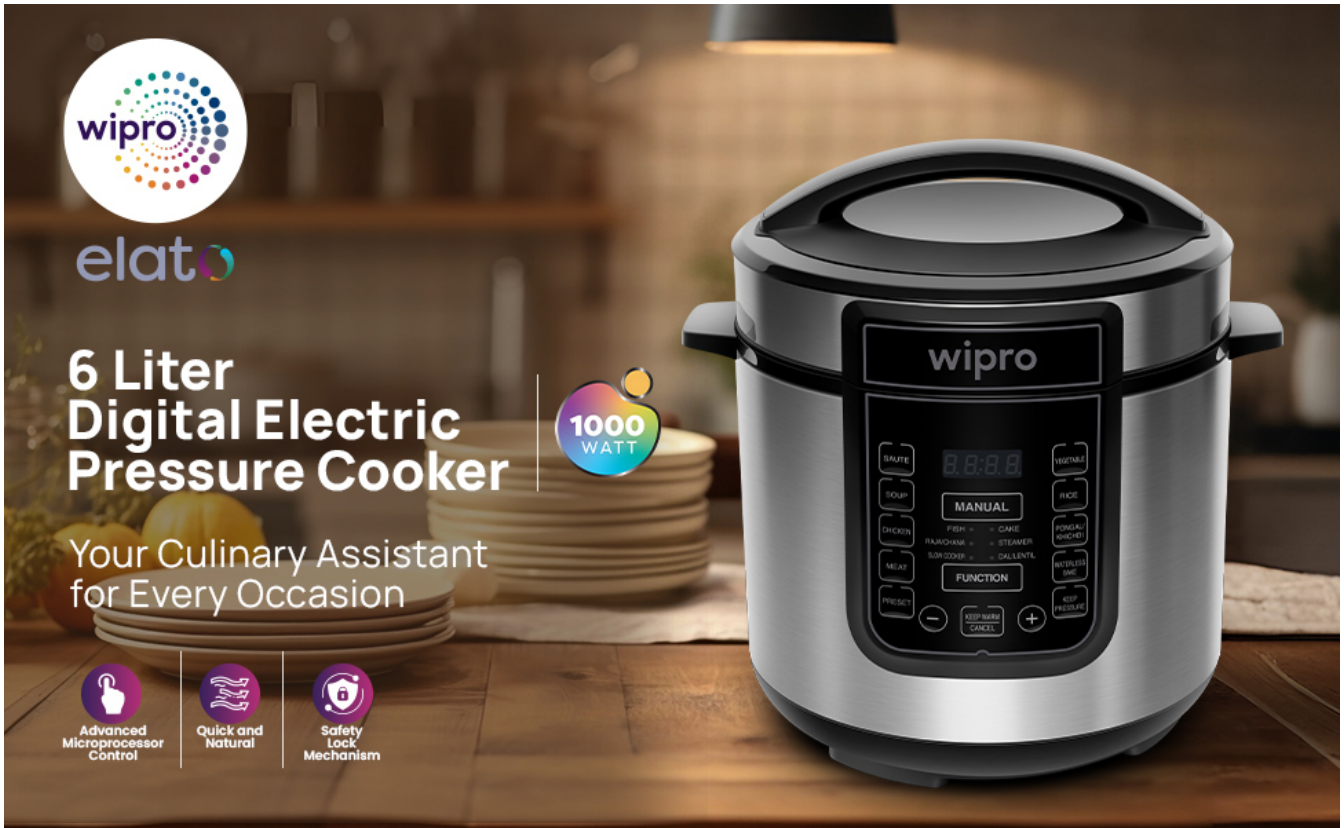
Image: The Wipro Elato CPC201 Digital Electric Pressure Cooker on a kitchen counter with a bowl of rice, highlighting its advanced cooking programs.