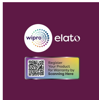
Image: QR code for Wipro product warranty registration. Scan this code to register your product.

For technical support, service, or any inquiries, please contact Wipro customer service through their official channels.