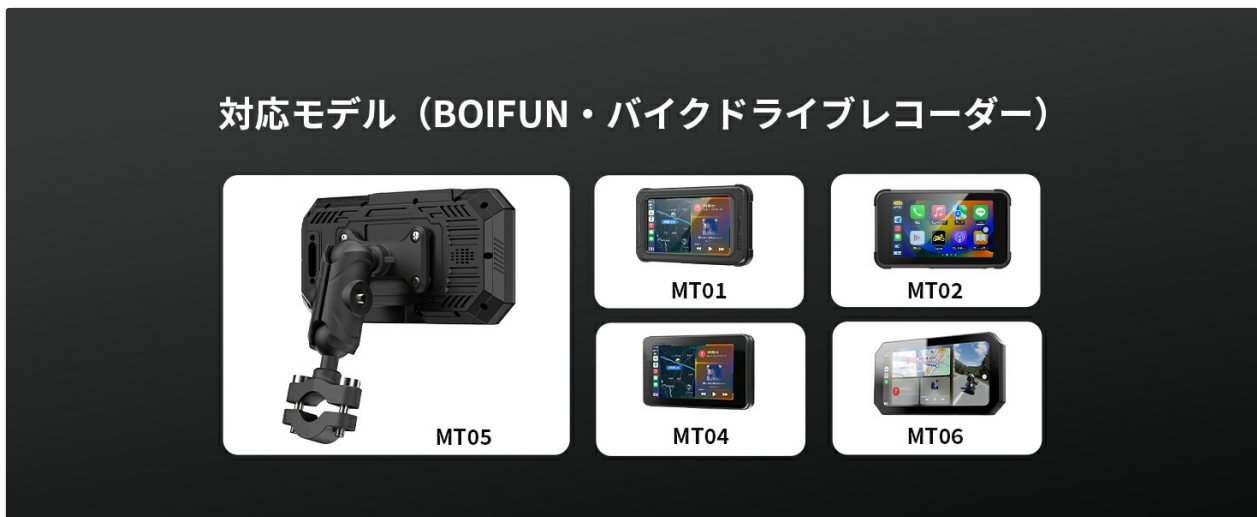
Image: Compatible BOIFUN drive recorder models.