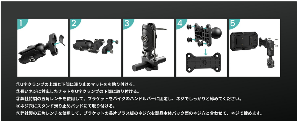
Image: Diagram illustrating the steps for handlebar mounting.