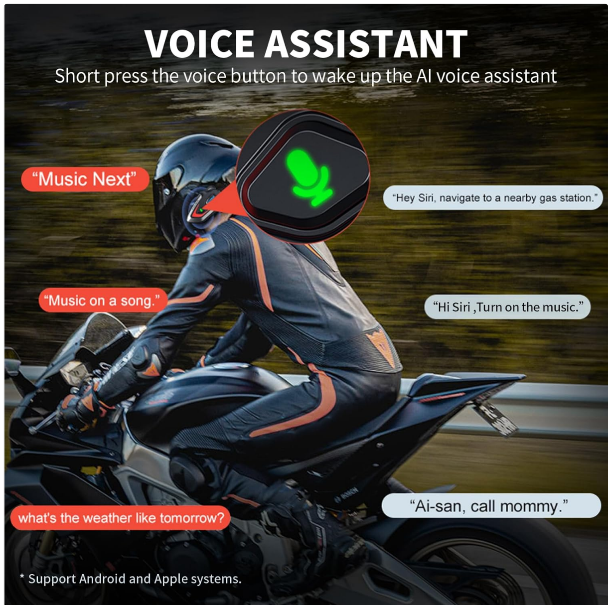
Figure 5.1: AI Voice Assistant Functionality.