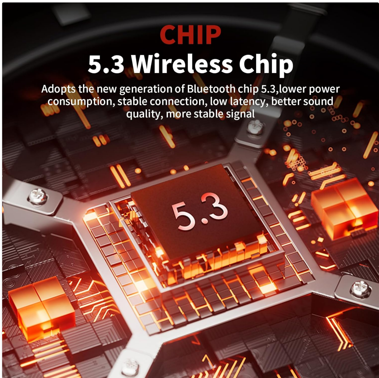
Figure 3.4: Bluetooth 5.3 Wireless Chip.