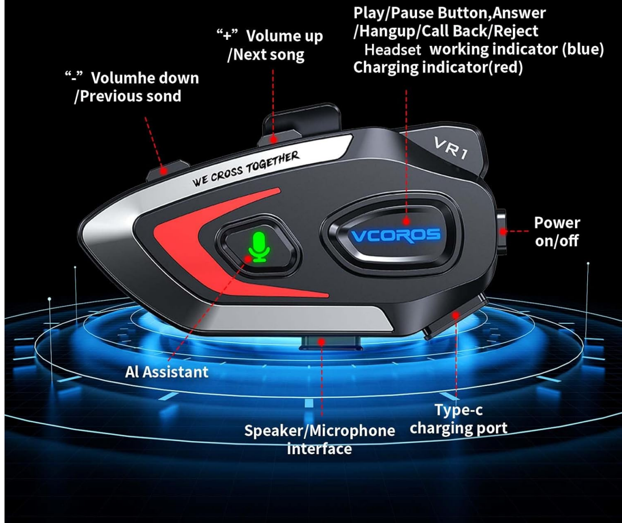
Figure 3.1: VCOROS VR1 Headset Controls and Ports.