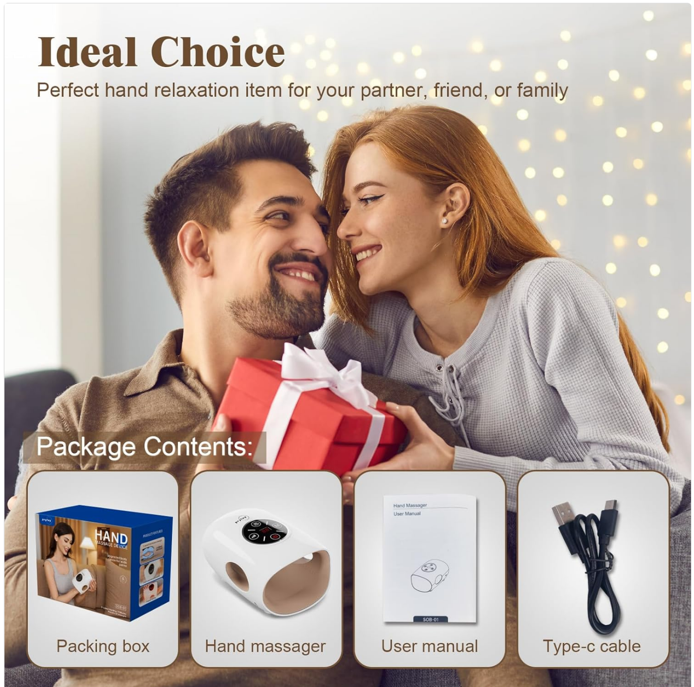
Image 3.1: Visual representation of all items included in the product package.

Verify that all items are present in the package upon unboxing: