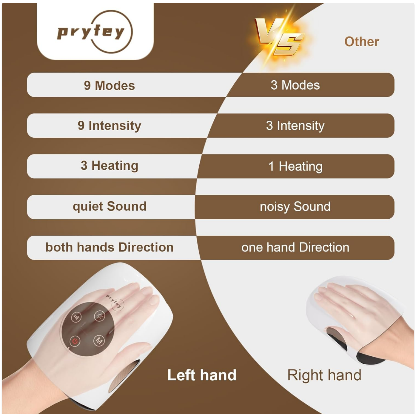
Image 4.4: Feature comparison demonstrating the advantages of the pryfey Hand Massager over typical alternatives.