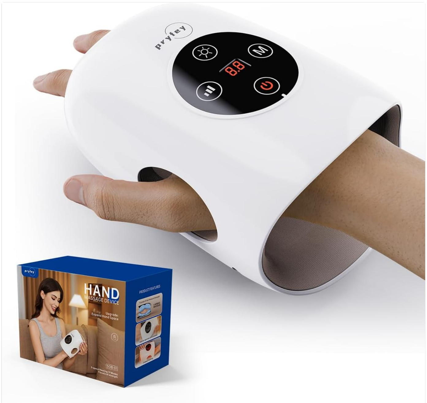
Image 1.1: The pryfey Hand Massager device shown alongside its product packaging, illustrating its compact design and branding.