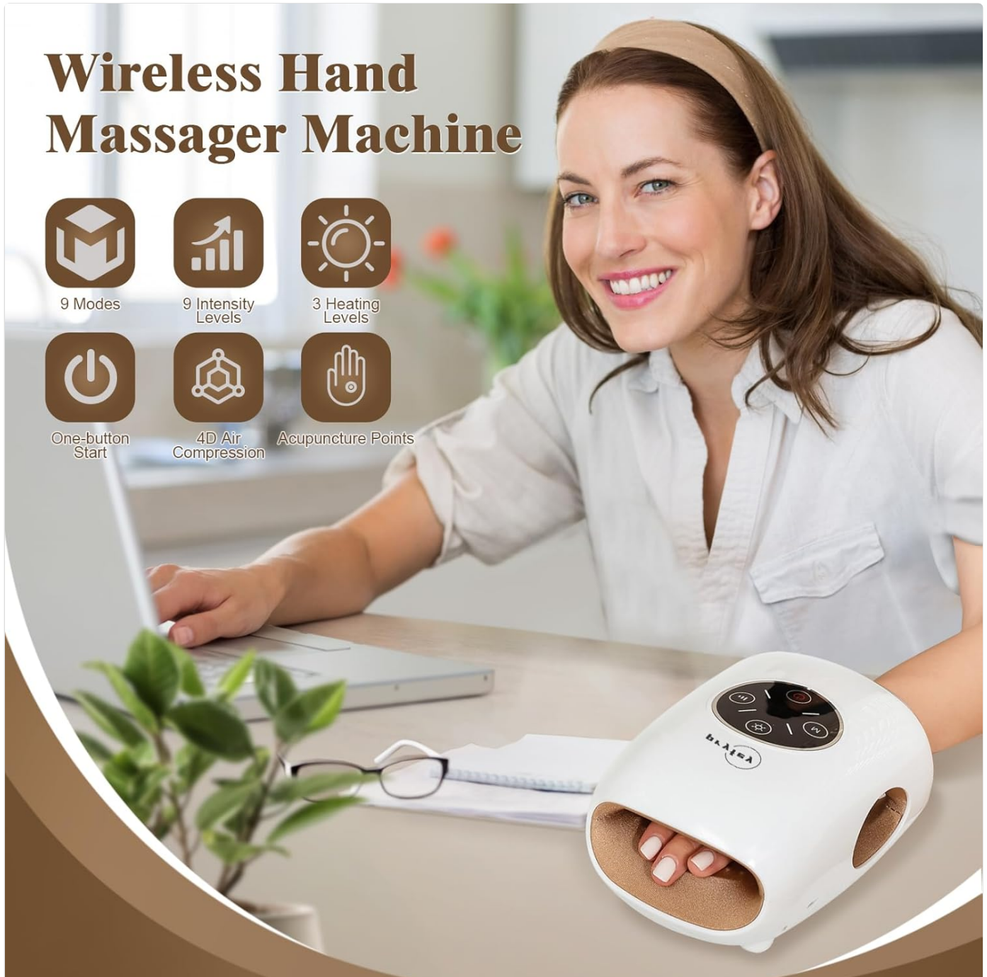
Image 4.1: Overview of key features including massage modes, intensity levels, heat settings, and ease of use.