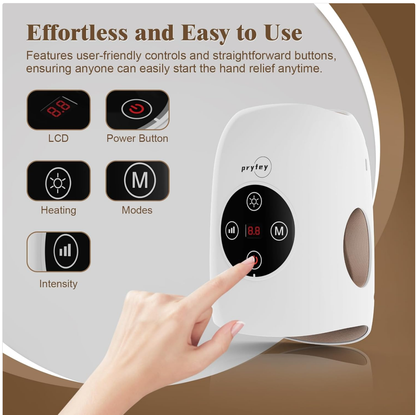
Image 6.1: Detailed view of the control panel with labels for each button and the LCD display.

Familiarize yourself with the control panel for optimal use.