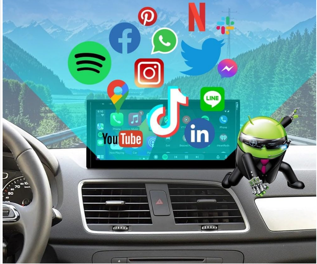
Figure 3.1: The Android system interface displaying various applications, highlighting the multimedia capabilities.