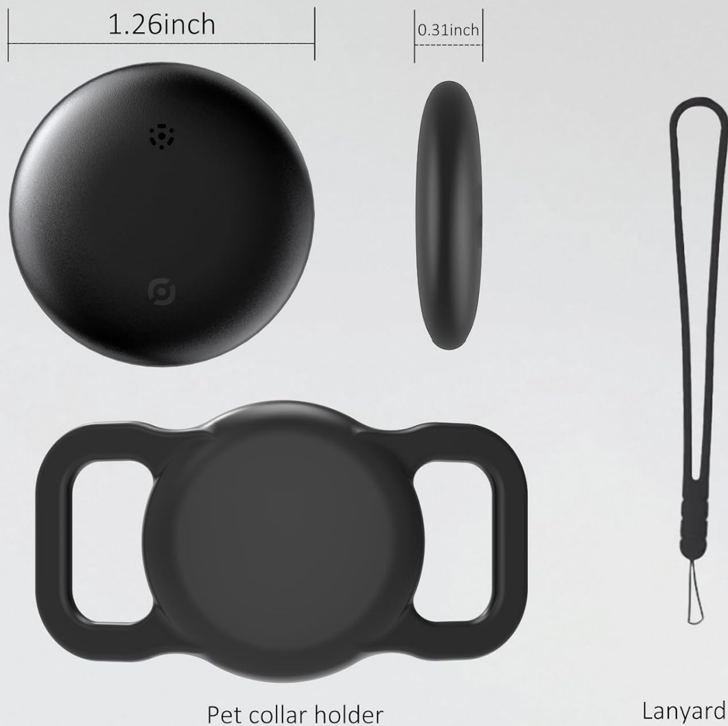
Figure 8: Lightweight and compact design with dimensions. This diagram provides a visual representation of the tracker's size and included accessories.