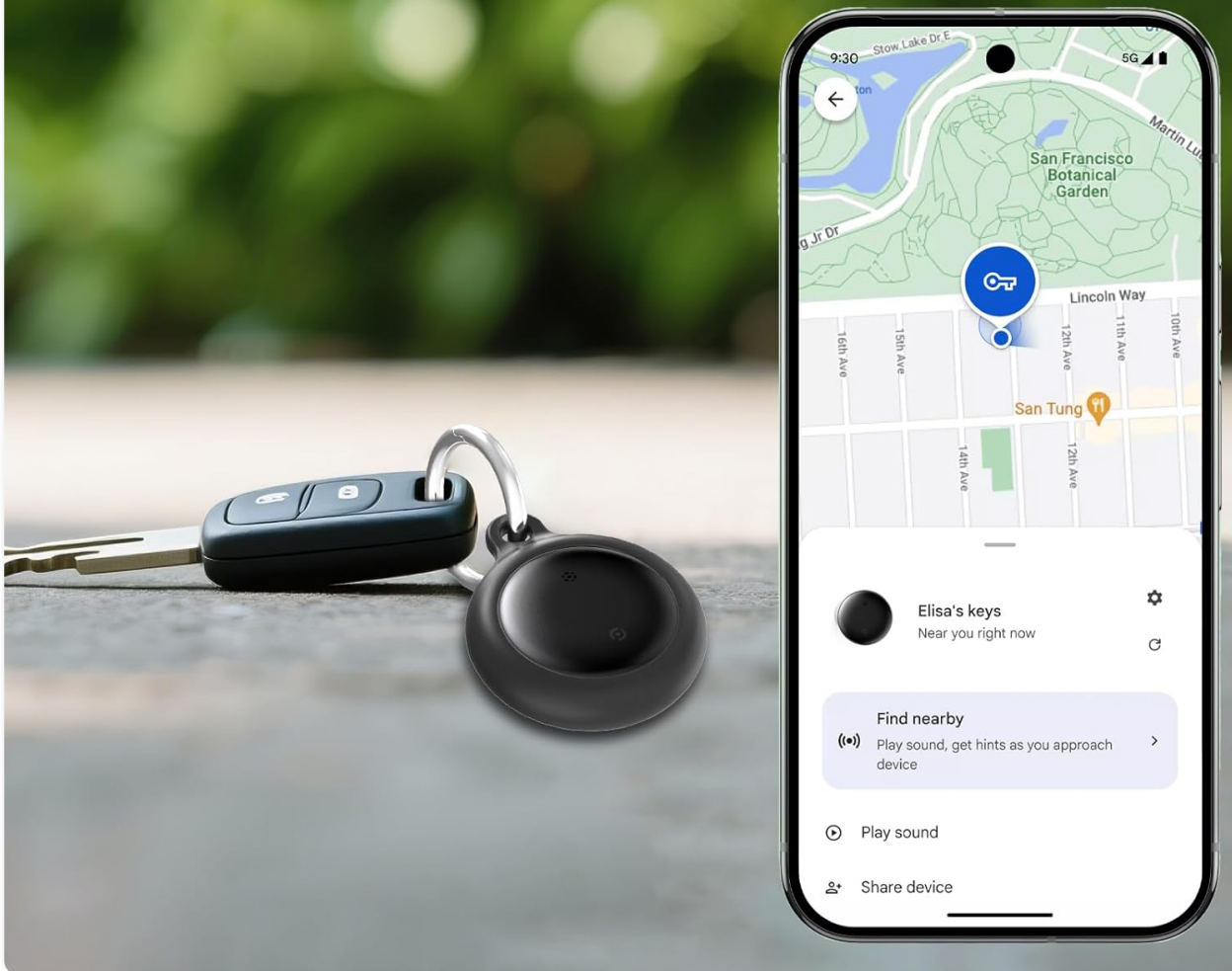
Figure 3: Global precise location tracking. This image shows the tracker attached to keys, with its location displayed on the Google Find My Device app map.

Locate your device at any time through the Google Find My Device app