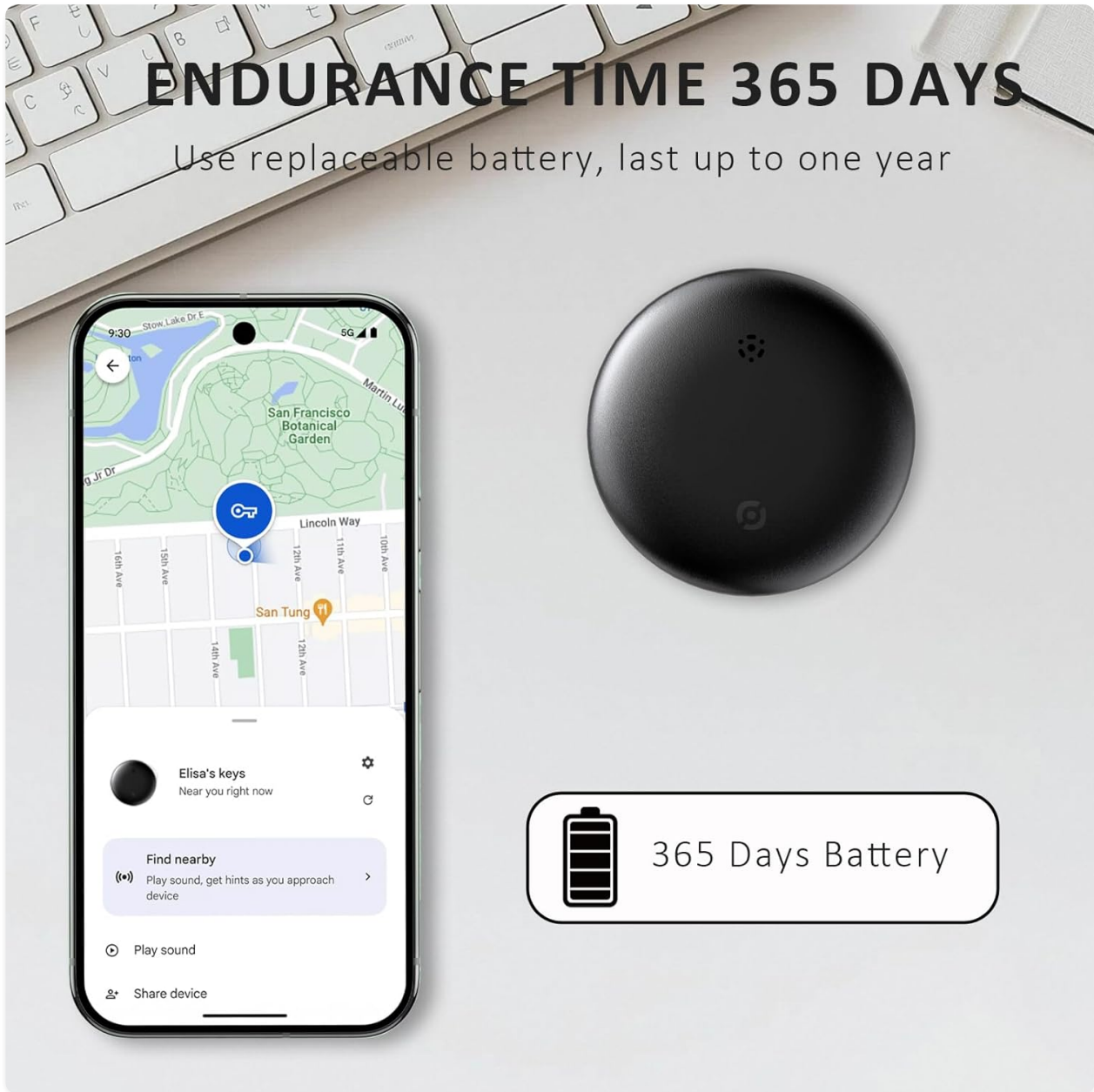
Figure 7: 365-day battery life and CR2032 battery. This image illustrates the long-lasting, replaceable battery feature of the tracker.