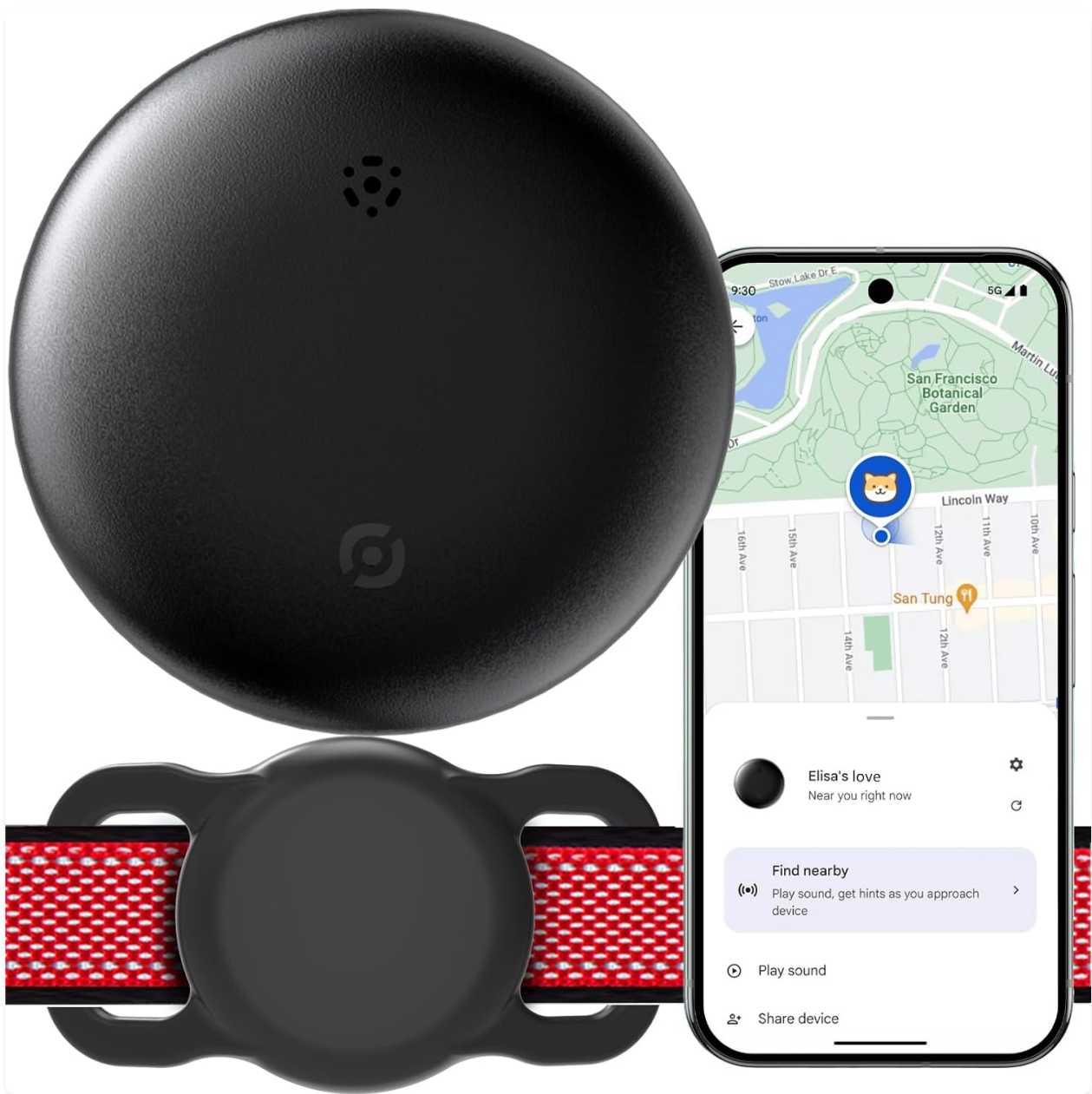
Figure 1: PerfiPro Bluetooth Tracker with pet collar holder and Google Find My Device app interface. This image illustrates the tracker's design and its primary function of locating items via the app.