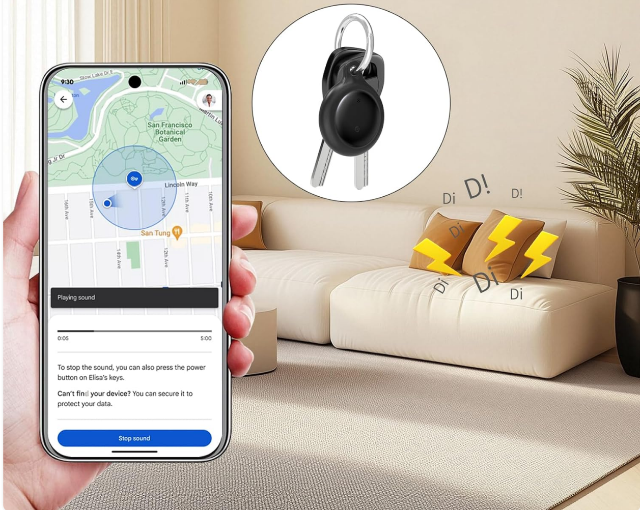
Figure 4: Ring function in action. This image demonstrates how the app can trigger a sound from the tracker to help locate nearby items.

Supports ring function to make it easier for you to find your stuff