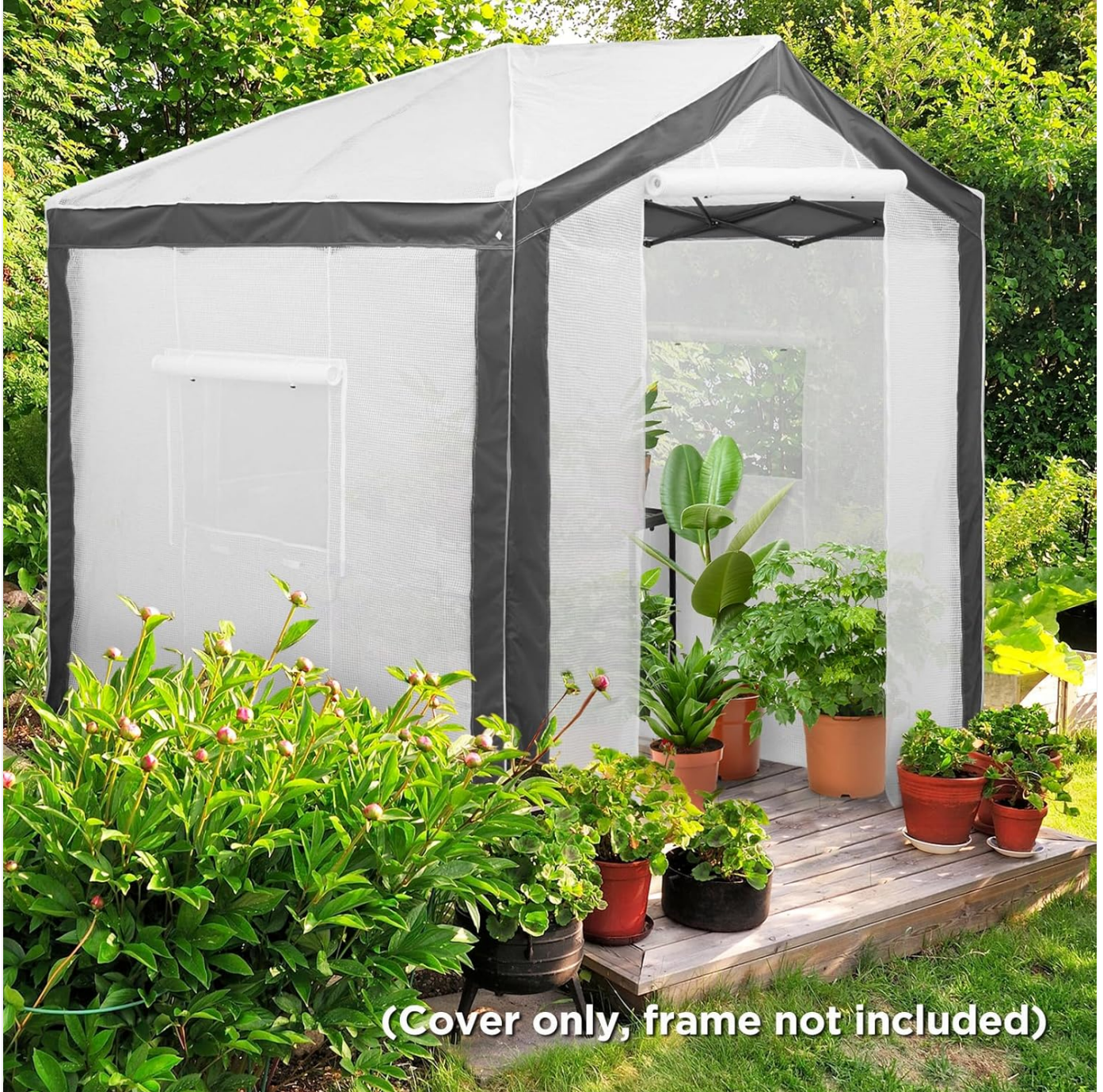
Figure 2.1: The replacement cover installed on a greenhouse frame, providing shelter for plants.