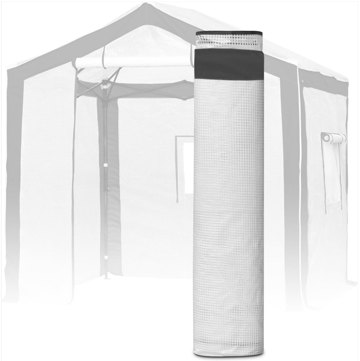
Figure 1.1: Rolled-up EAGLE PEAK Replacement Greenhouse Cover, ready for installation.