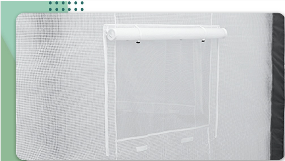
Figure 3.2: Illustration of the roll-up zippered door and large roll-up mesh windows for optimal ventilation.