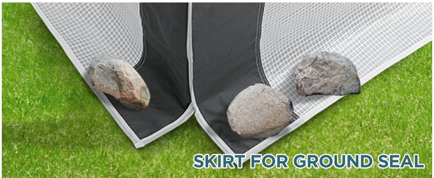
Figure 2.2: Detail of the extended wall (skirt) designed for ground sealing or weighting.