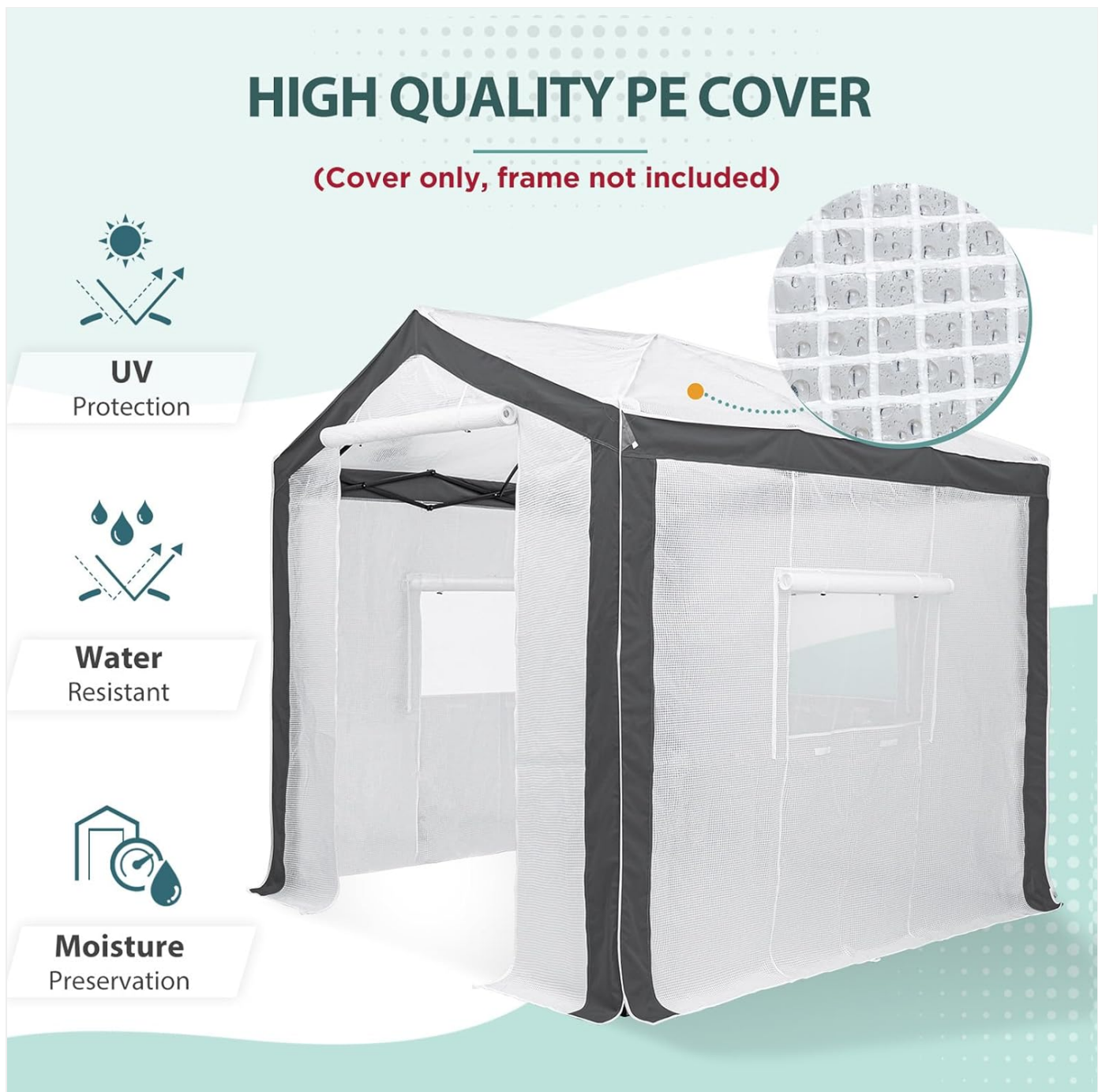
Figure 4.1: The PE cover material is designed for UV protection, water resistance, and moisture preservation, requiring minimal but consistent care.