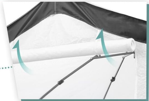
Roll-up Zippered Door for Easy Access