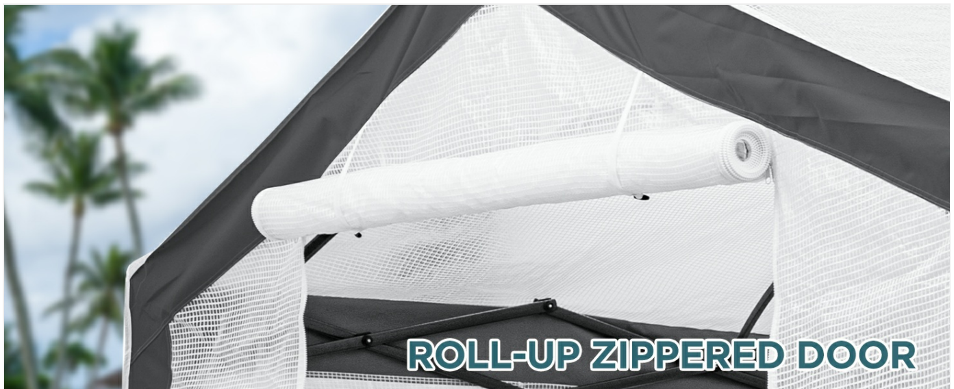
Figure 3.1: The roll-up zippered door provides convenient access to the greenhouse interior.