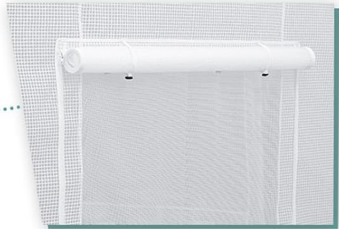
Large Roll-up Zippered Screen Window