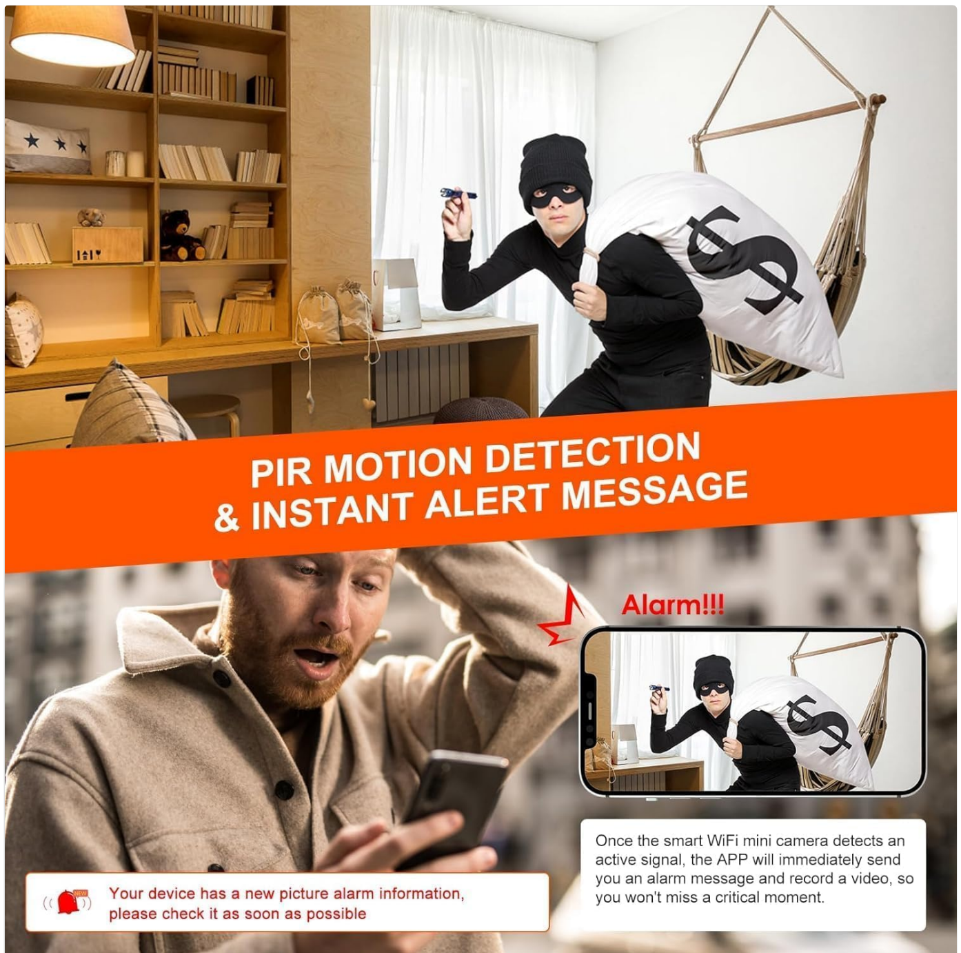
Image: This graphic illustrates the camera's PIR motion detection and instant alert message feature. It shows a scenario where an intruder is detected, triggering an alarm message and video recording sent to the user's phone, ensuring critical moments are not missed.