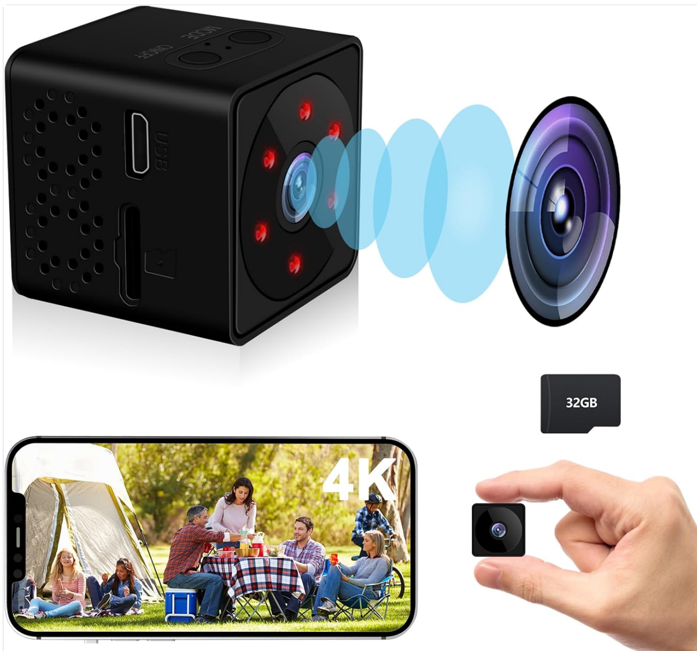
Image: A visual representation of the mini security camera highlighting its 4K resolution, 160-degree wide-angle capability, and the inclusion of a 32GB memory card. It also shows the camera's compact size and its remote viewing feature via a smartphone app.