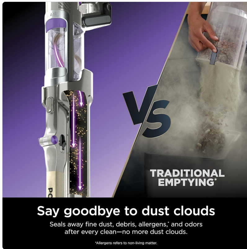
Image: A comparison showing the Shark PowerDetect's auto-empty system on the left, preventing dust clouds, versus traditional manual emptying on the right, which can create dust clouds.