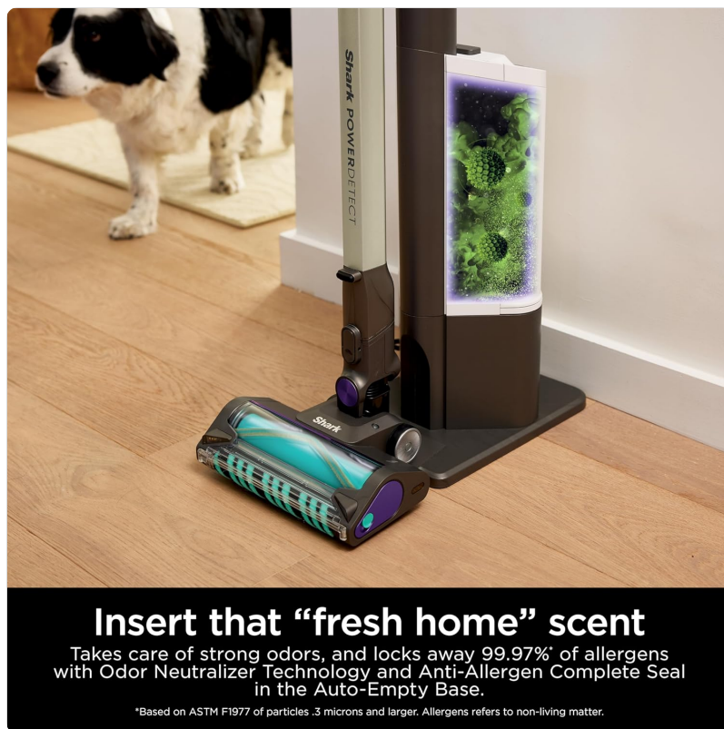
Image: The Shark PowerDetect vacuum docked, with an icon indicating its ability to lock away dirt, dust, allergens, and odors in the auto-empty base.