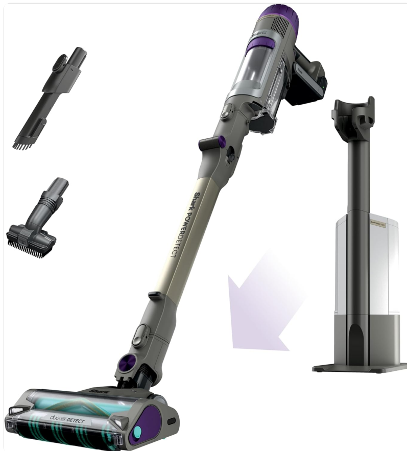
Image: The Shark PowerDetect Cordless Vacuum, its auto-empty dock, and included accessories: a duster crevice tool and a pet multi-tool.