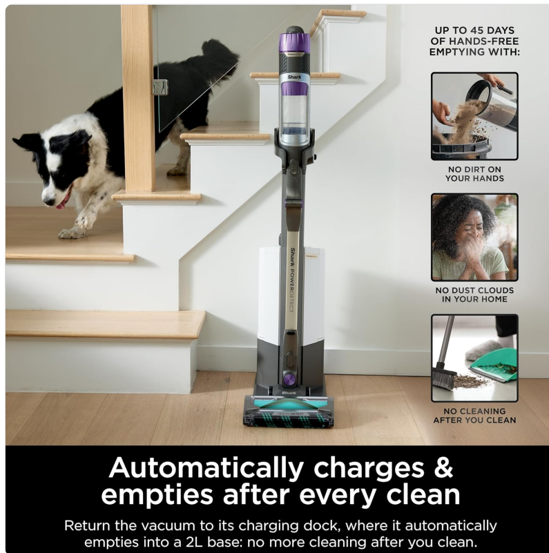
Image: The Shark PowerDetect Cordless Vacuum docked on its Auto-Empty base, illustrating how it charges and empties automatically.

3. Initial Charge: Place the assembled vacuum onto the Auto-Empty dock. Ensure the power adapter is connected to the dock and plugged into a wall outlet. The vacuum will begin charging automatically. A full charge can take up to 6 hours.