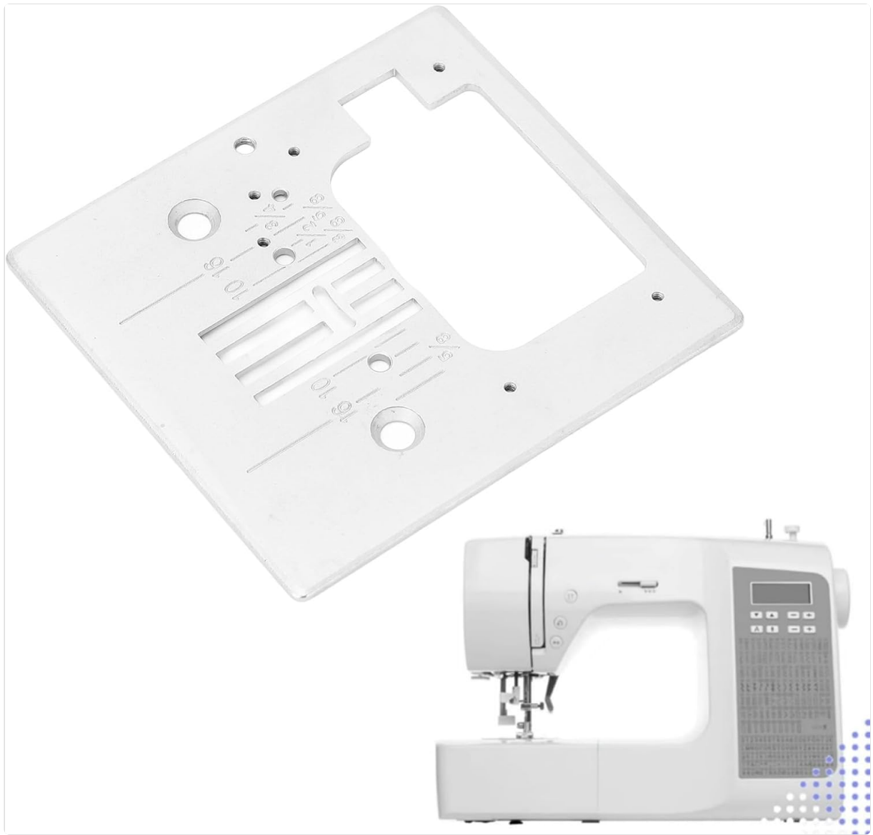
Image 2: The needle plate shown in context with a sewing machine, demonstrating where it is installed.