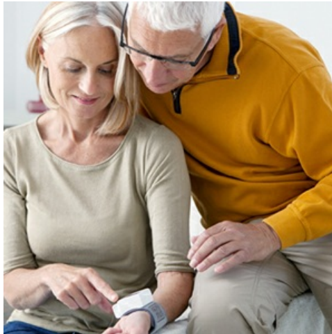
Image: A person's hand applying the wrist cuff of the blood pressure monitor to their wrist.

Wrap the cuff around your left wrist, approximately 1 cm (0.4 inches) above your hand, as shown in the diagram. The cuff should fit snugly but not too tightly, allowing for comfortable inflation. Ensure the monitor's display is facing upwards.