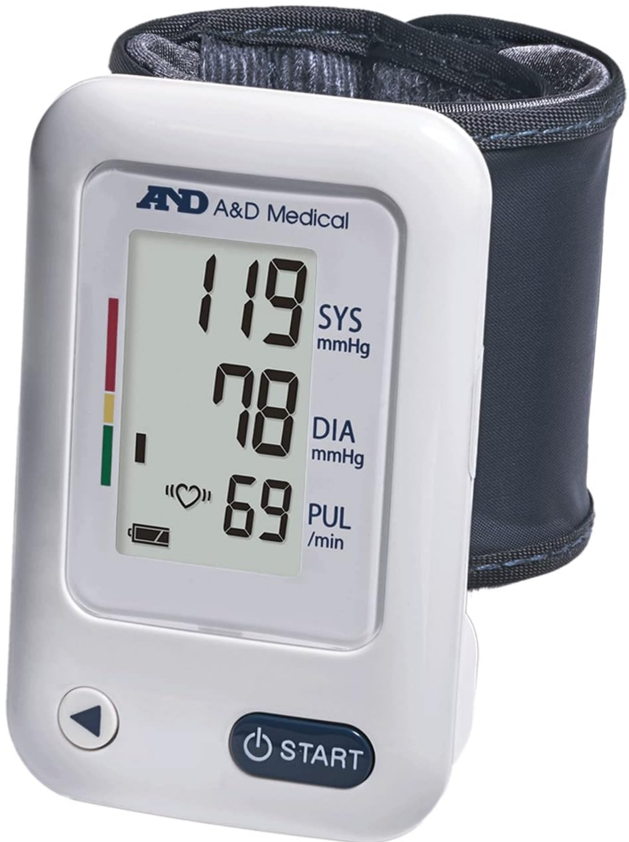
Image: The A&D Medical UB-525 Wrist Blood Pressure Monitor, a compact device with a digital display and an attached wrist cuff.