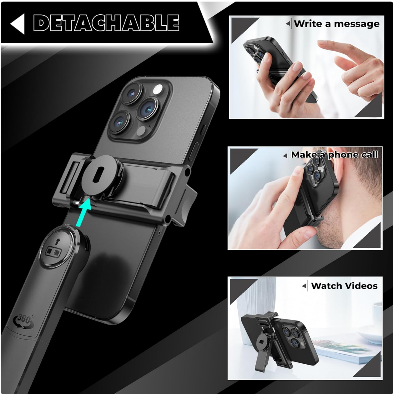
Figure 3: Detachable Phone Holder