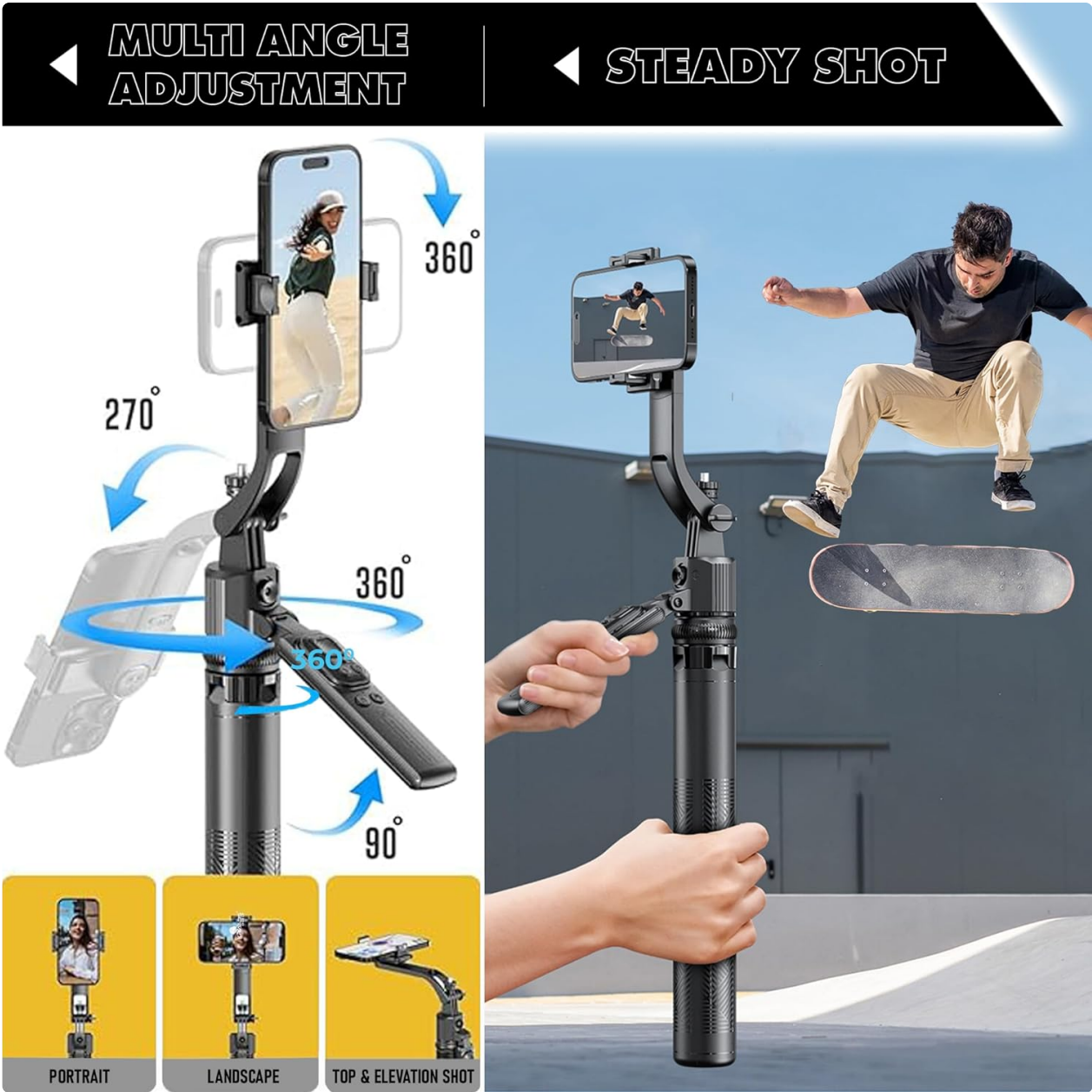
Figure 6: Multi-Angle Adjustment