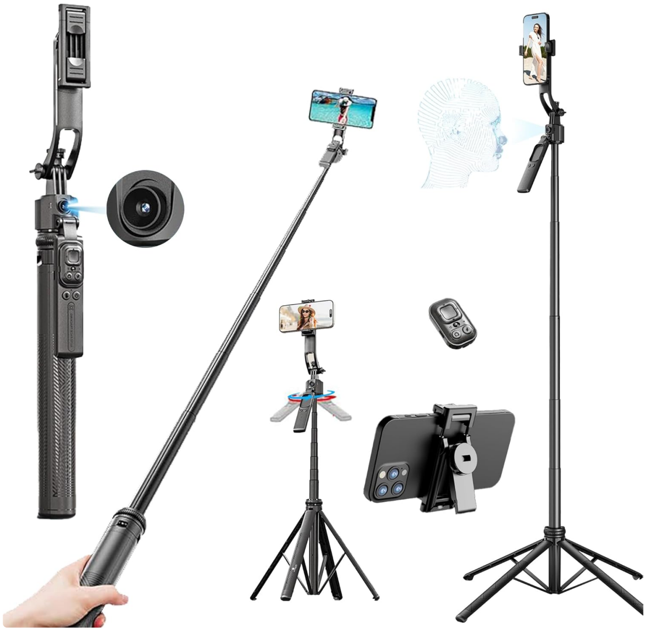
Figure 1: Kratos K8 AI-Powered Selfie Stick Tripod