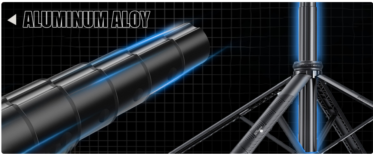
Figure 8: Aluminium Alloy Construction