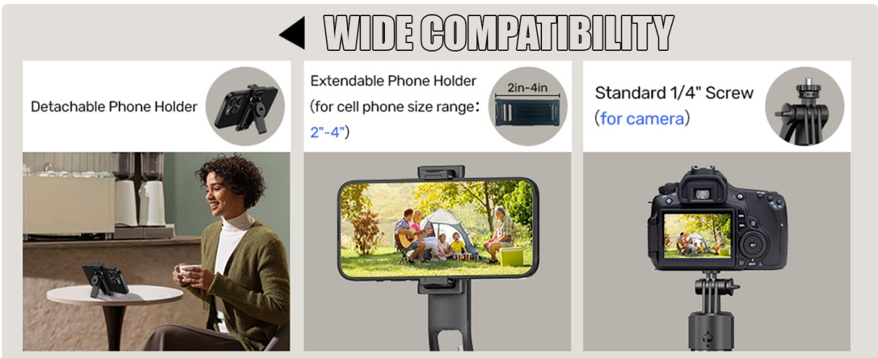
Figure 4: Wide Device Compatibility