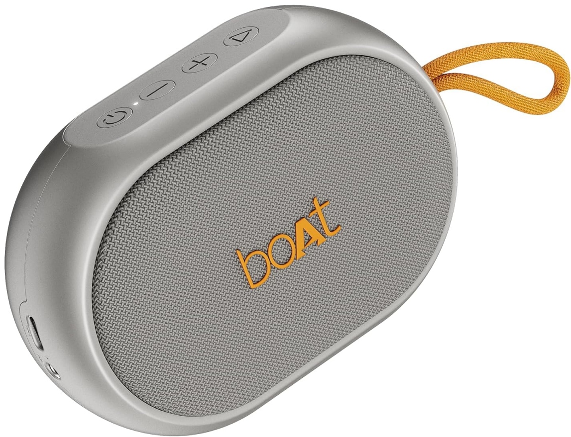
Image: The boAt Stone 110 Bluetooth Speaker in Groovy Grey, showcasing its compact design and front grille.