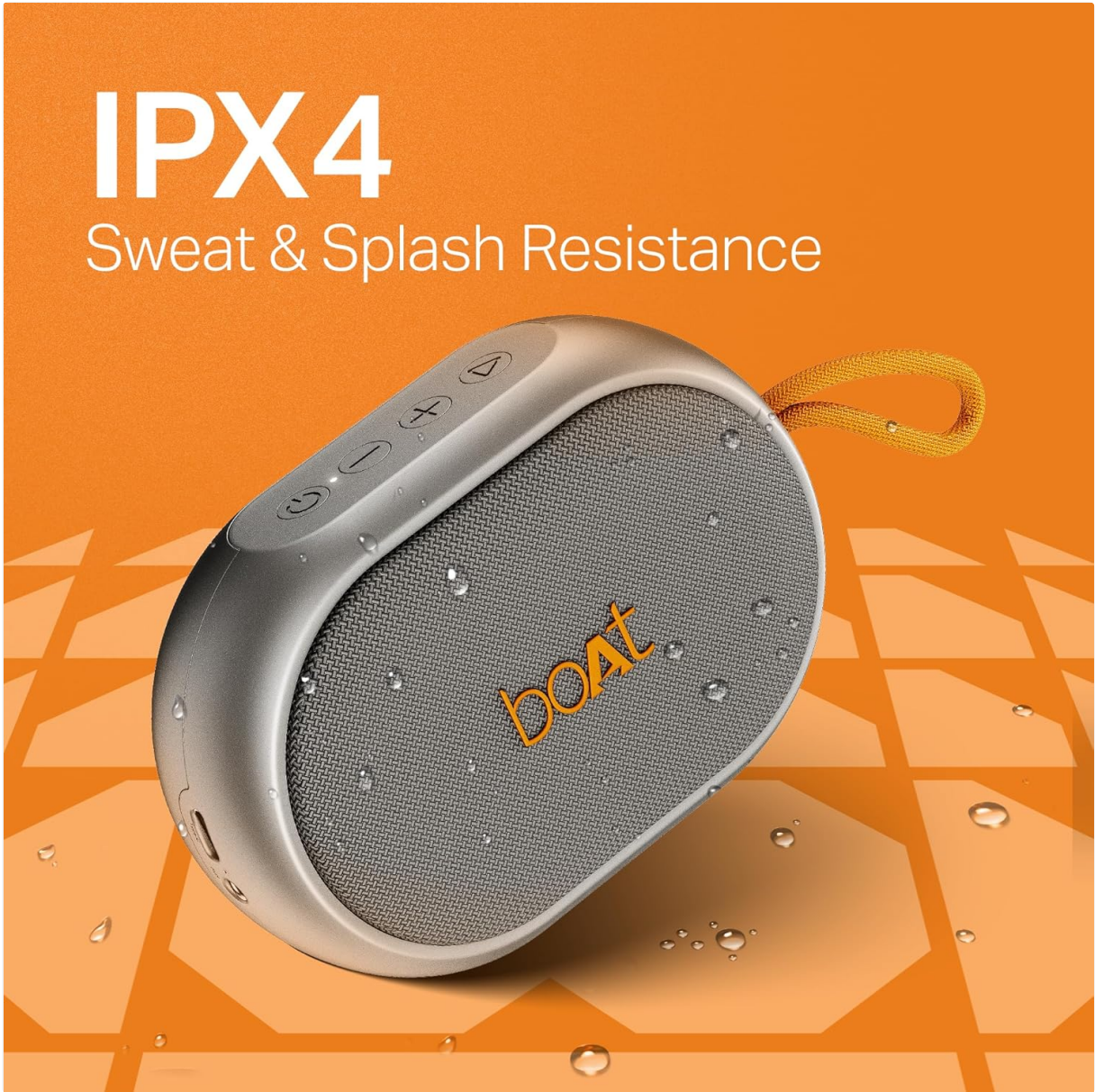
Image: The boAt Stone 110 speaker with water droplets on its surface, illustrating its IPX4 rating for sweat and splash resistance.

Wipe the speaker with a soft, damp cloth. Do not use harsh chemicals or abrasive cleaners. Ensure the charging port cover is securely closed to maintain IPX4 resistance.