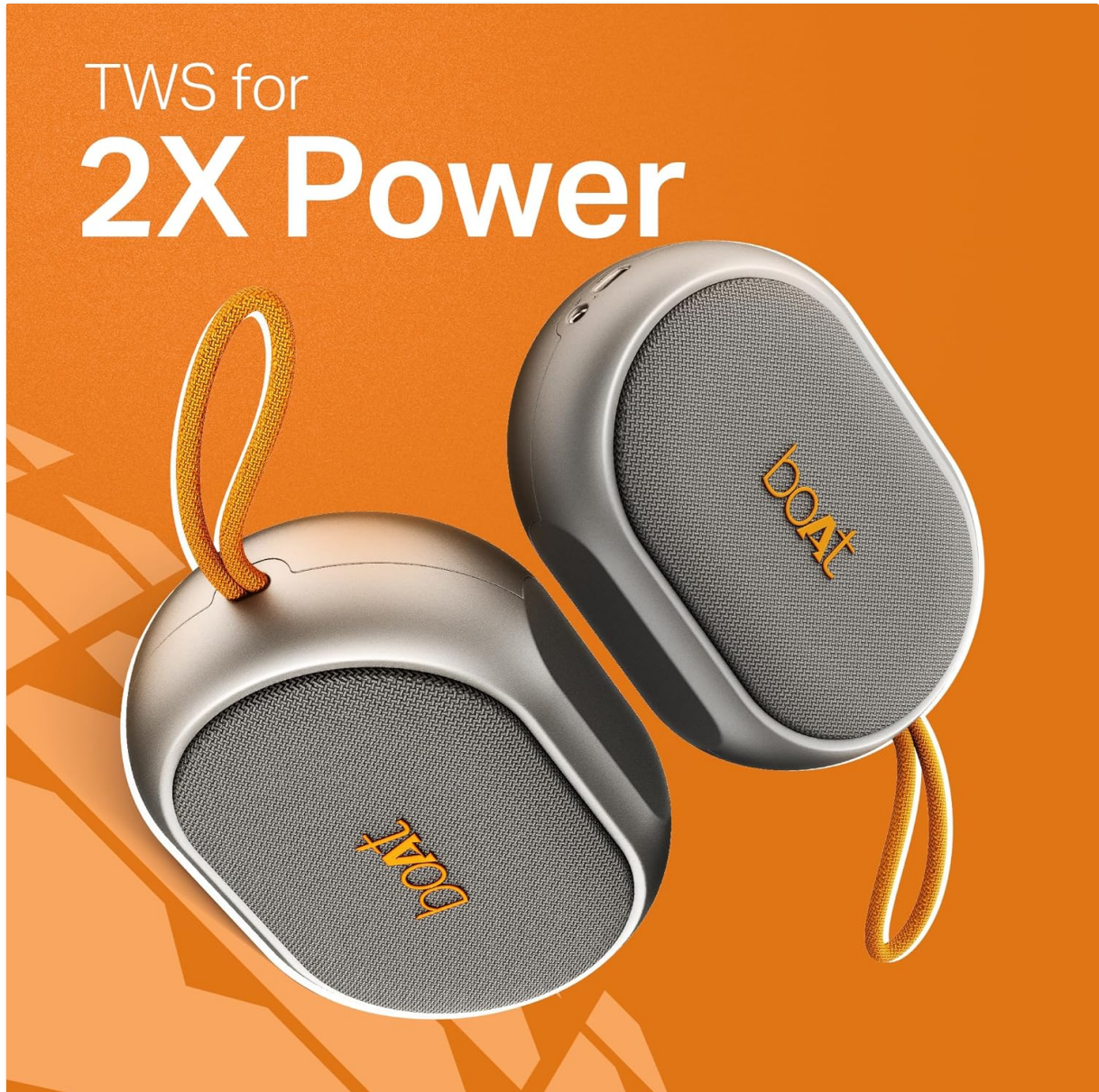
Image: Two boAt Stone 110 speakers positioned to illustrate their TWS pairing capability, providing enhanced audio output.

Pair two boAt Stone 110 speakers for a stereo audio experience: