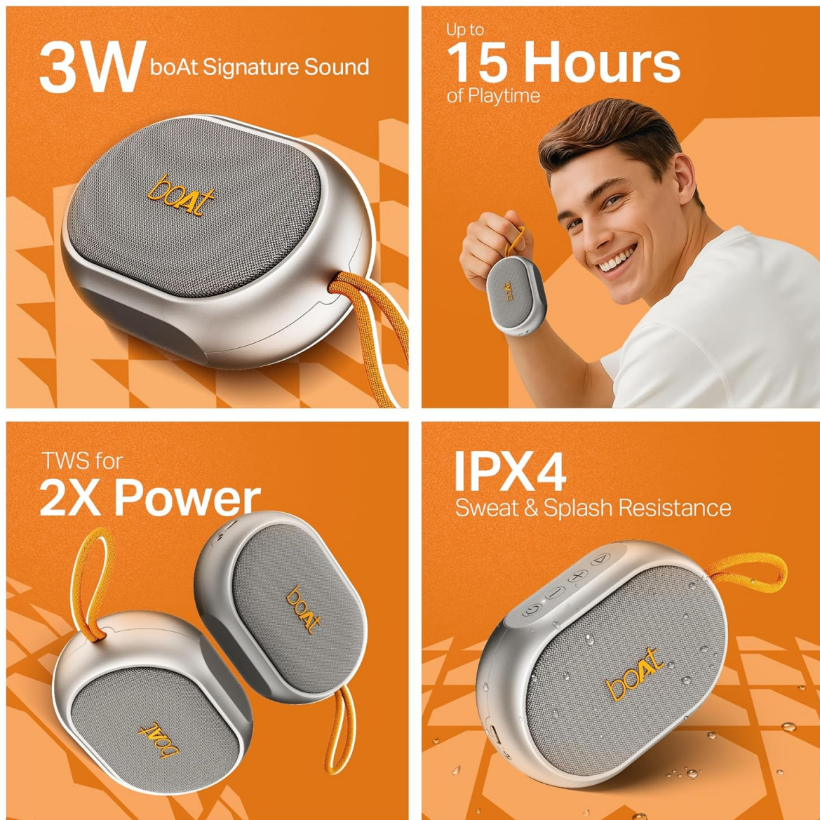
Image: A collage illustrating the boAt Stone 110's main features: 3W Signature Sound, up to 15 hours of playtime, TWS for 2X power, and IPX4 sweat & splash resistance.