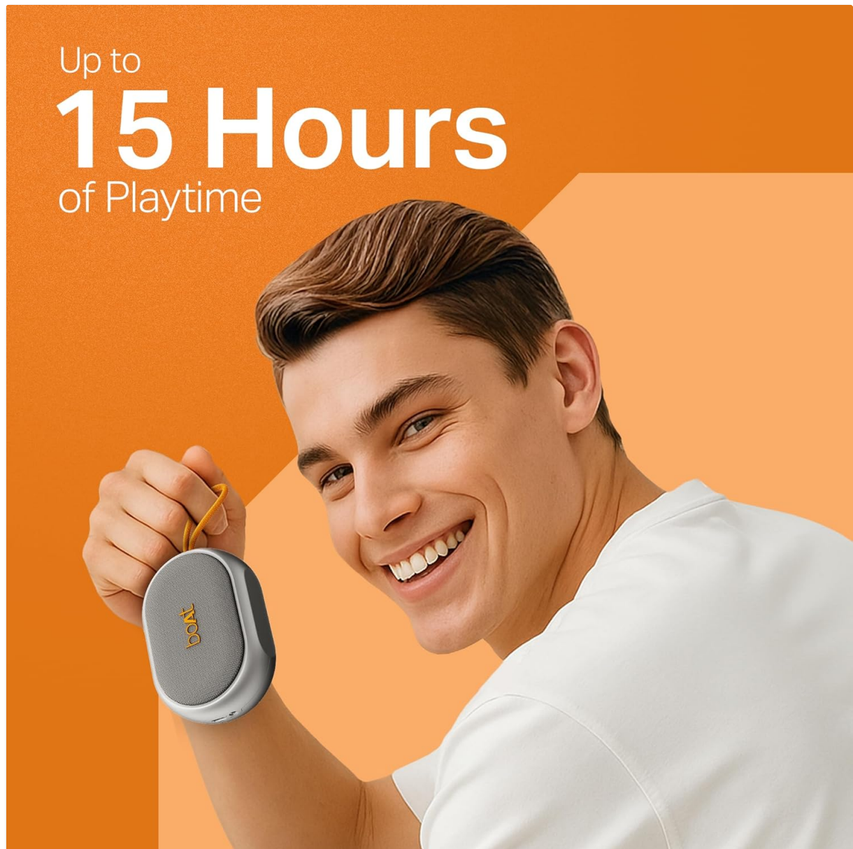
Image: A person holding the compact boAt Stone 110 speaker, illustrating its portability and ease of handling.