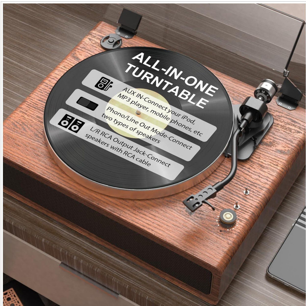
Image 4.1: All-in-one Turntable Features. This image highlights the various input and output options available on the turntable, including AUX IN, Phono/Line Out, and L/R RCA Output.