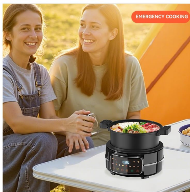
Figure 2: Examples of meals prepared with the multi-cooker, highlighting its versatility.