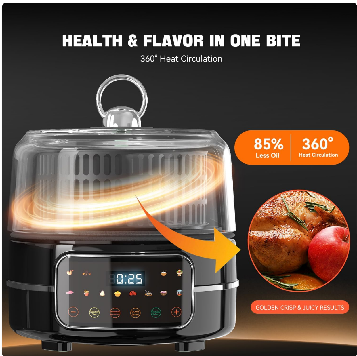
Figure 4: Detailed view of the digital touch control panel with preset icons and adjustment buttons.

The appliance features an intuitive touch control panel with a digital display. The panel includes various preset icons for different food types and cooking functions, along with time and temperature adjustment buttons.