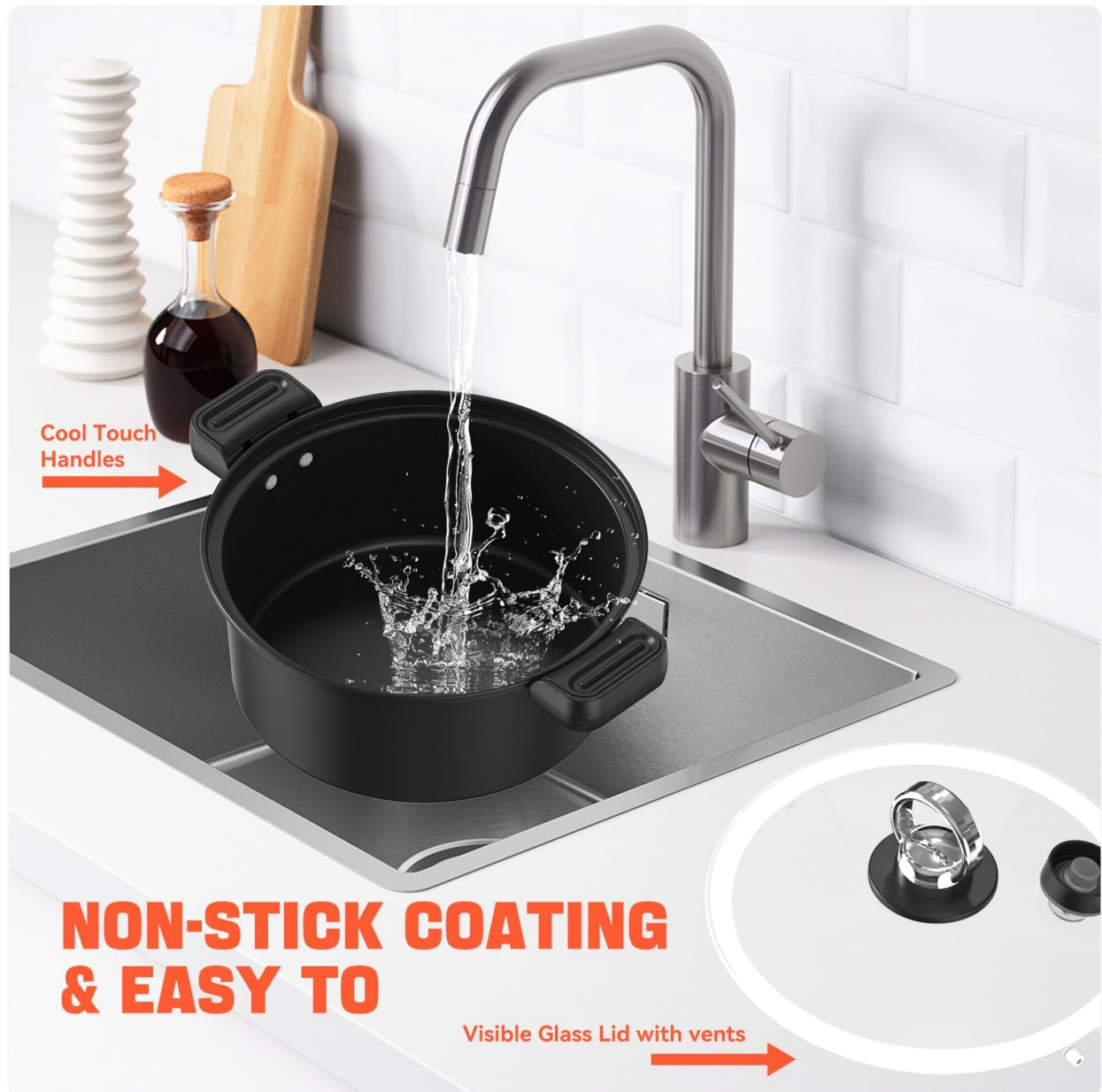
Figure 6: The non-stick pot is easy to clean by hand or in a dishwasher.