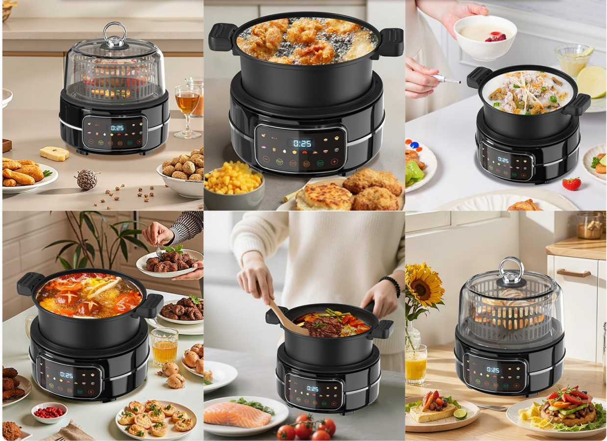
Figure 1: The kaito 6QT Air Fryer & Multi-Cooker Combo showcasing its air frying and hot pot modes.