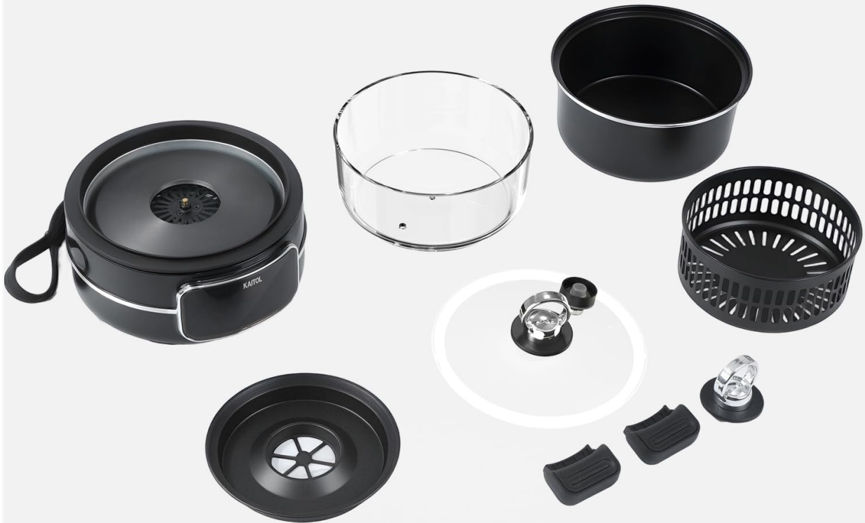
Figure 7: Detachable components are dishwasher-safe for hassle-free cleaning.