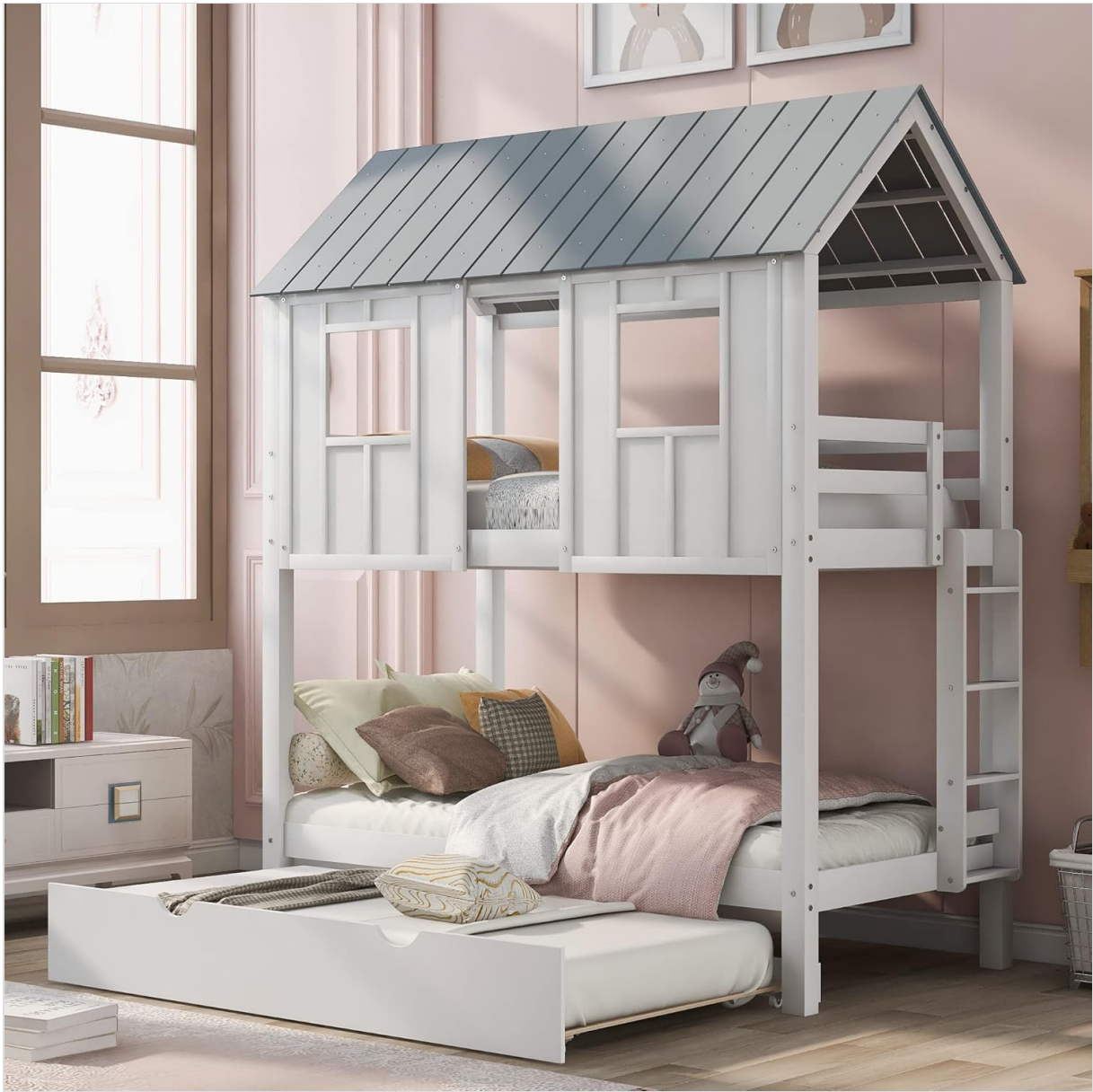
Image: Fully assembled Bellemave Tree House Bunk Bed with Trundle.