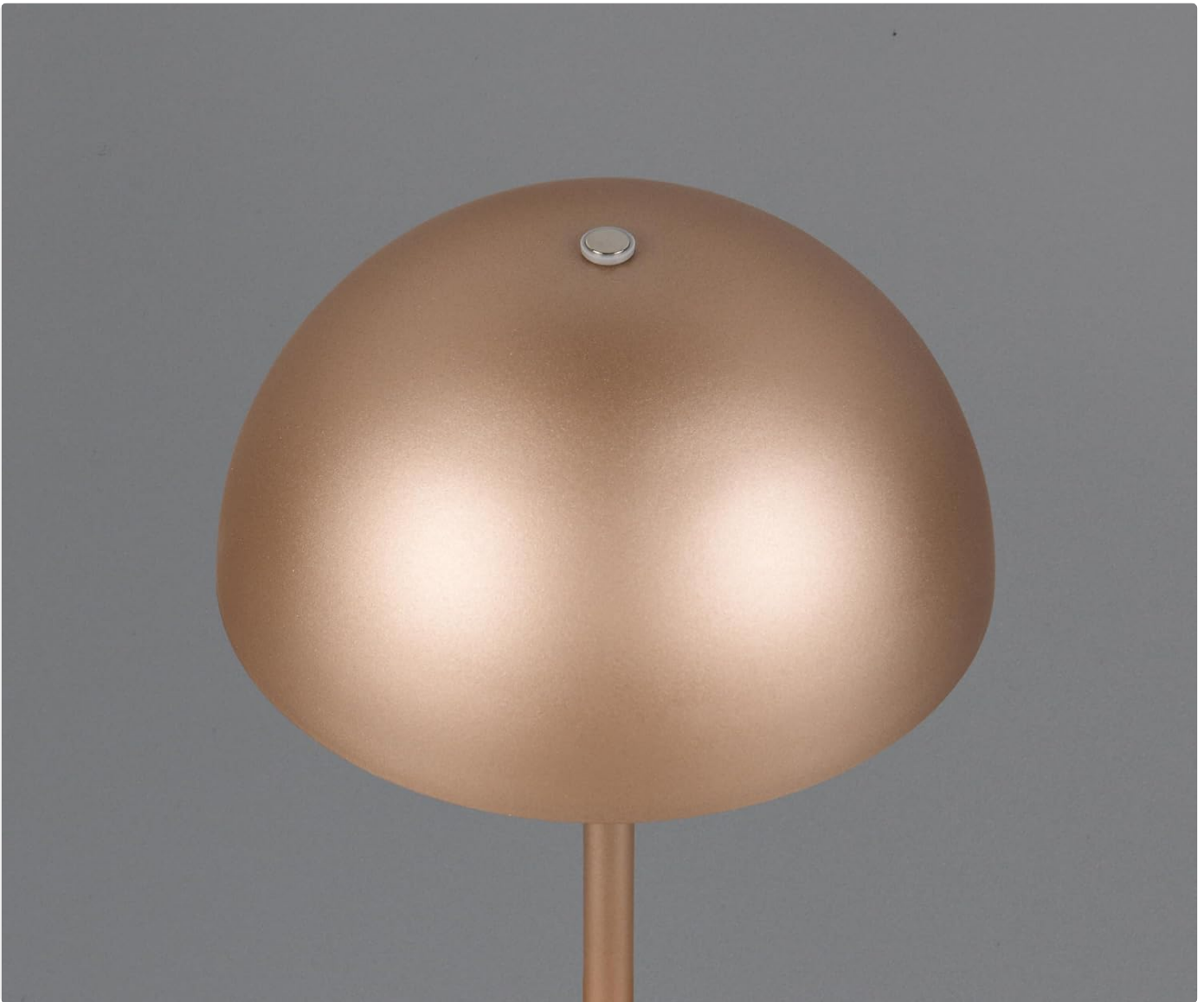
Image: Close-up of the lamp's top, indicating the location of the touch sensor for control.