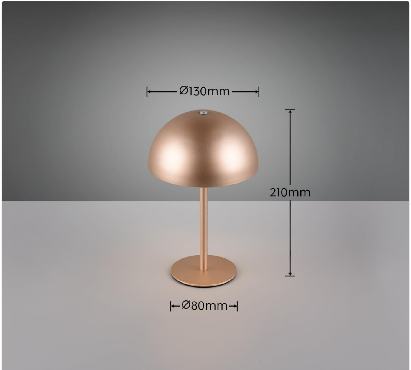
Image: Technical drawing with precise dimensions of the lamp, including height, shade diameter, and base diameter.