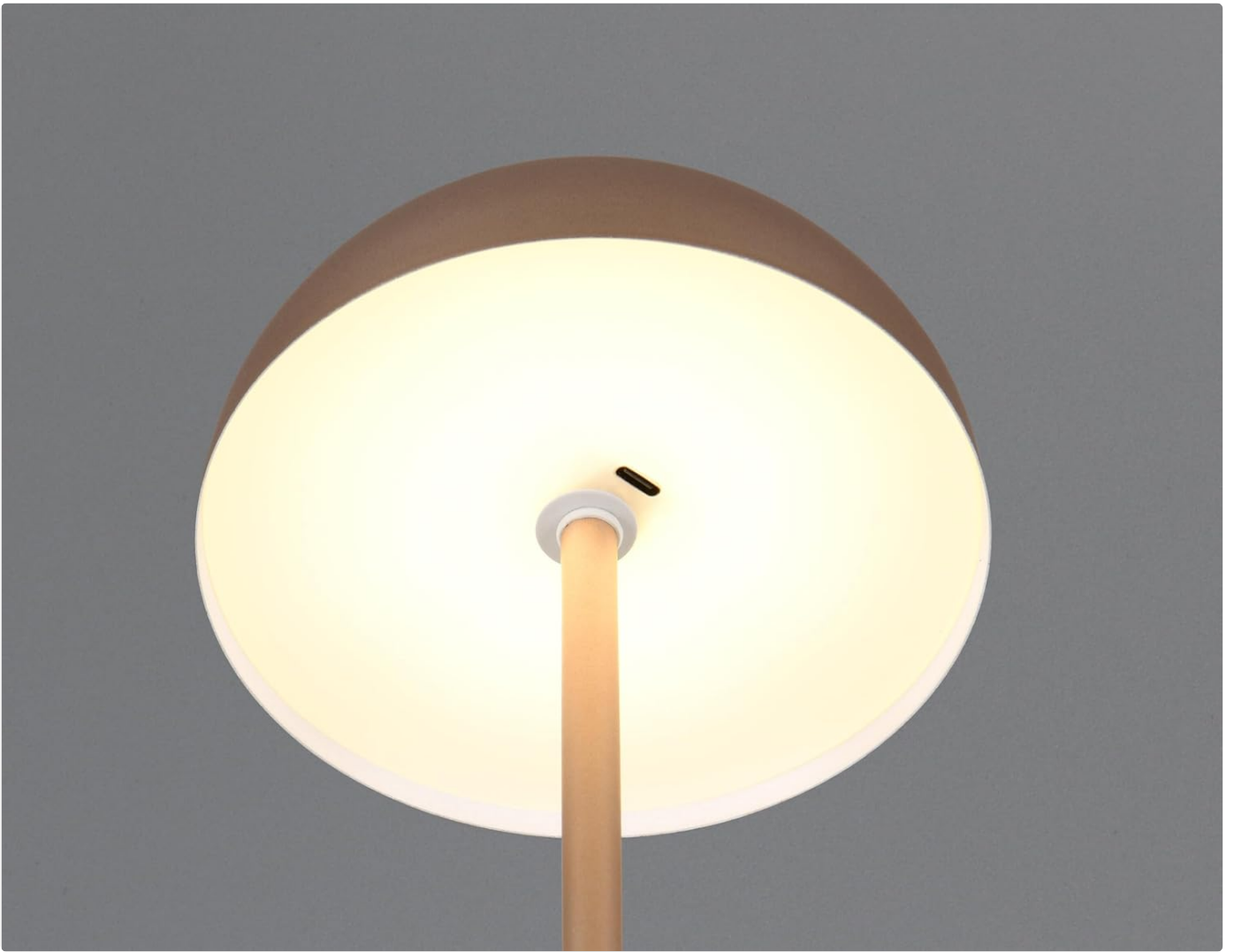
Image: Underside view of the lamp, highlighting the USB charging port for battery replenishment.