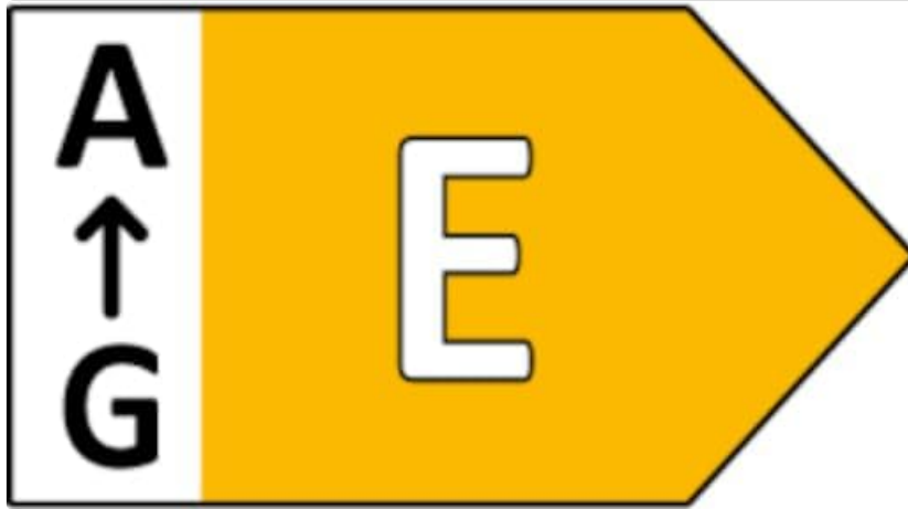
Image: Energy efficiency label indicating the product's energy class as E.