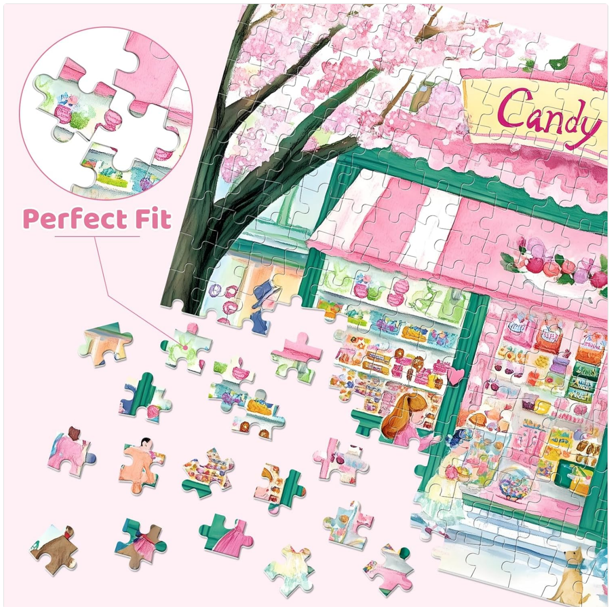
Image: A close-up view of puzzle pieces demonstrating their precise fit.