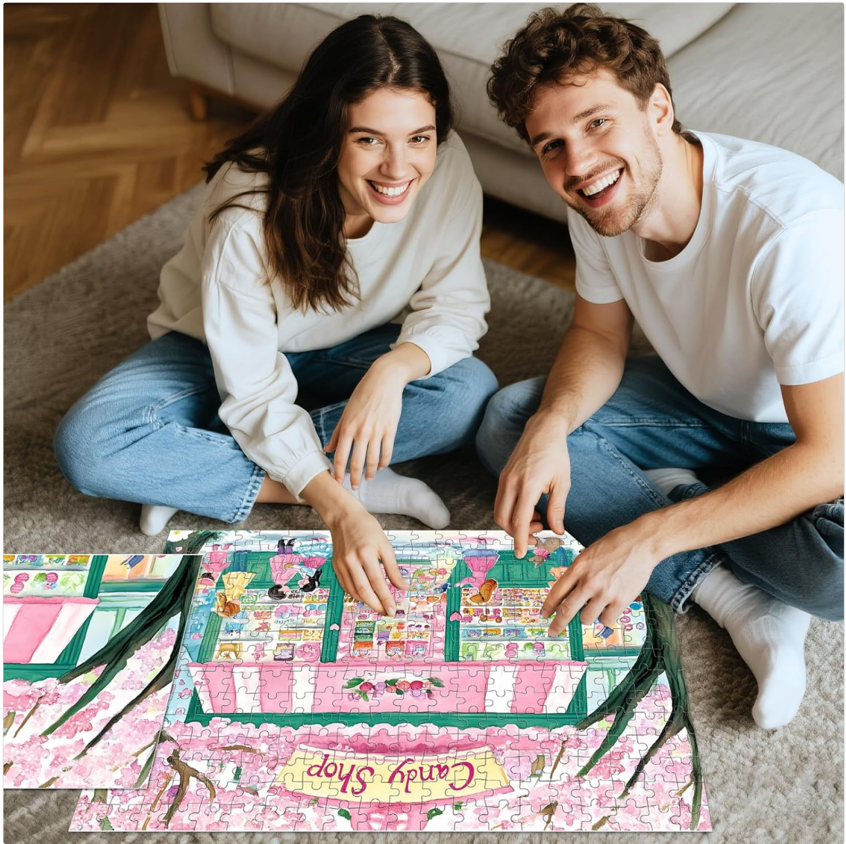
Image: Individuals assembling the puzzle, demonstrating the process.