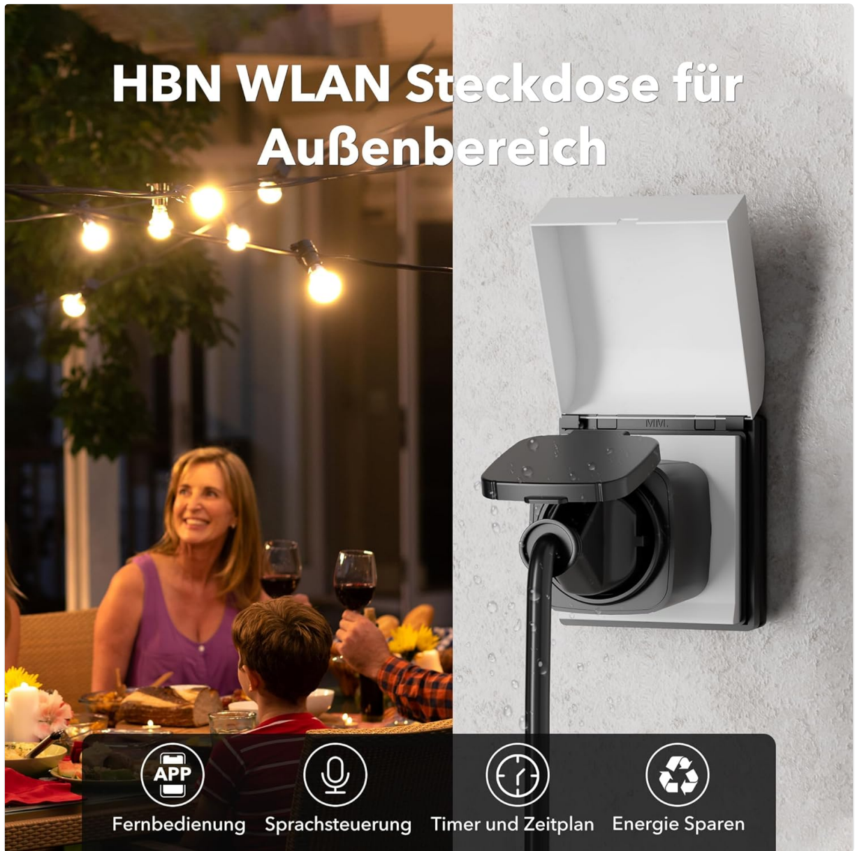
Image 1.1: The HBN Outdoor Wi-Fi Smart Plug in an outdoor environment, demonstrating its use with decorative string lights. The image highlights remote control, voice control, timer functions, and energy saving capabilities.