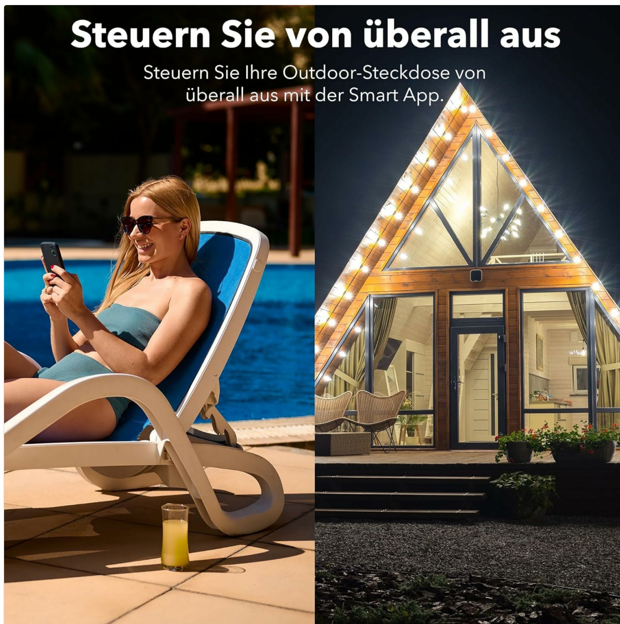
Image 4.1: A user demonstrates controlling the outdoor smart plug remotely using a smartphone app, highlighting the convenience of managing devices from any location.