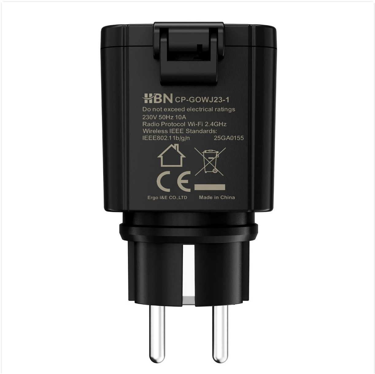
Image 1.2: Rear view of the HBN Outdoor Wi-Fi Smart Plug, displaying the model number CP-GOWJ23, electrical ratings (230V 50Hz 10A), Wi-Fi protocol (2.4GHz), and CE certification.