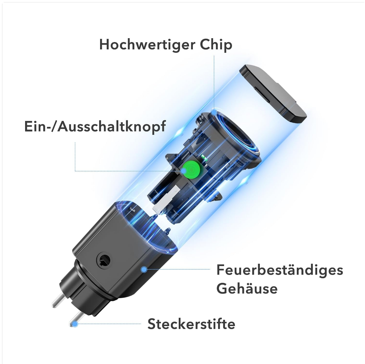
Image 1.3: An exploded view diagram illustrating the key internal and external components of the smart plug, such as the high-quality chip, on/off button, fire-resistant housing, and robust plug pins.