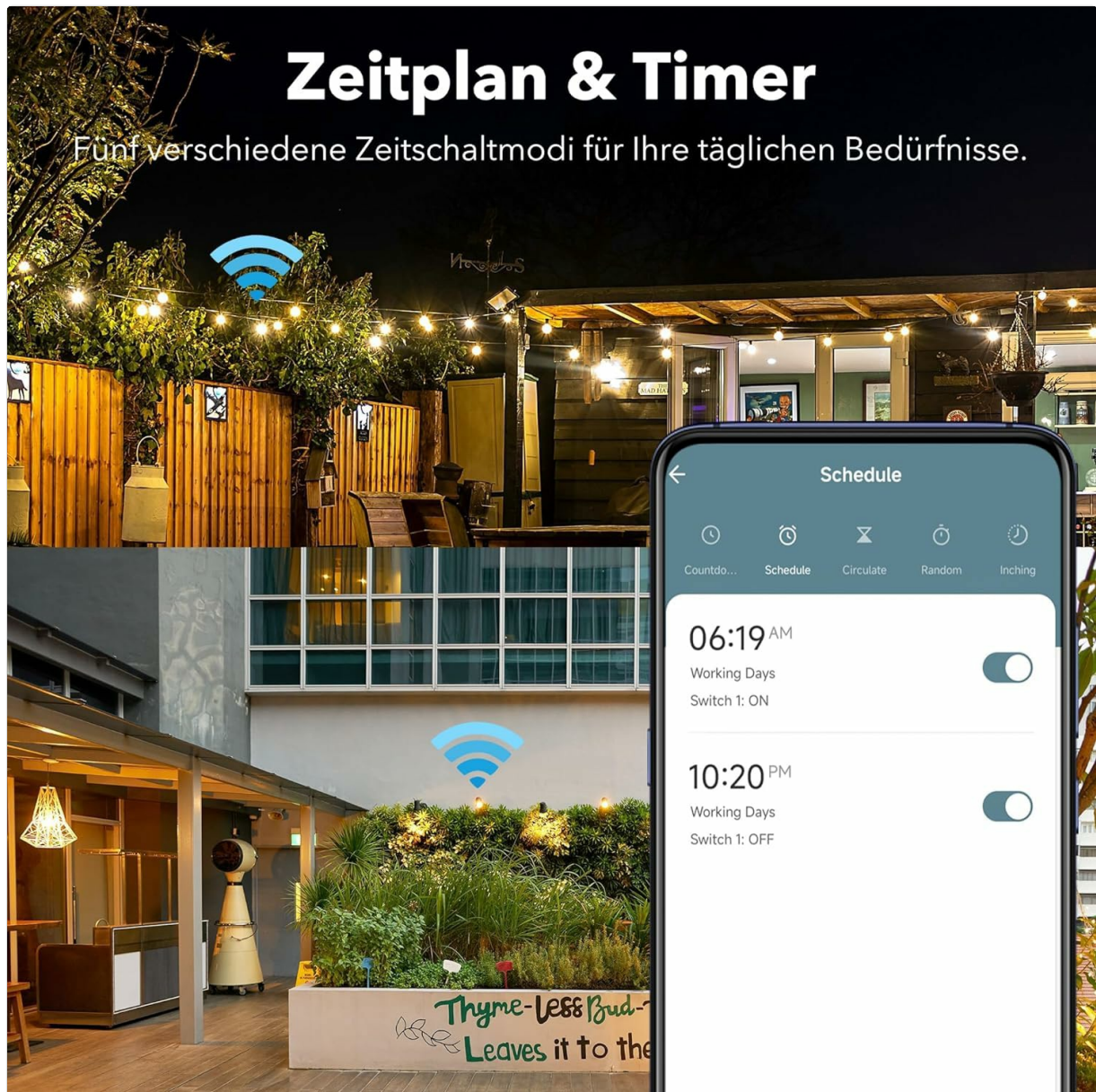
Image 4.3: A smartphone screen displaying the app's scheduling interface, offering multiple timing modes such as countdown, daily schedules, circulation, random, and inching, to meet diverse automation needs.