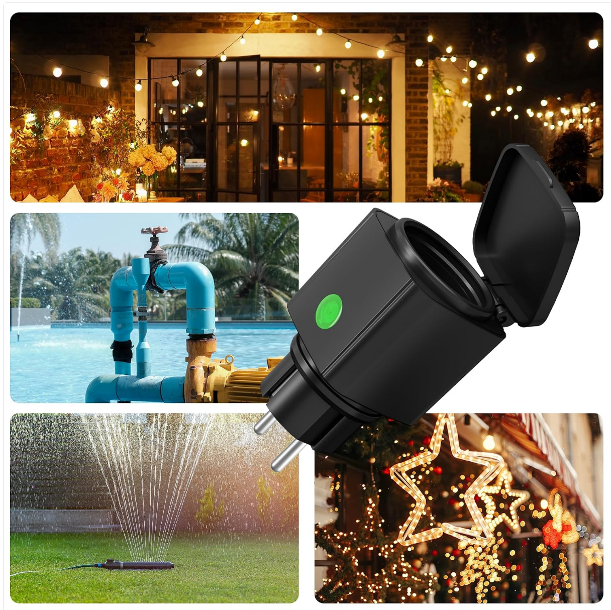
Image 4.4: A visual representation of the smart plug's diverse applications, including controlling outdoor string lights, garden fountains, irrigation systems, and festive holiday lighting.