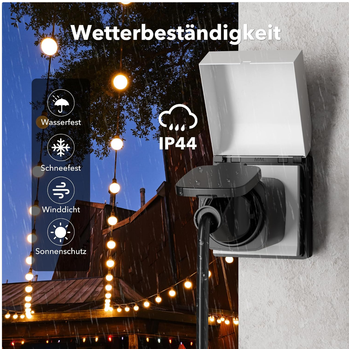
Image 2.1: The smart plug is shown with icons indicating its weather-resistant features: waterproof, snowproof, windproof, and sun protection, all contributing to its IP44 rating for outdoor durability.