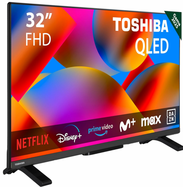
Image 1.1: Front view of the Toshiba 32QV2F63DG Smart QLED TV, showcasing its slim design and vibrant display.