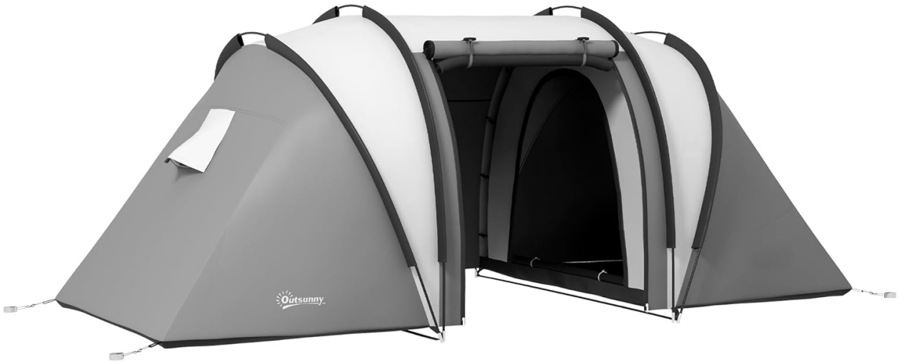
Description: This image shows the Outsunny family camping tent from the front, highlighting its grey and white design and overall structure.