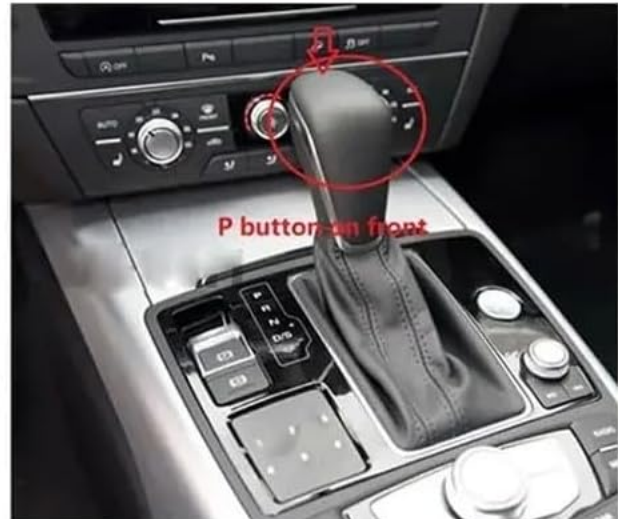
For 2017-2018 years car

Image: Visual guide for checking car compatibility, showing different MMI software versions (RMC 2012-2018, HN+R 2012-2015, MHI2 2016-2018) and gear shift button placements (left for 2012-2016, front for 2017-2018).