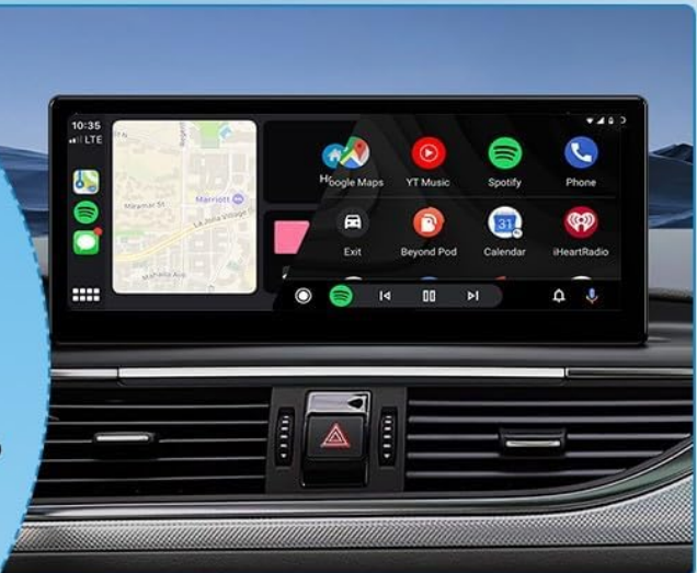
Image: A visual guide detailing the steps for connecting to Wireless CarPlay and Android Auto, including Bluetooth pairing and using the 'Zlink5' application.