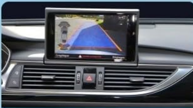
Backup Camera Display