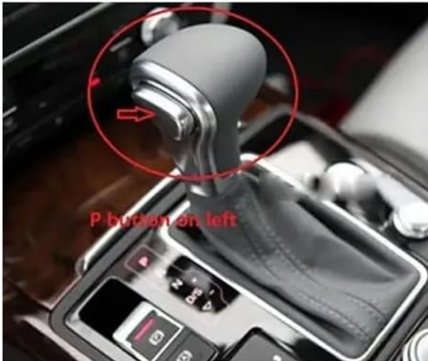
For 2012-2016 years car