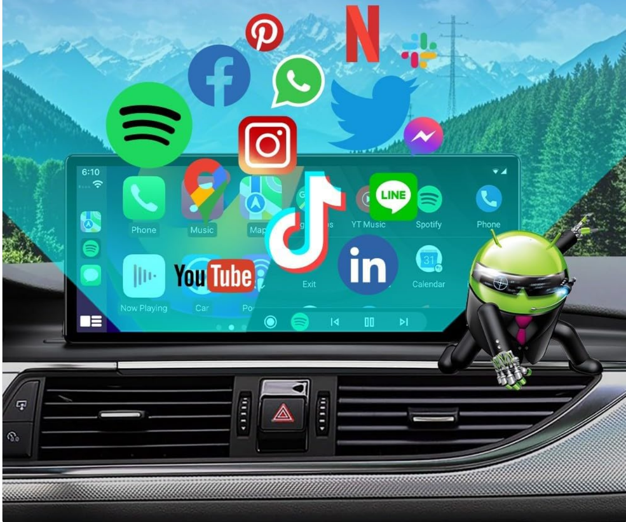
Image: The KUNFINE Android Stereo display showing a variety of popular applications such as Spotify, YouTube, Netflix, Facebook, and more, indicating the system's app compatibility.