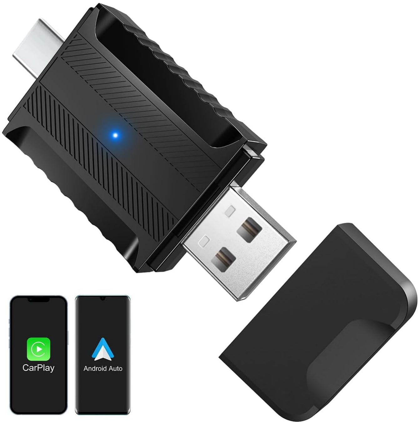
Image: The iHeylinkit 2-in-1 Wireless CarPlay & Android Auto Adapter, showcasing its compact design and dual USB-A and USB-C connectivity.