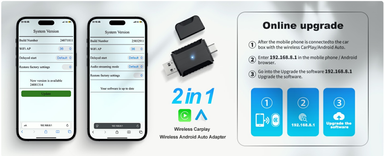
Image: A visual guide illustrating the steps for performing an online software upgrade for the wireless adapter via a web browser interface.