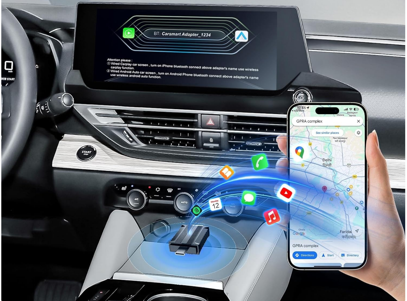
Image: An in-car display showing a stable connection to the wireless adapter, indicating readiness for CarPlay or Android Auto functionality.