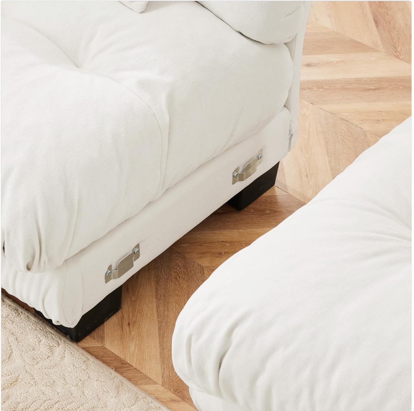
Image: Detail of the metal brackets used to connect modular sofa sections, ensuring a secure fit.