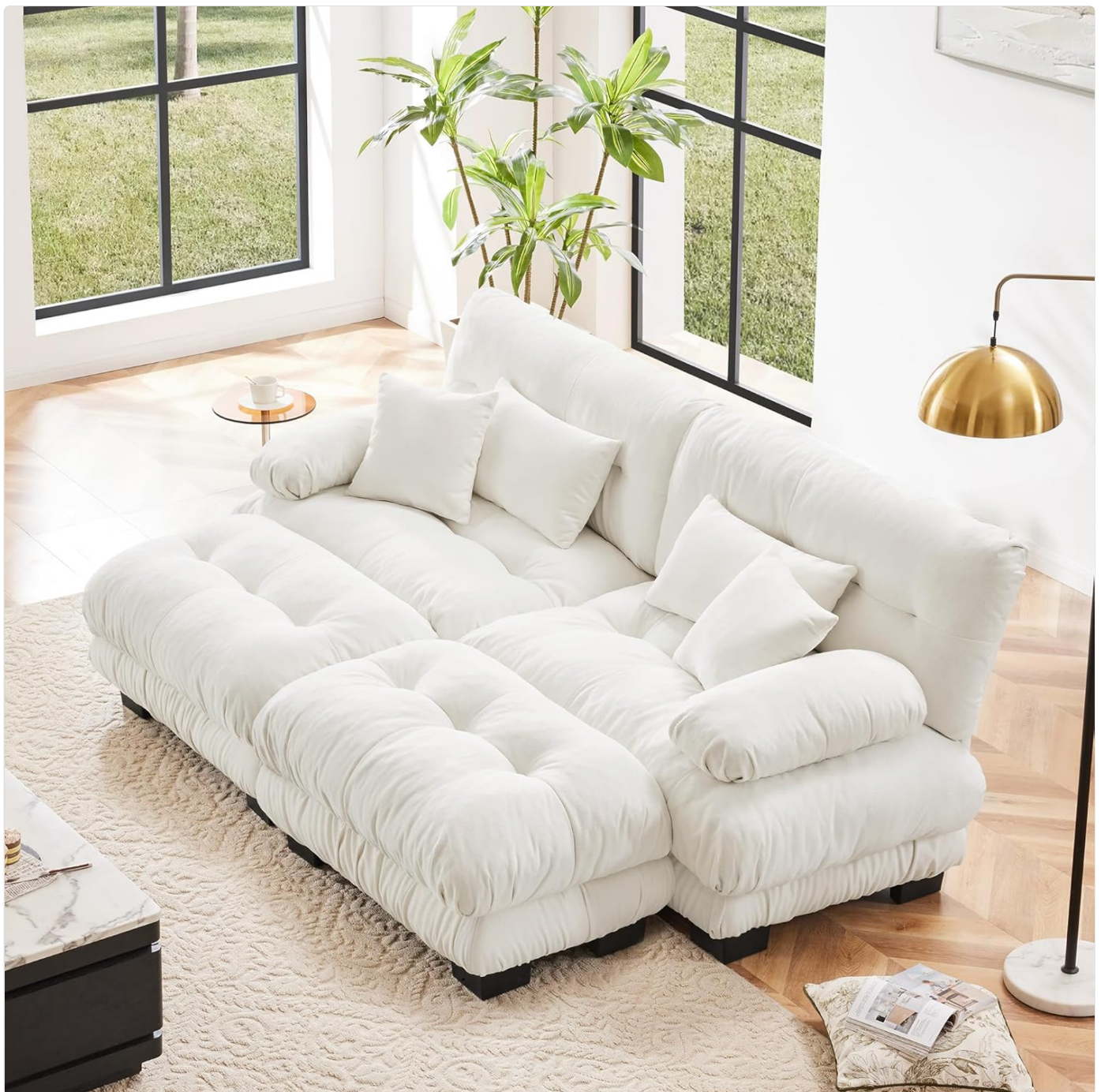
Image: The complete ALYIAMXL 2-Seater Modular Sectional Sofa with 2 Ottomans, shown in white chenille fabric.