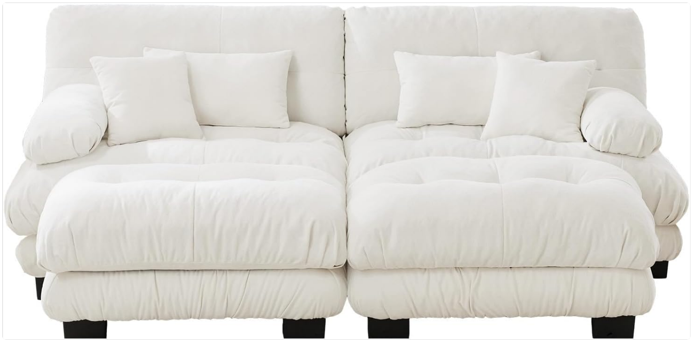
Image: Front view of the two modular sofa sections joined together, illustrating the completed assembly.