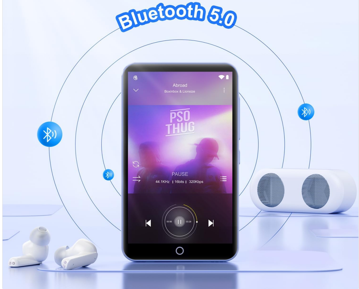
Image: A graphic demonstrating the Bluetooth 5.0 connection capability of the MP3 player, showing it wirelessly linked to both earbuds and a portable speaker.

Upgrade Bluetooth 5.0 enables longer transmission distance and more stable performance when connecting headphones and speakers.