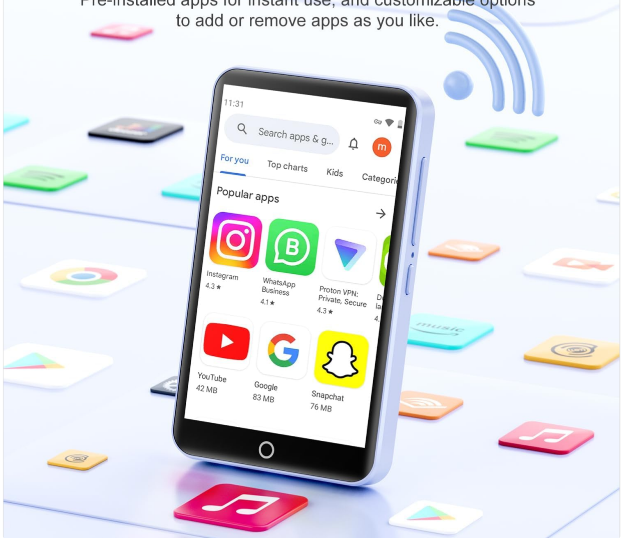
Image: The MP3 player's screen displaying a grid of popular app icons, illustrating its Wi-Fi connectivity and the ability to customize installed applications.

Pre-installed apps for instant use, and customizable options to add or remove apps as you like.