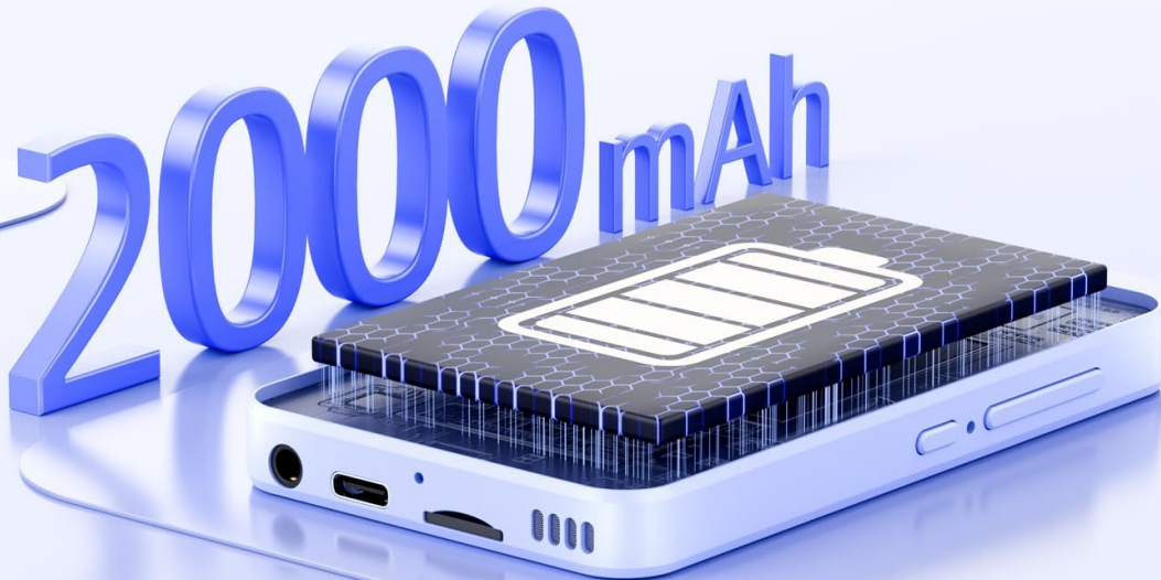
Image: An illustration detailing the 2000mAh battery capacity and its charging performance, including music and video playback times.