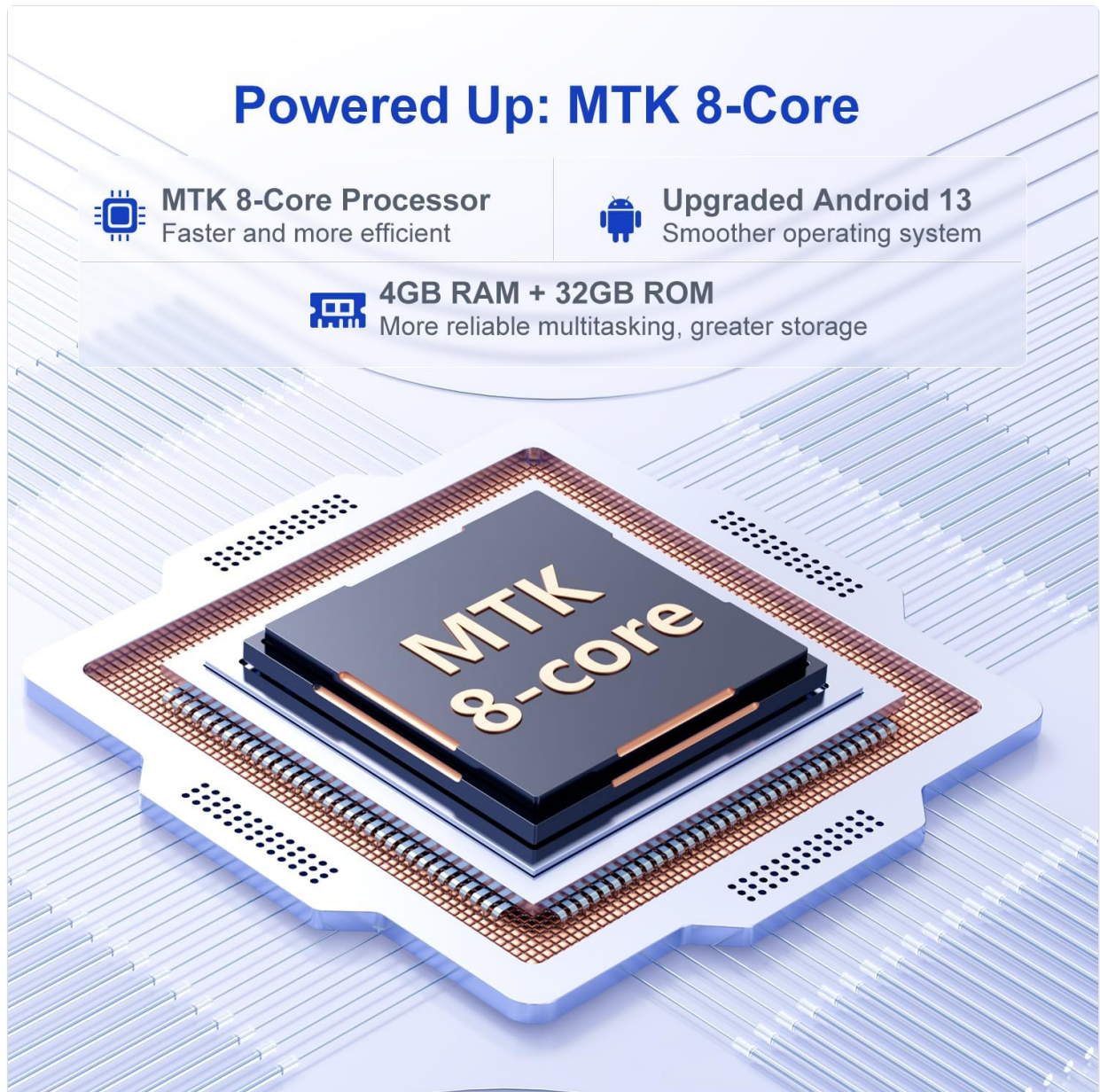
Image: A visual representation highlighting the internal MTK 8-core processor and Android 13 operating system, emphasizing the device's performance capabilities.