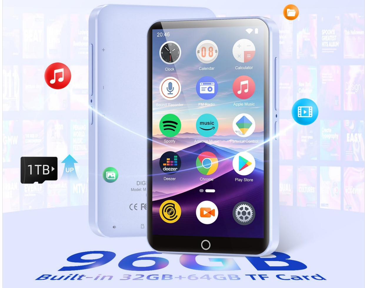
Image: A visual representation of the MP3 player's storage capabilities, highlighting the 96GB total storage (32GB built-in + 64GB TF card) and its expandability up to 1TB with a Micro SD card.

And supports expansion up to 1TB, allows you to store thousands of music, videos, and more.