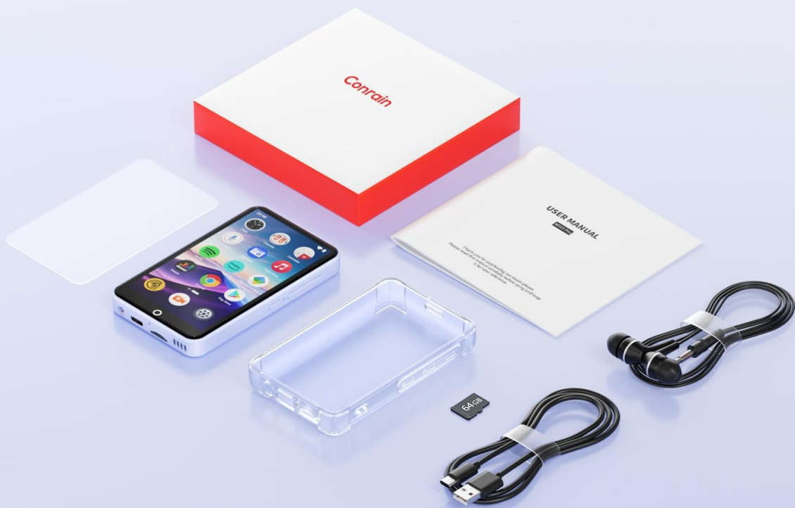
Image: An organized display of all items included in the Conrain M301 MP3 Player package, such as the player, wired headphones, USB-C cable, TF card, protective film, and case.