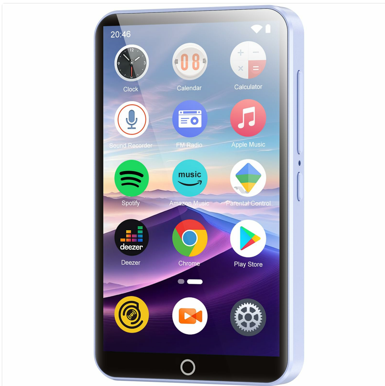
Image: The Conrain M301 MP3 Player, a compact device with a touchscreen, held in a hand, illustrating its portable design.

This manual provides detailed instructions for the operation and maintenance of your Conrain M301 96GB MP3 Player. Please read this guide thoroughly to ensure proper use and to maximize your device's capabilities.