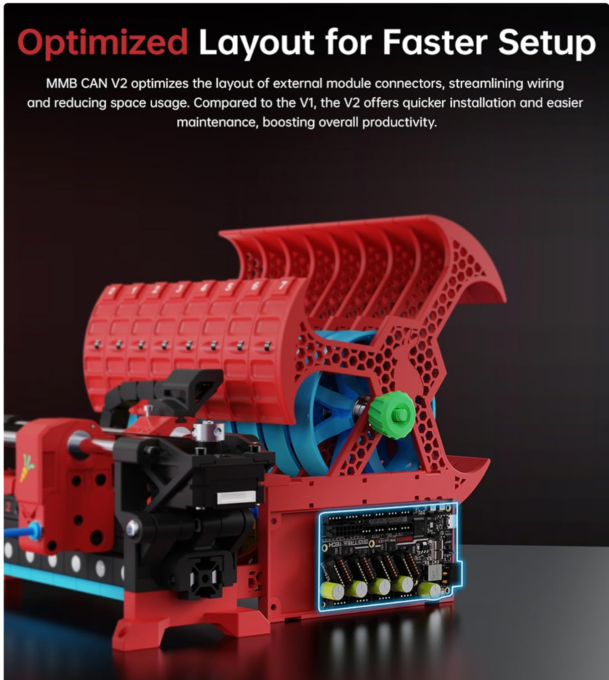
Image: The MMB CAN V2.0 board shown installed within an Enraged Rabbit Carrot Feeder V2 system, demonstrating its compact and optimized integration.