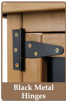
Black Metal Hinges