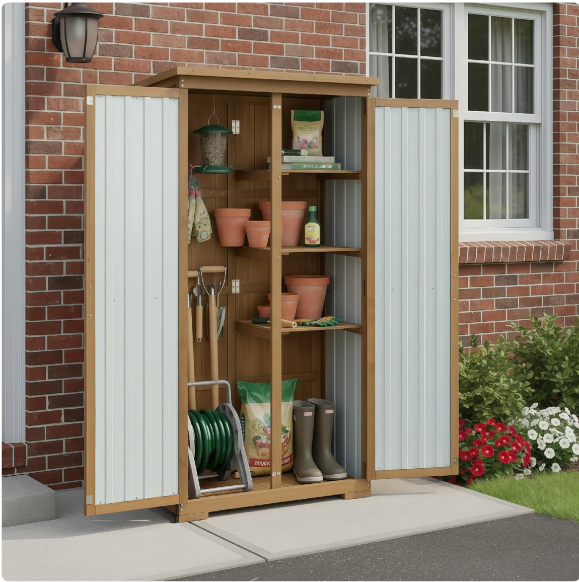
Image: The cabinet interior showcasing adjustable shelves and various storage configurations.