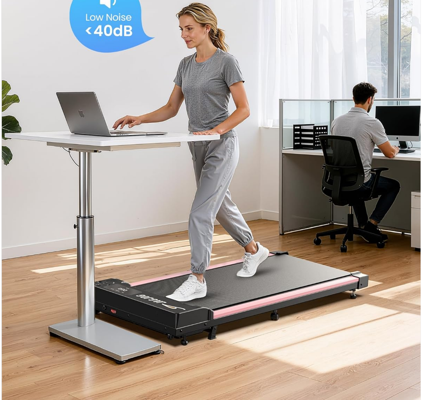
Image: The JAGJOG JT31 Walking Pad Treadmill is designed for quiet operation, making it suitable for use in various environments, including under a standing desk in an office or home setting. Its low noise level (below 40dB) ensures minimal disturbance.