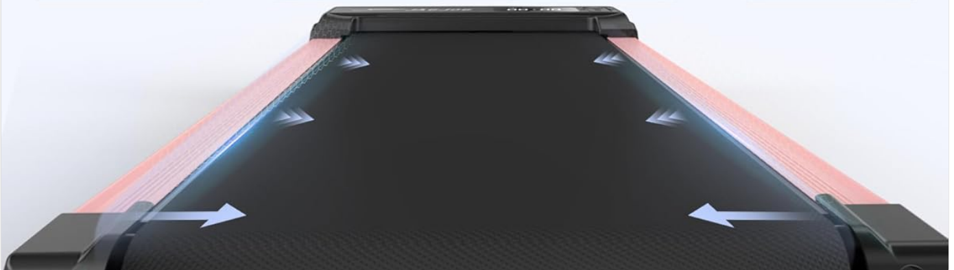
Image: The treadmill supports various exercise modes, from gentle walking to brisk jogging, and includes a climbing mode utilizing the 15-degree manual incline for enhanced cardiovascular benefits.