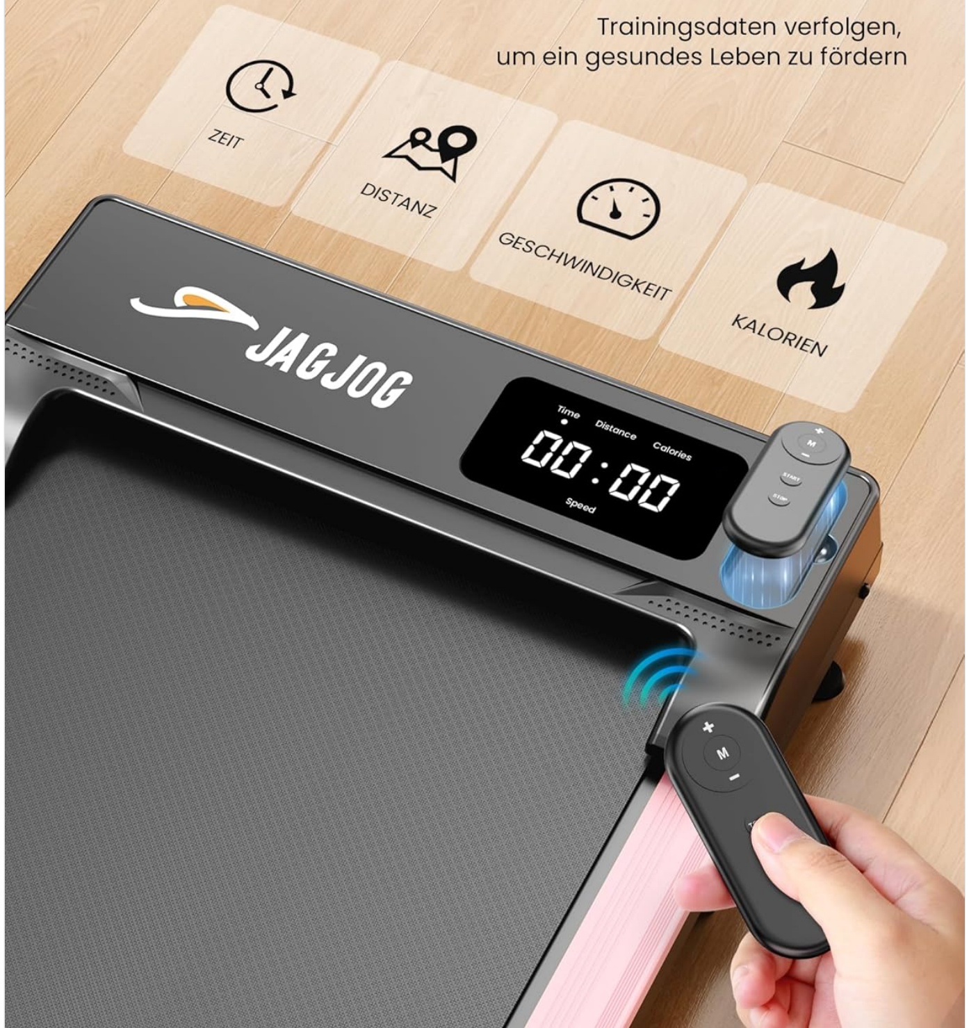
Image: The intelligent LED display provides real-time feedback on time, distance, speed, and calories. The wireless remote control allows for easy adjustment of settings without interrupting your exercise.

Trainingsdaten verfolgen, um ein gesundes Leben zu fördern