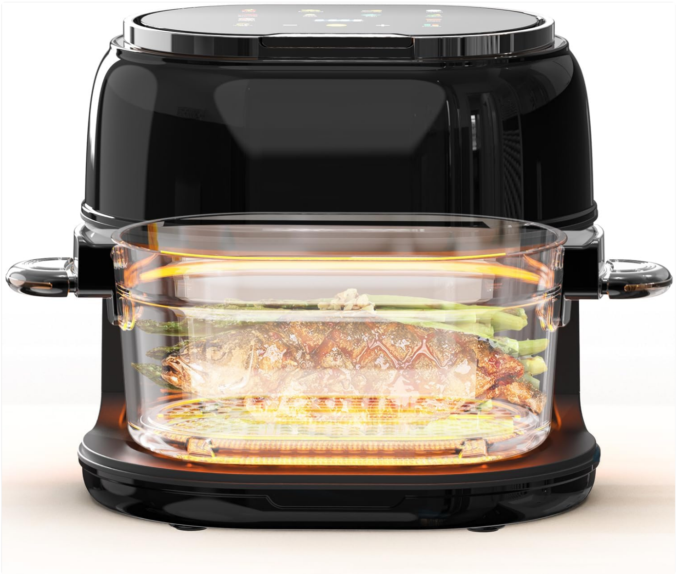
Figure 3.1: The KAITOL 5L Glass Hot Air Fryer in operation, showing a fish and asparagus cooking in the transparent glass basket.