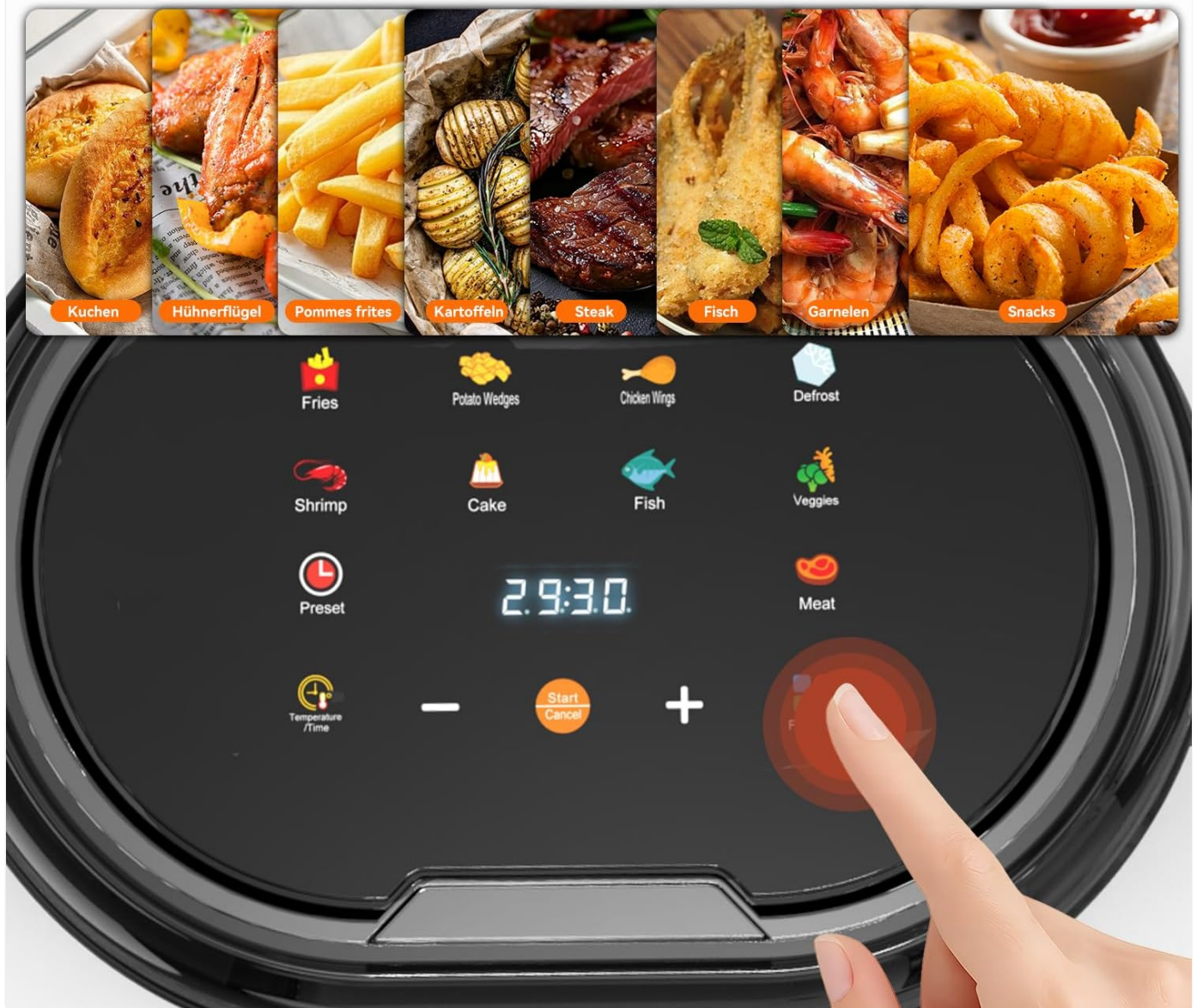
Figure 3.2: Digital LED touch screen displaying various preset cooking icons for different food types.