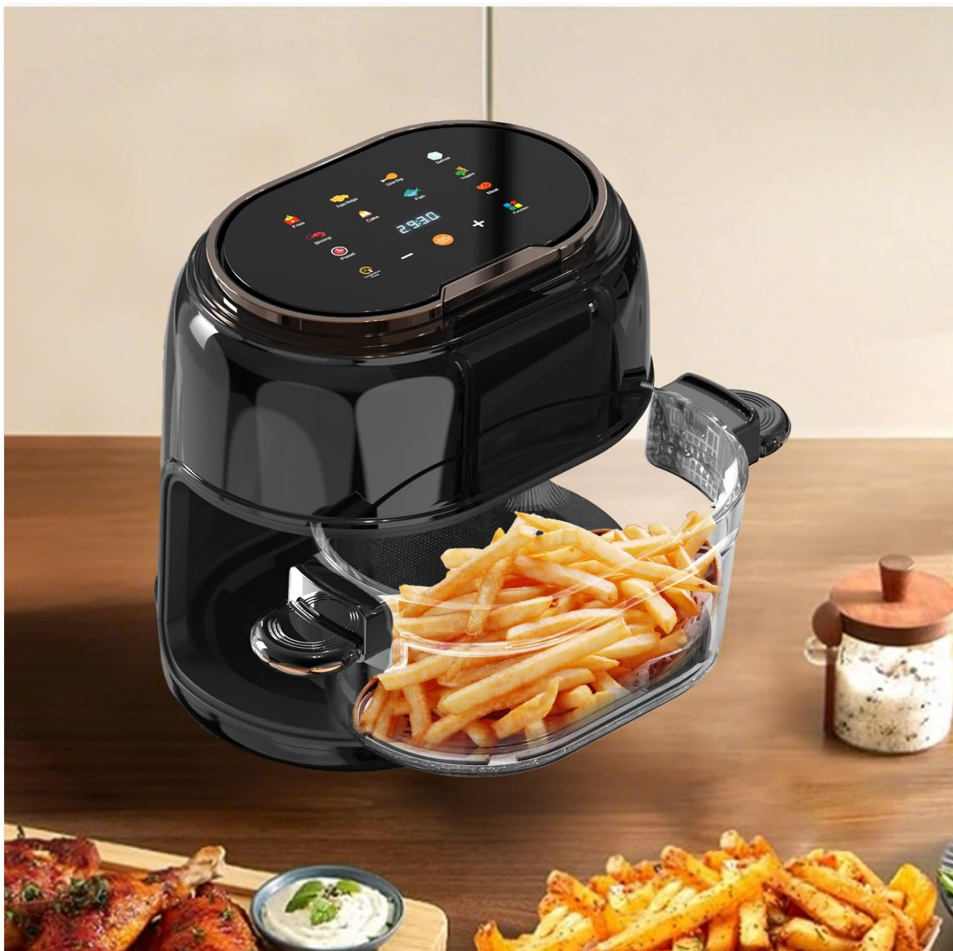
Figure 5.1: The air fryer basket filled with french fries, demonstrating its cooking capability.